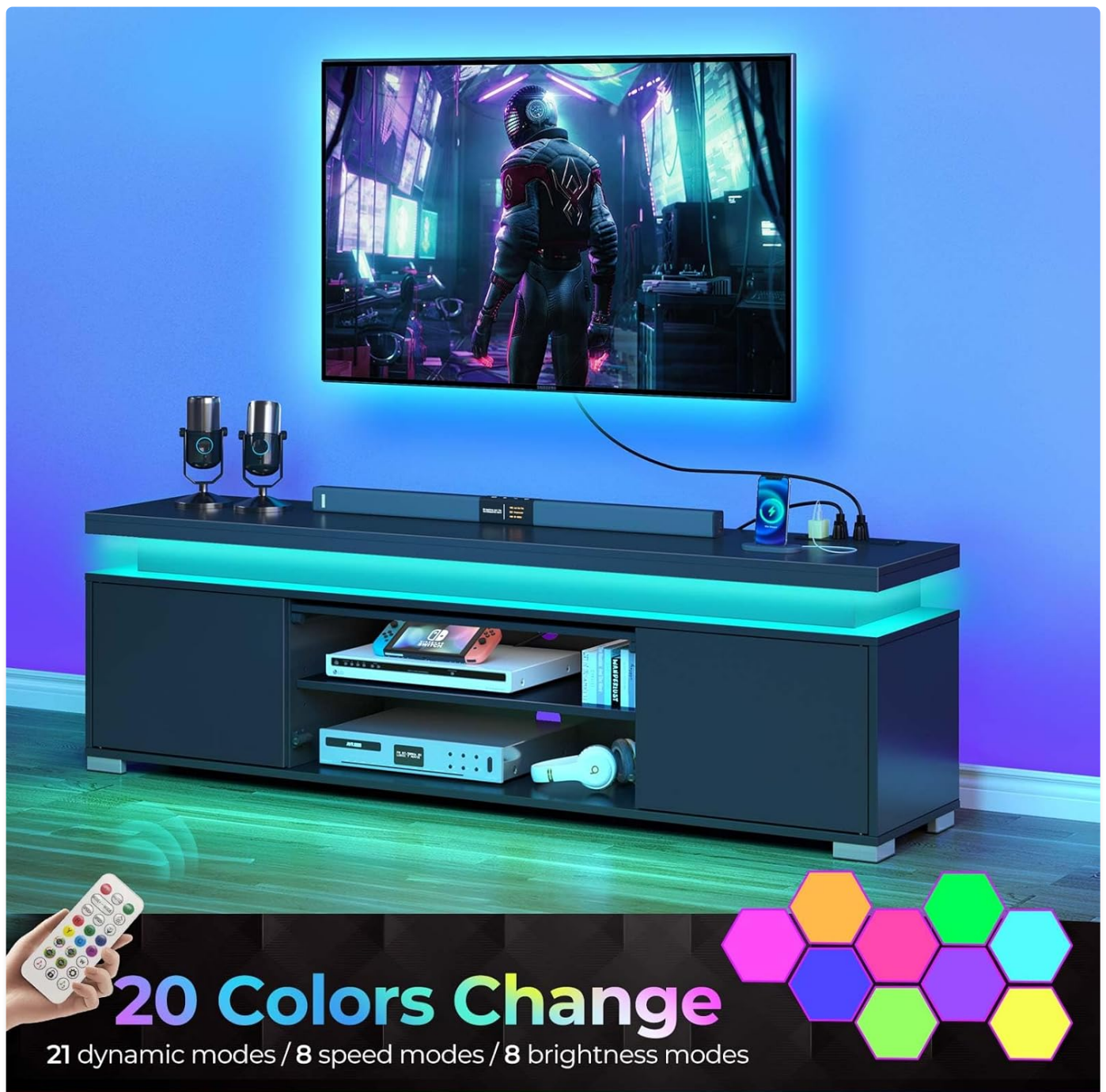
Figure 5.1: LED Lights and Remote Control