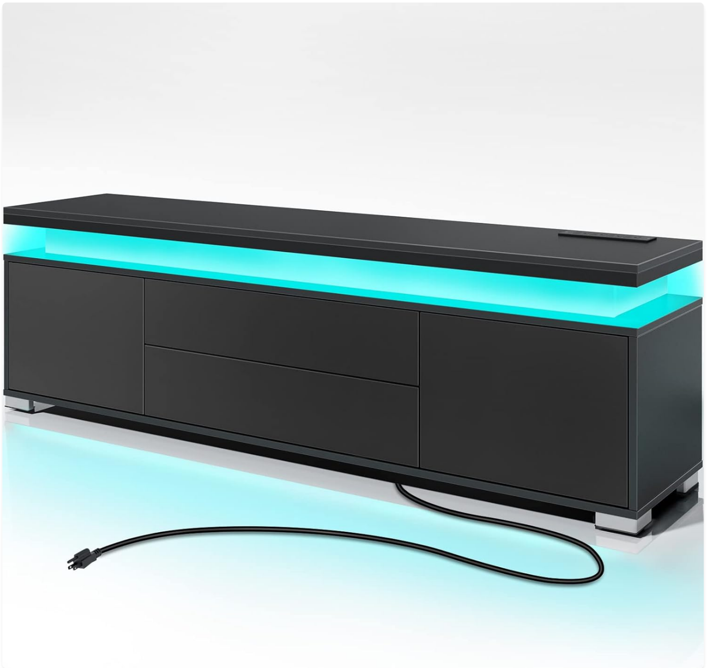
Figure 1.1: Rolanstar TV Stand with LED Lights