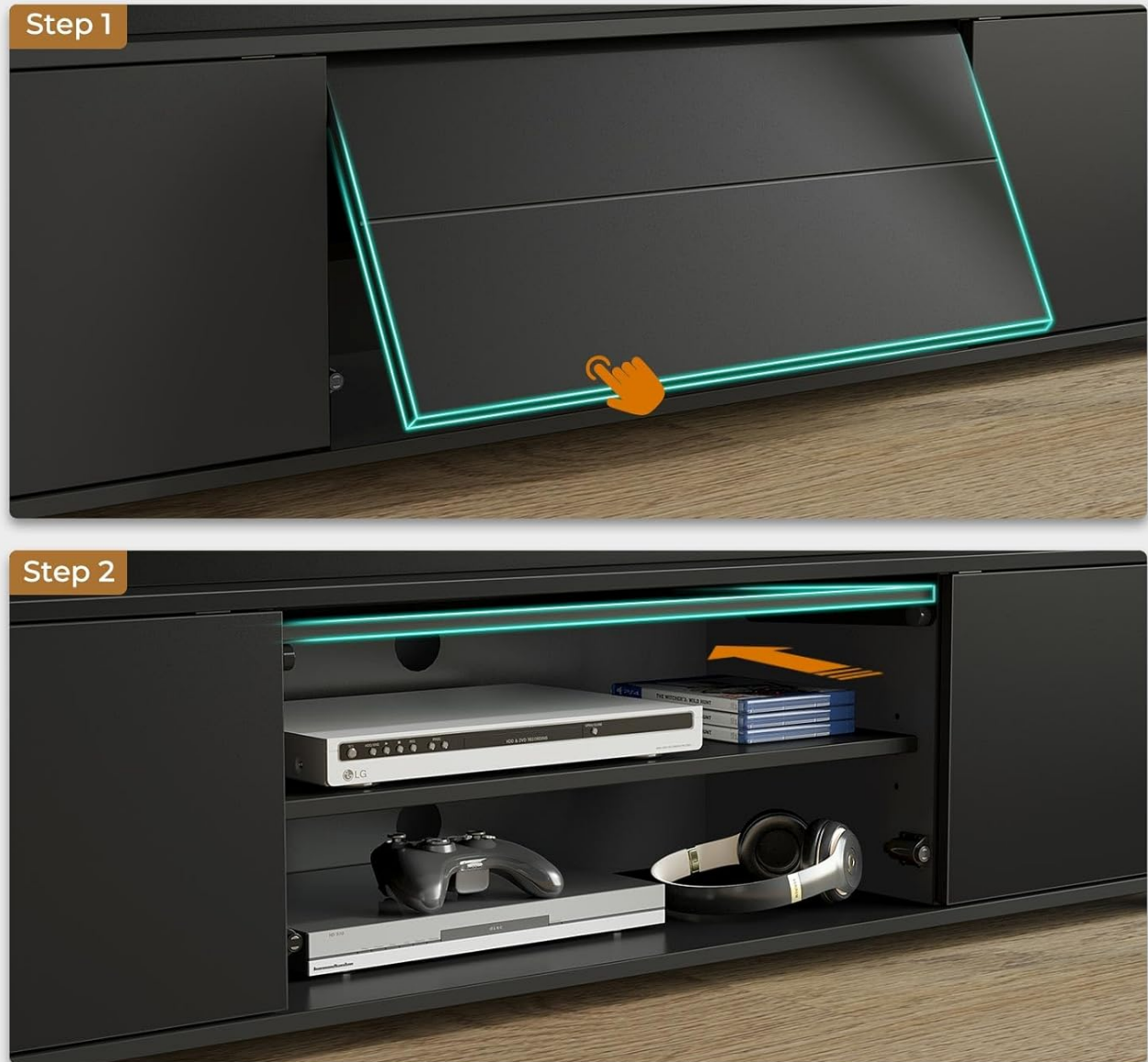
Figure 5.4: Unique Sliding Rail Door Operation