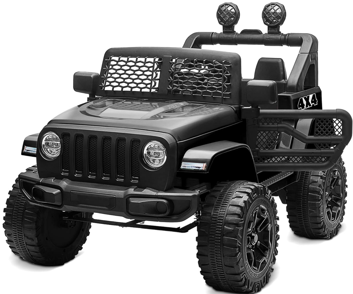
Image: Fully assembled Kidzone 12V Electric Ride-On Truck.