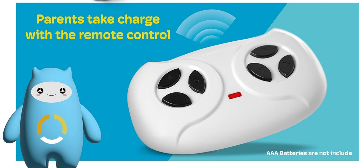
Image: Child driving the truck and the parental remote control.