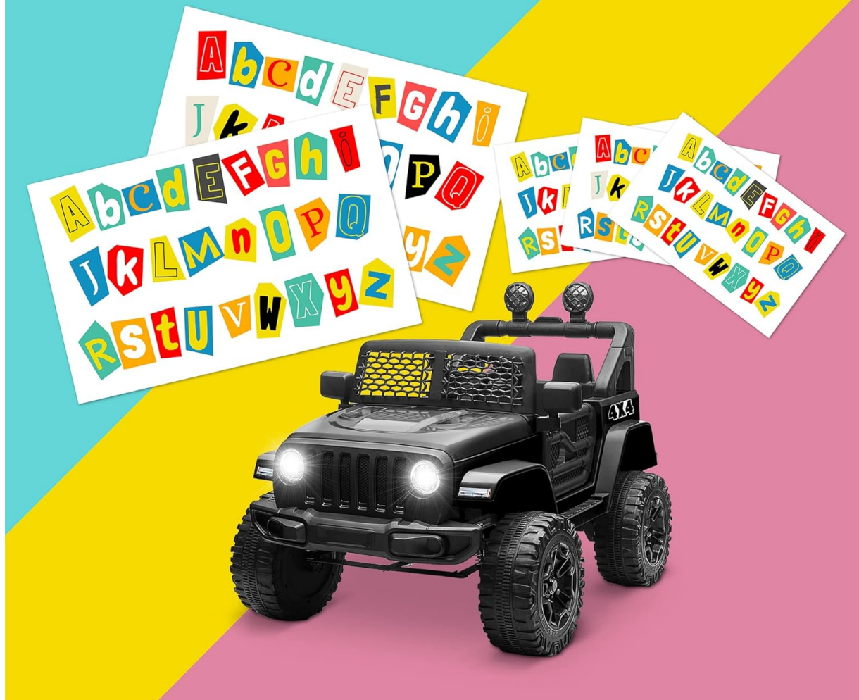
Image: DIY License Plate stickers for personalization.