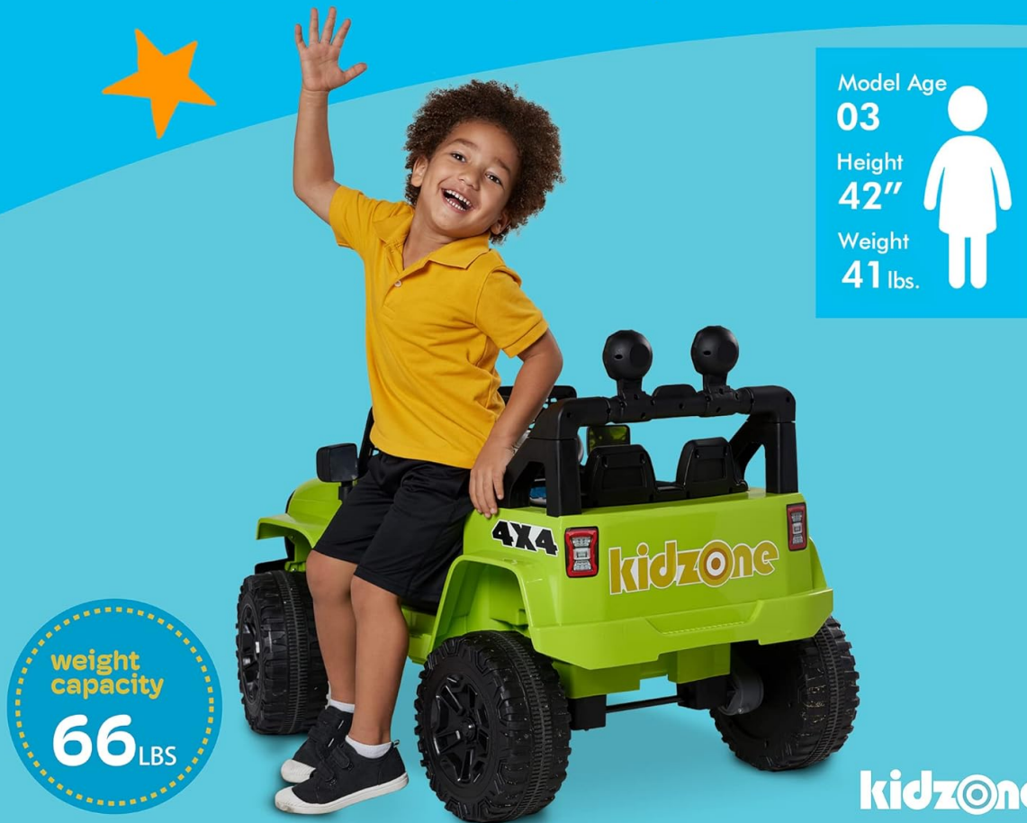
Image: Age, height, and weight guidelines for the ride-on truck.