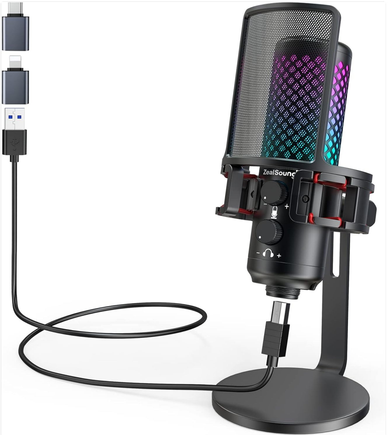
Image: The ZealSound KM8 Series USB Microphone fully assembled on its desktop stand, with various adapters shown.