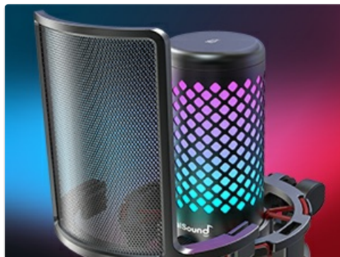
Image: Close-up of the ZealSound KM8 Series microphone with the pop filter attached, showing the mesh screen.

Secure the detachable pop shield screen to the microphone or stand to minimize plosive sounds during recording.