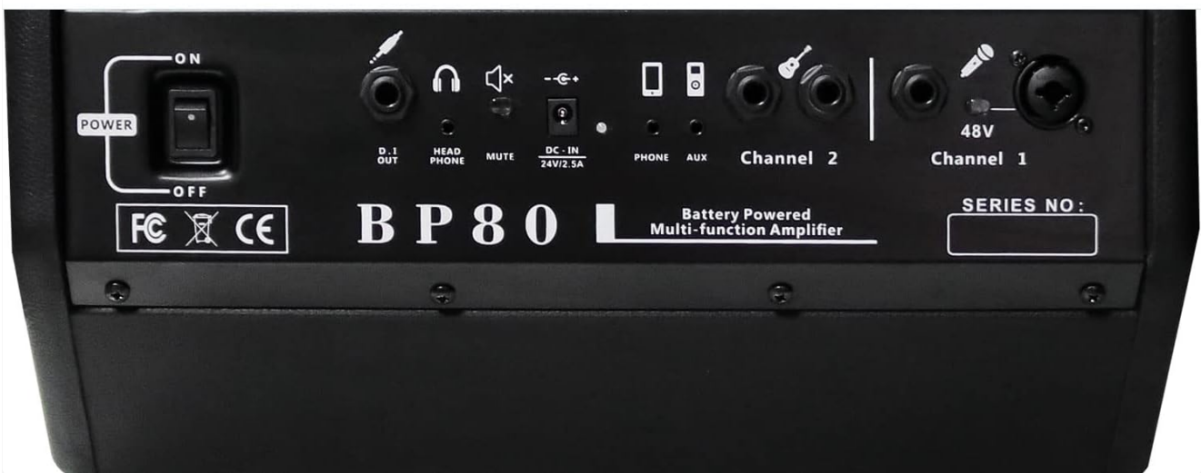
Figure 2: Rear panel of the BP80 amplifier, detailing the various input and output ports.