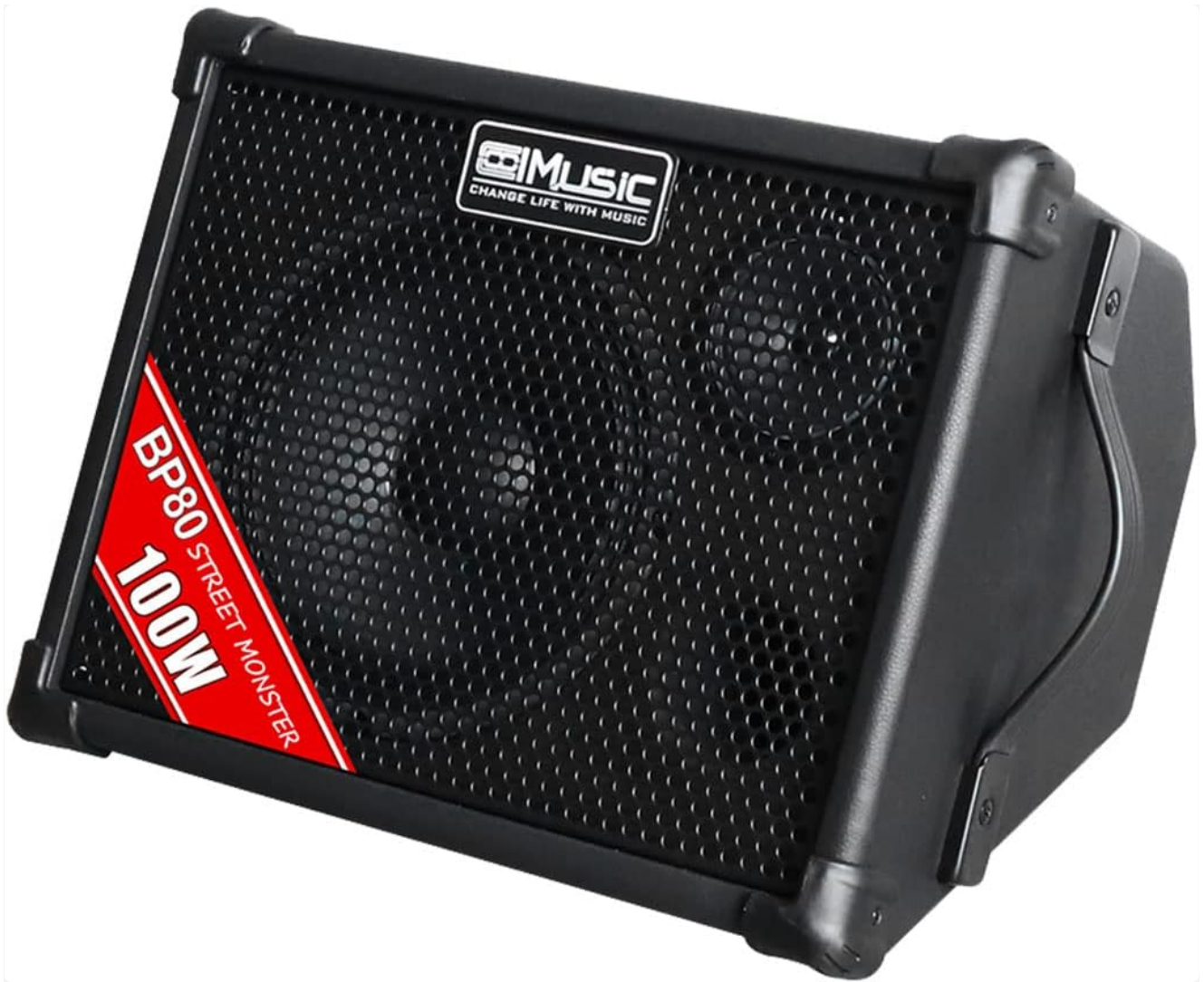
Figure 1: Front angled view of the Coolmusic BP80 amplifier, showcasing its compact and robust design.