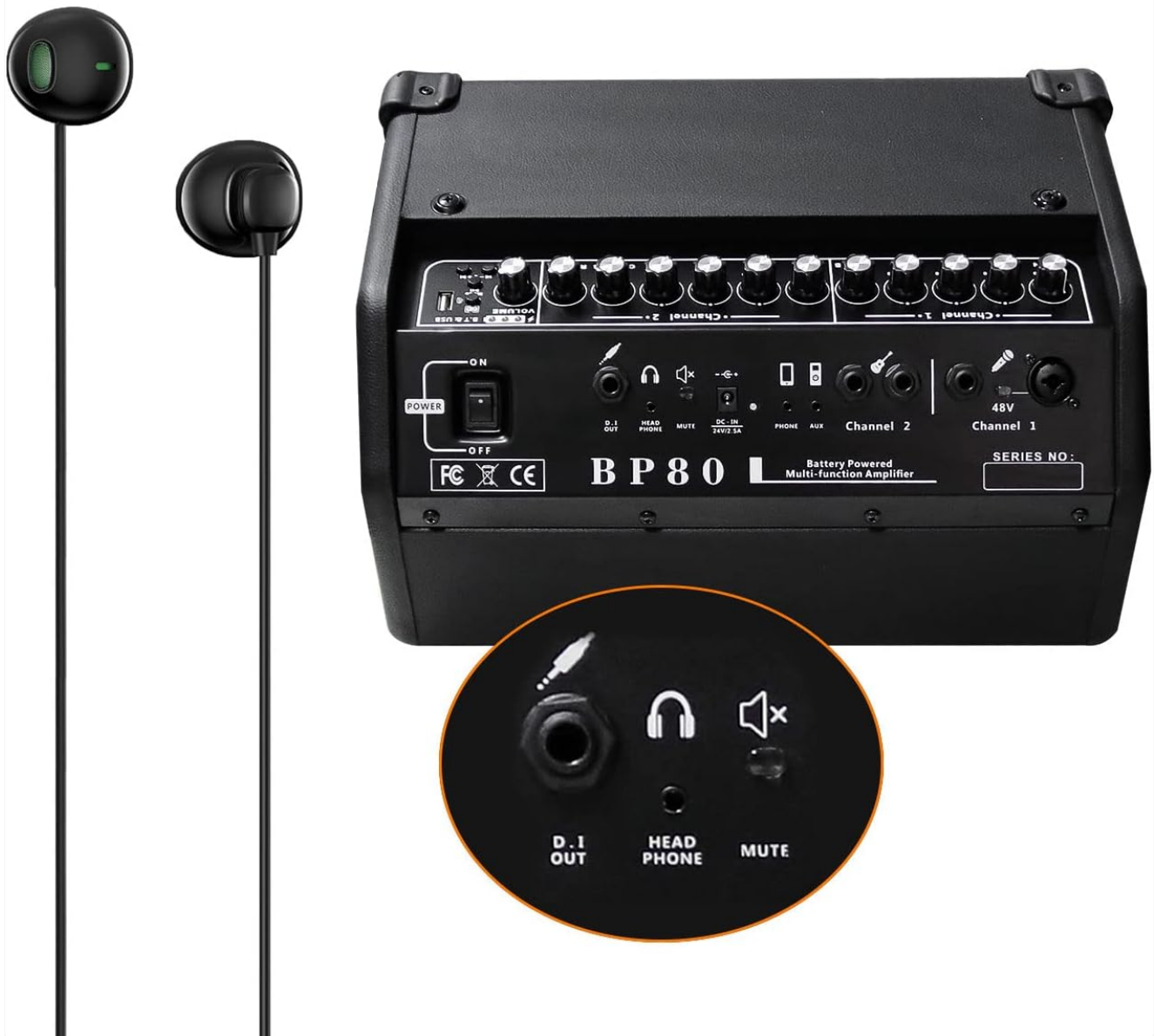
Figure 4: The BP80 amplifier demonstrating its Bluetooth connectivity with various smart devices.