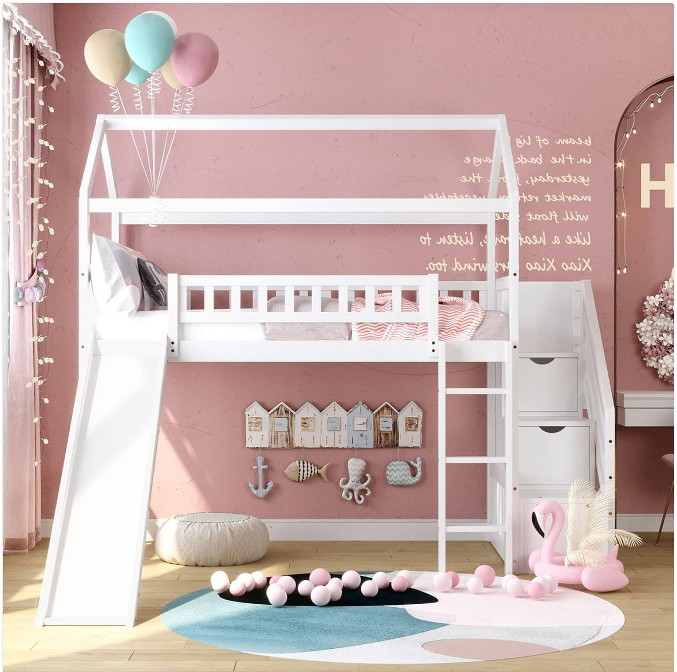
Image 1.1: The VilroCaz House-Shape Twin Loft Bed, showcasing its design and integrated slide and staircase.