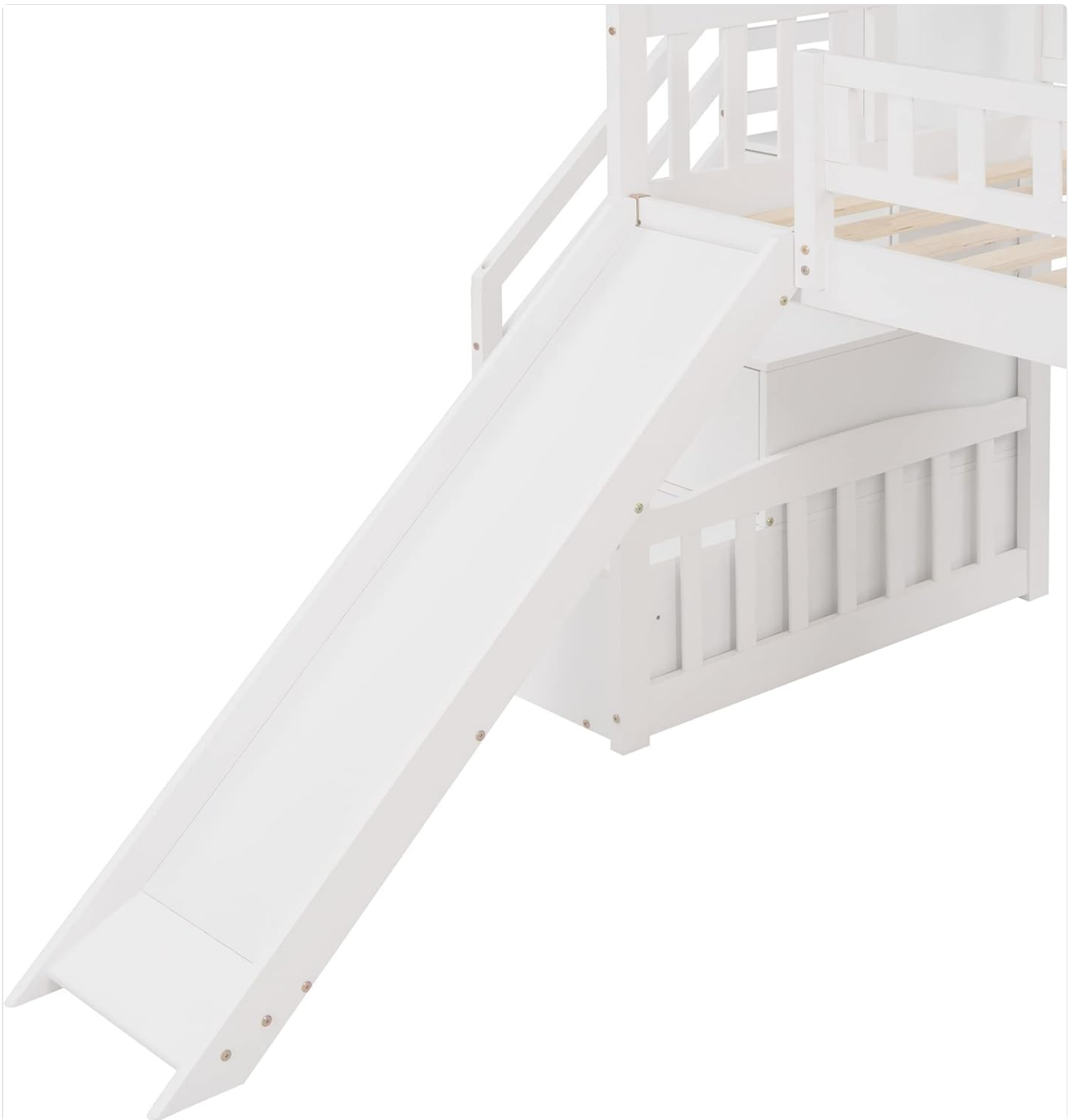
Image 3.2: Detail of the slide, illustrating its attachment to the bed frame.