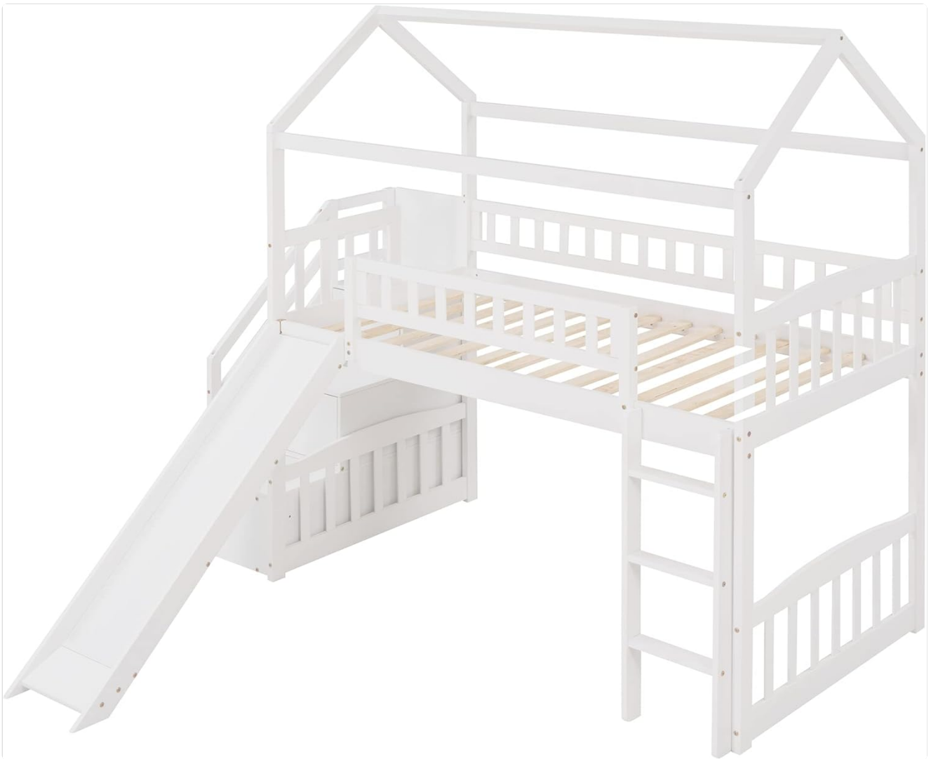
Image 2.2: Front view of the assembled loft bed, highlighting the house-shape design and slide.