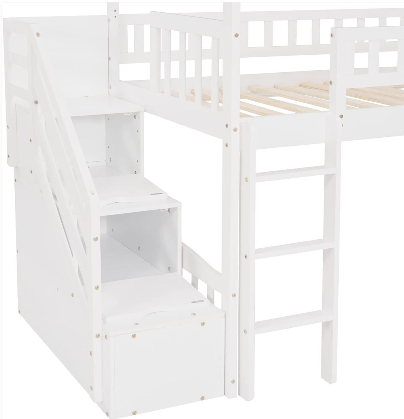
Image 3.1: Detail of the integrated storage staircase, showing the drawers and steps.