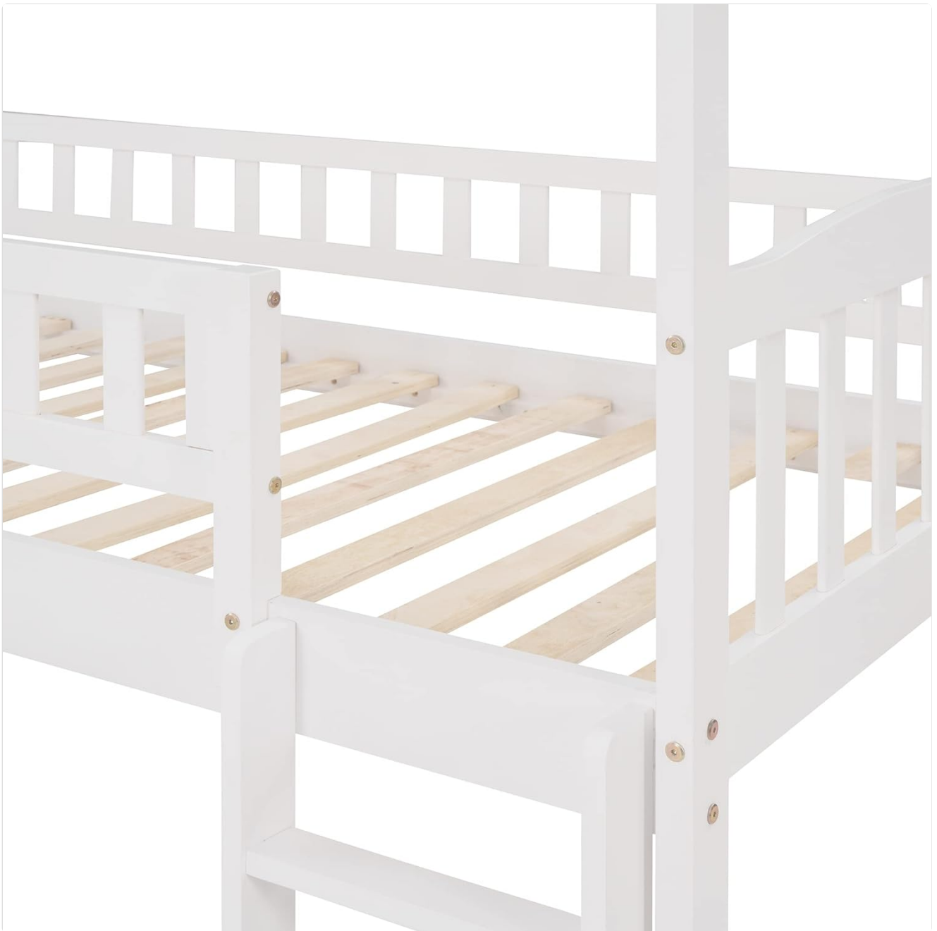
Image 4.1: Detail of the bed slats, showing the support structure for the mattress.