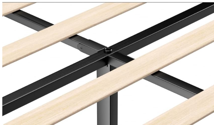
Image 4.1: Detailed view of bed frame components, including velcro slats, sturdy bed legs, and durable metal support.