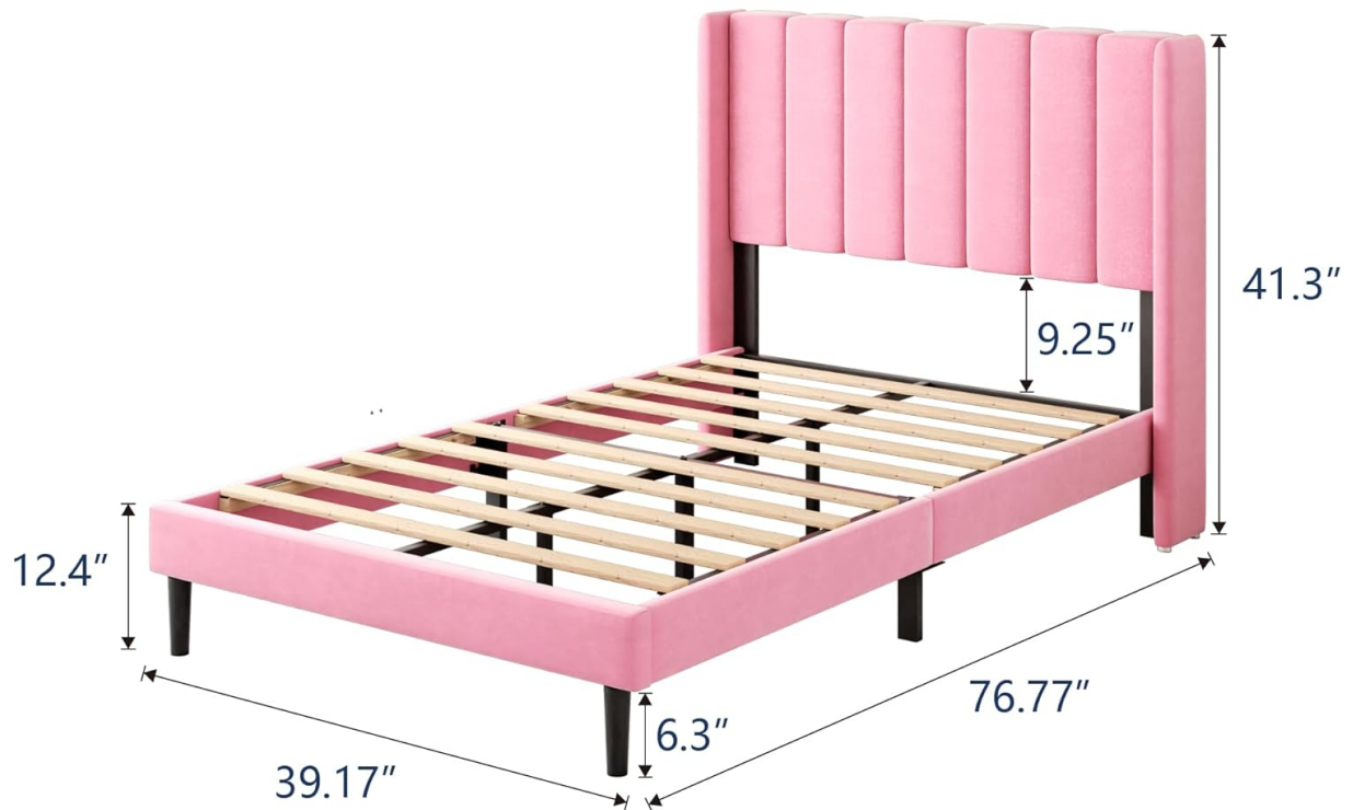
Image 9.1: Diagram illustrating the dimensions of the Twin Size bed frame.