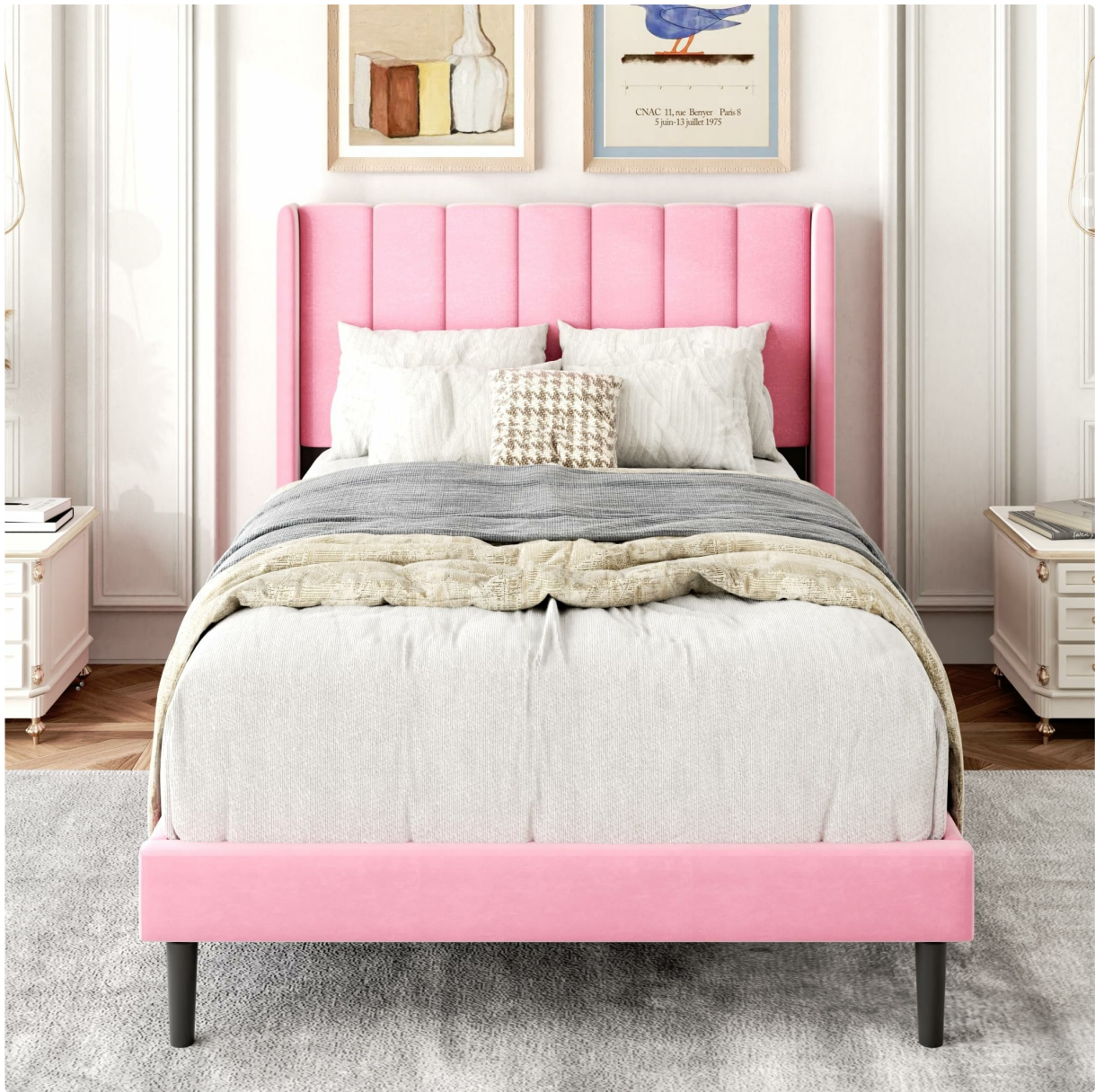
Image 1.1: Gruwans Twin Size Bed Frame with Wingback Headboard in Pink Velvet.