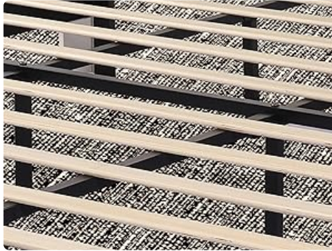
Image 6.1: Mattress placed directly on the bed frame, illustrating that no box spring is needed.

Once assembled, your Gruwans bed frame is ready for use. Simply place your mattress directly onto the wooden slats. The robust slat system is designed to support your mattress without the need for a box spring, providing optimal breathability and comfort.