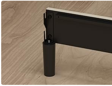
Image 5.1: Illustration demonstrating the easy assembly process for the bed frame.