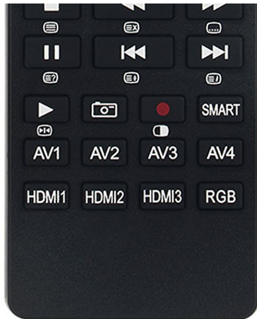
Image: The front of the VINABTY replacement remote control, displaying all buttons and their labels for various TV functions.