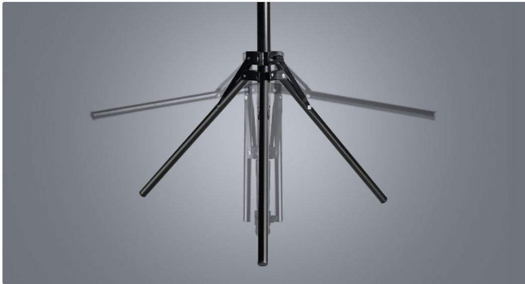
Image: Illustration of the light stand's reverse-folding mechanism for compact storage and stability.