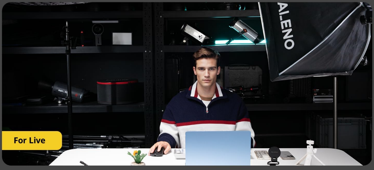
Image: Examples demonstrating the use of the softbox for studio video fill lighting in various scenarios, including for TikTok and live streaming.