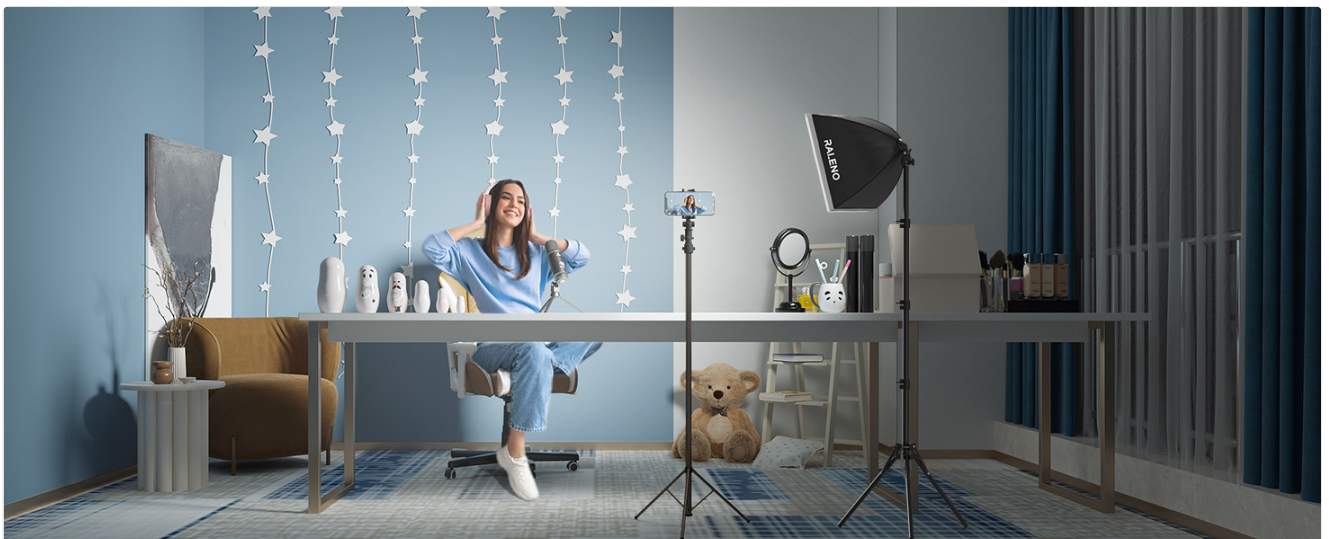
Image: A woman streaming online, illuminated by the RALENO softbox light, demonstrating its use in a home studio setup.