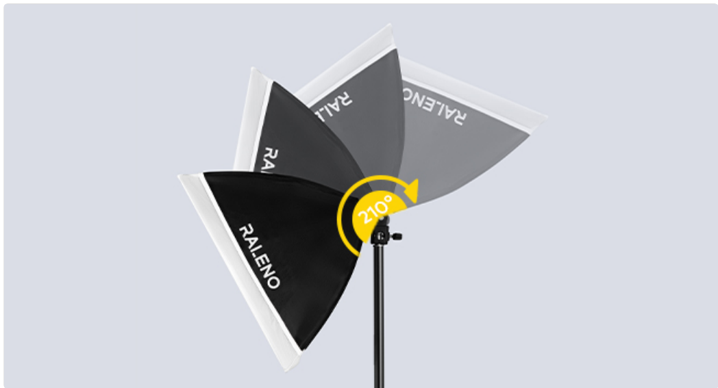
Image: The softbox head can be rotated up to 210 degrees for flexible lighting angles.