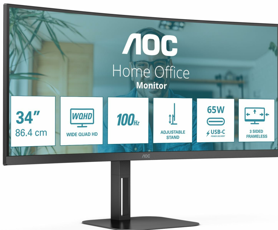
Image: Front view of the AOC CU34V5C monitor, illustrating its curved screen and adjustable stand.