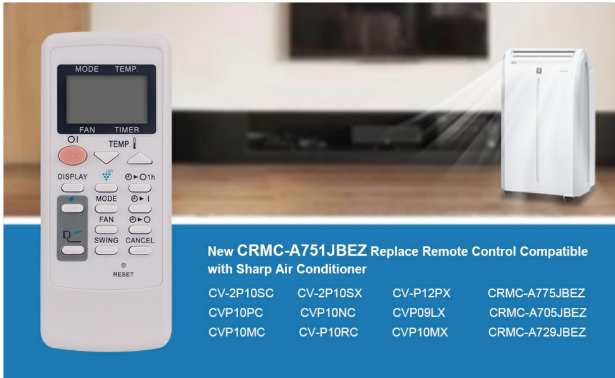
Image: The AULCMEET CRMC-A751JBEZ remote control displayed alongside a Sharp portable AC unit, illustrating its compatibility.