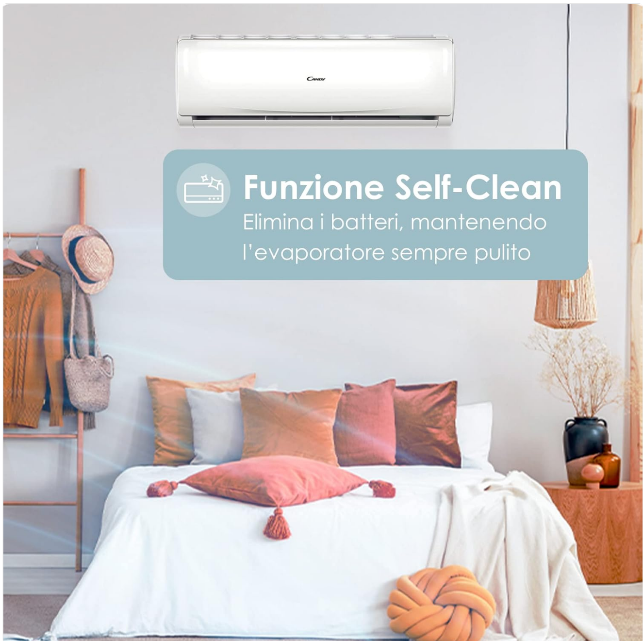
Figure 5: Self-Clean function. The image highlights the Self-Clean function of the air conditioner, indicating its capability to maintain internal cleanliness and hygiene.

To activate the Self-Clean function, refer to your remote control or hOn app instructions. It is recommended to use this function periodically, especially during high usage seasons.