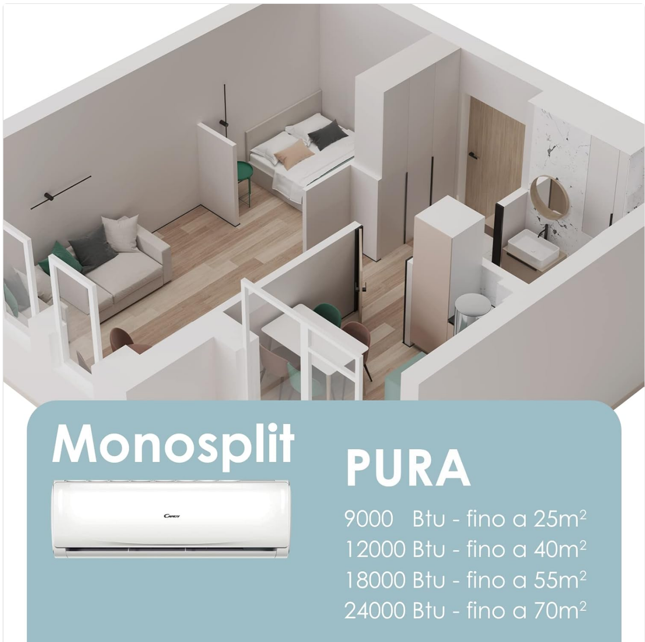
Figure 2: Room size recommendations for Candy Pura air conditioners. A diagram illustrating recommended room sizes in square meters for various BTU capacities of the Candy Pura monosplit air conditioners, including the 24000 BTU model suitable for up to 70 m 2 .