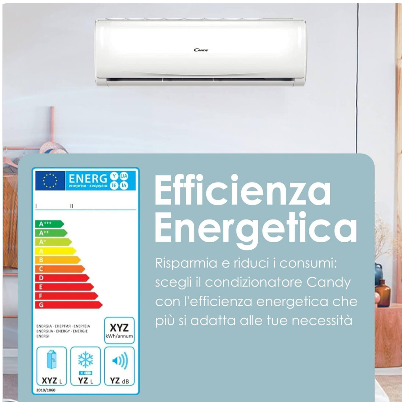
Figure 6: Energy efficiency label. An energy label is displayed, detailing the energy efficiency ratings (A++ for cooling, A+ for heating) of the Candy Smart Linea Pura air conditioner.