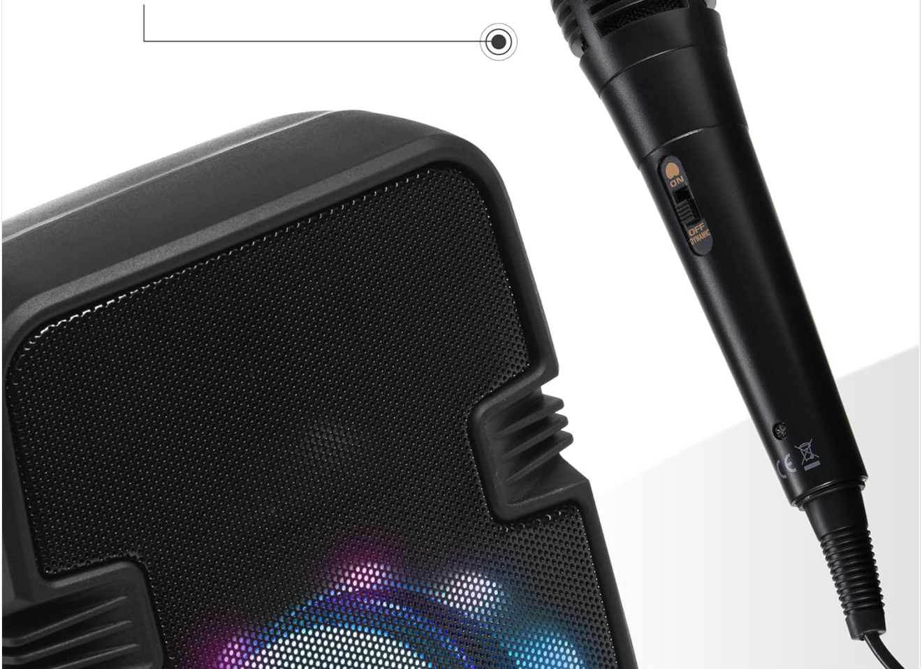
Image: A close-up view of the wired microphone, ready for connection to the speaker.