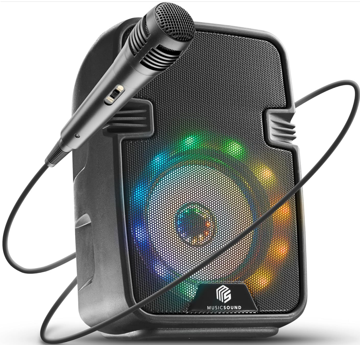
Image: The Music Sound Karaoke Speaker, showing its main unit with integrated LED lights and the included wired microphone.