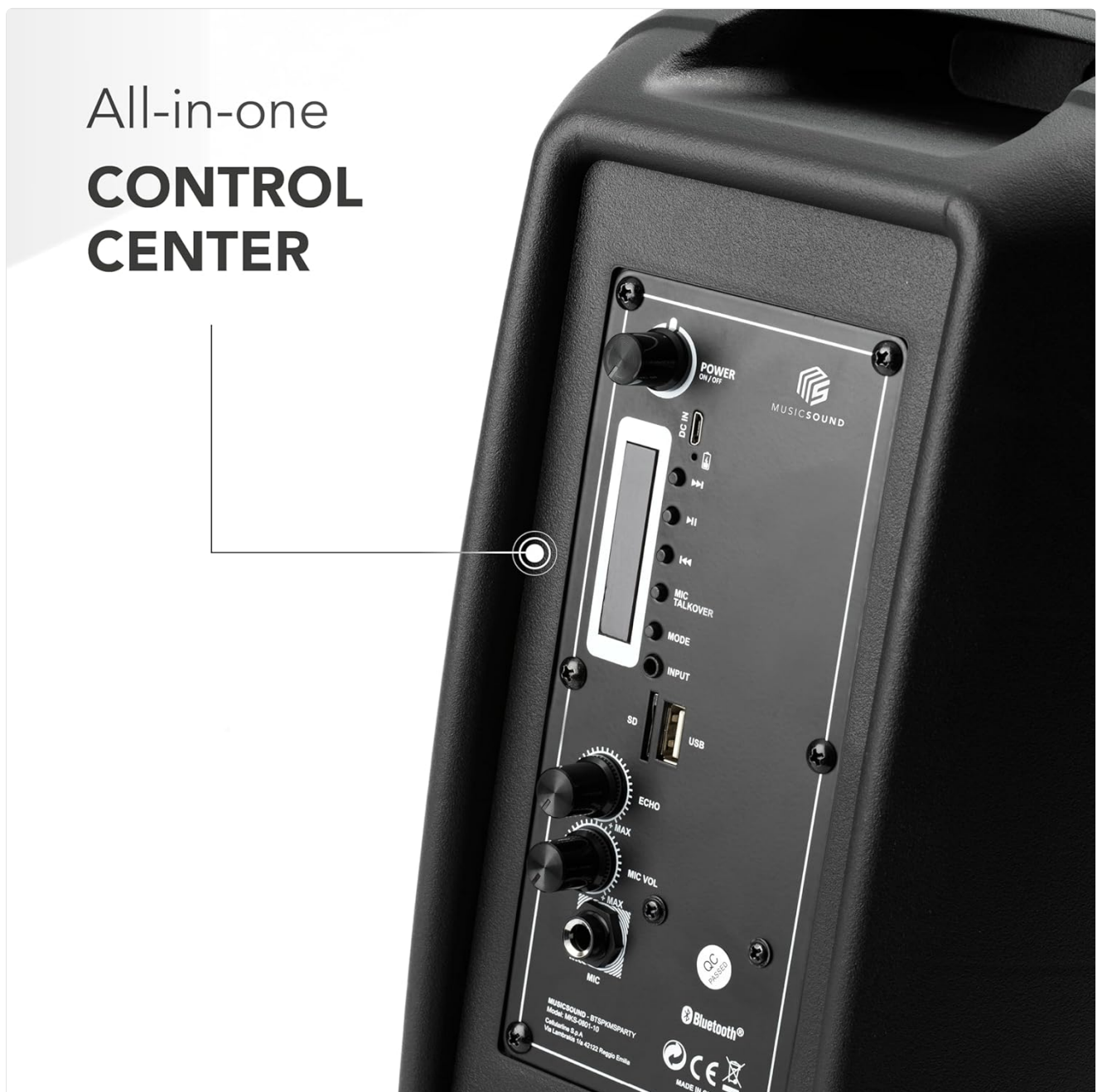
Image: A detailed view of the speaker's control panel, highlighting the power, volume, echo, and microphone input controls, along with USB and SD card slots.