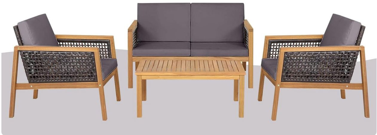
Figure 1: Key features of the PATIOJOY Outdoor Furniture Set, highlighting structural integrity and comfort elements.