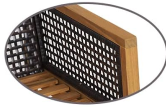
Ergonomic Armrest Structure