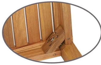
Reinforced Triangular Structure