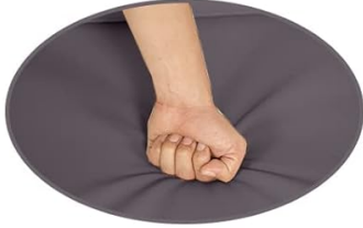
Soft Padded Cushion