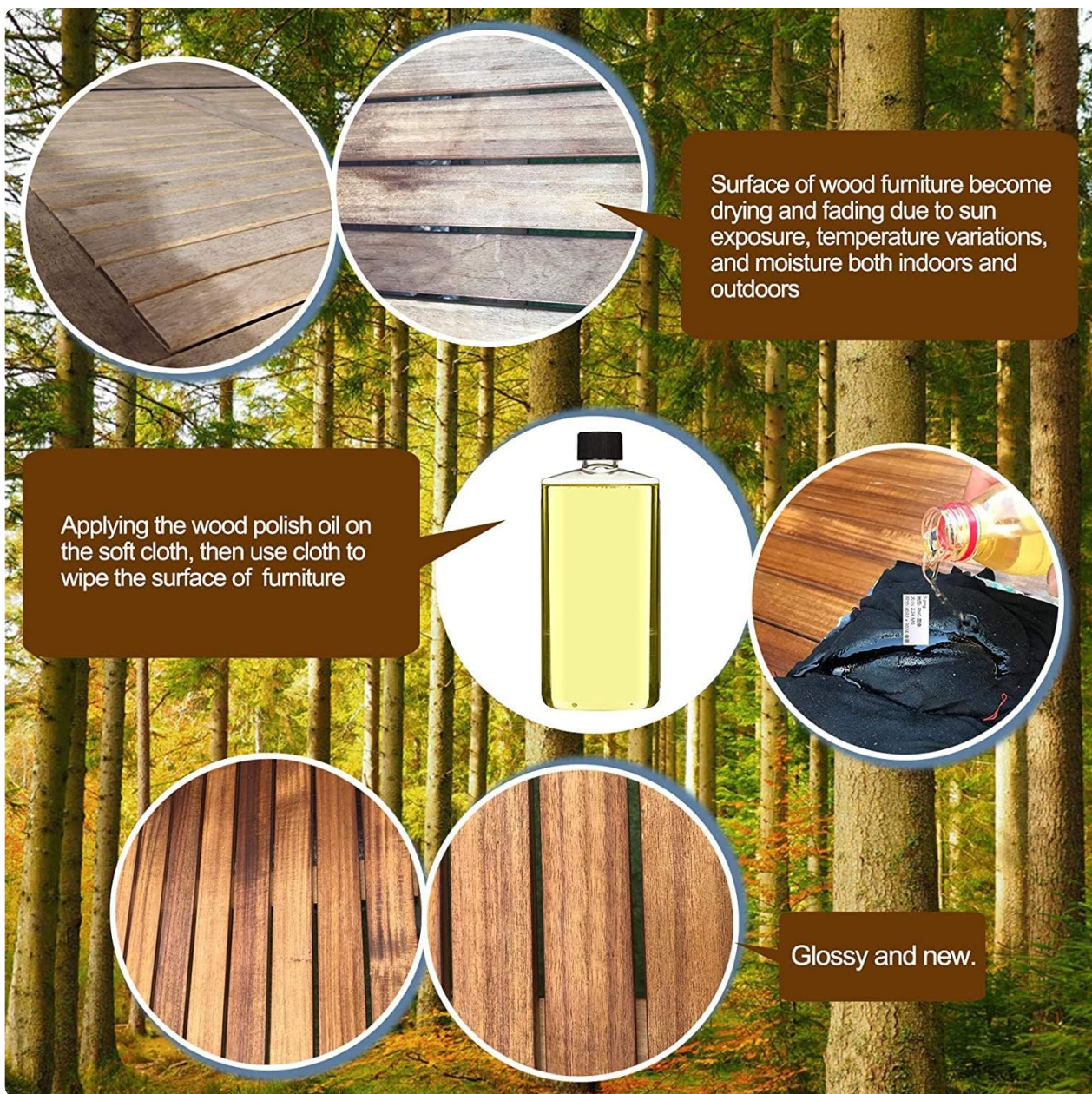
Figure 8: Instructions for wood maintenance, demonstrating how to apply wood polish oil to restore shine.