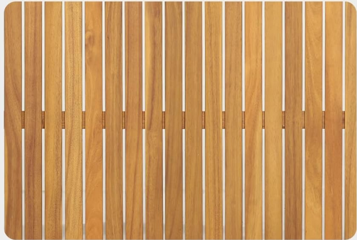
Figure 2: Material quality of the set, showcasing the high-quality mix brown PE rattan and solid acacia wood.