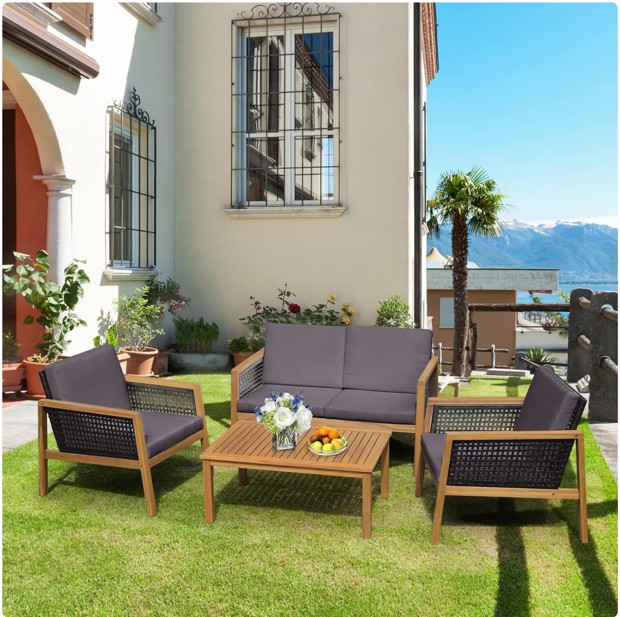
Figure 5: The furniture set comfortably arranged on a lawn, demonstrating its suitability for garden use.