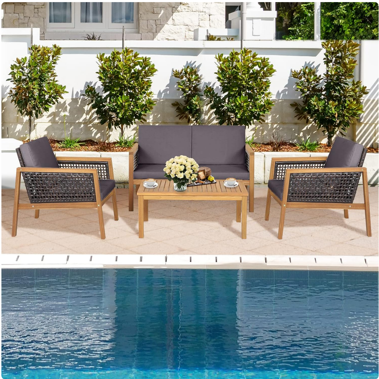
Figure 6: The furniture set by a poolside, illustrating its versatility for different outdoor leisure areas.