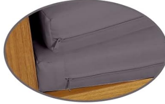
Zipper Design for Easy Cleaning