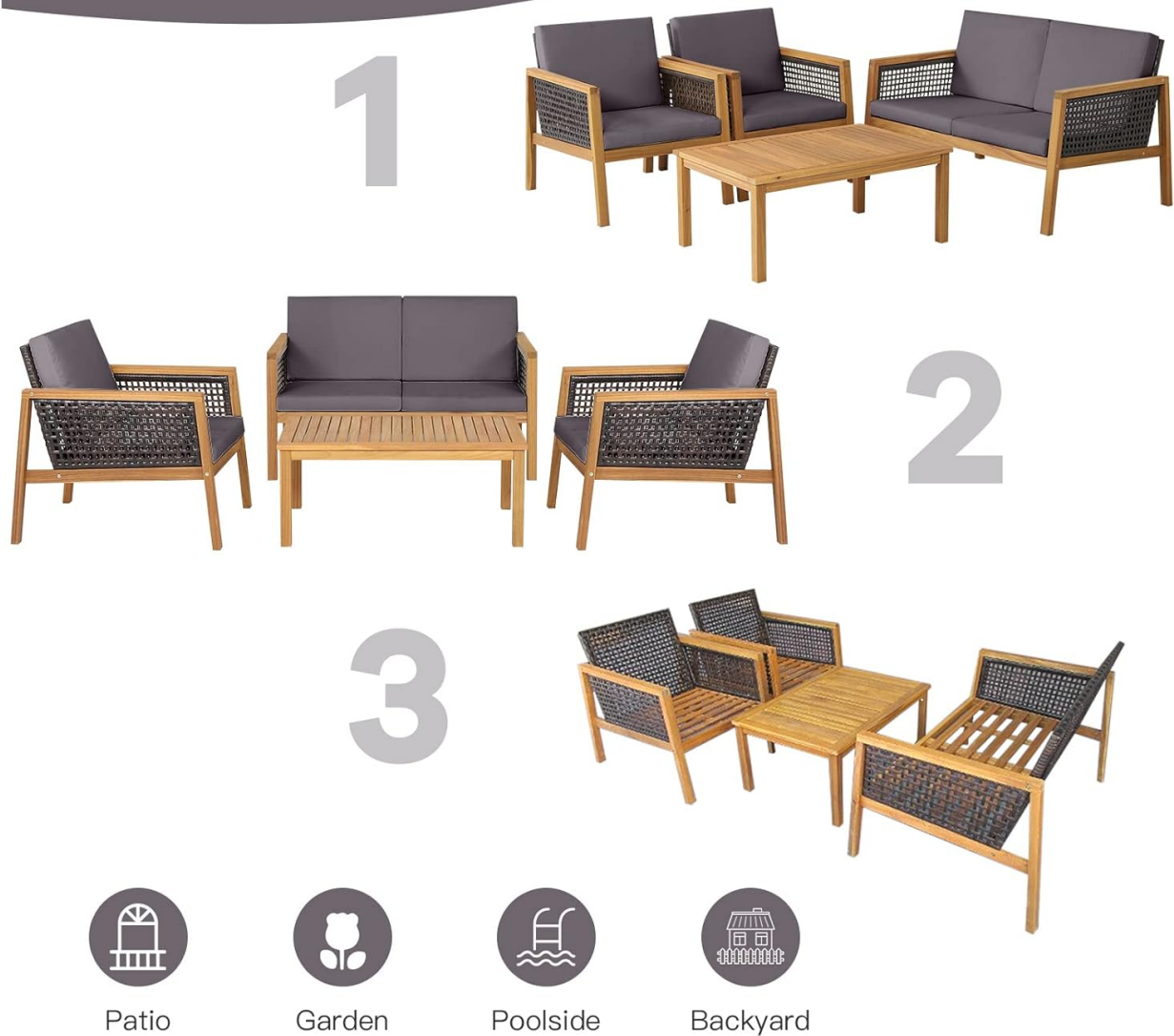
Figure 4: Examples of various combinations suitable for different outdoor settings like patio, garden, poolside, and backyard.