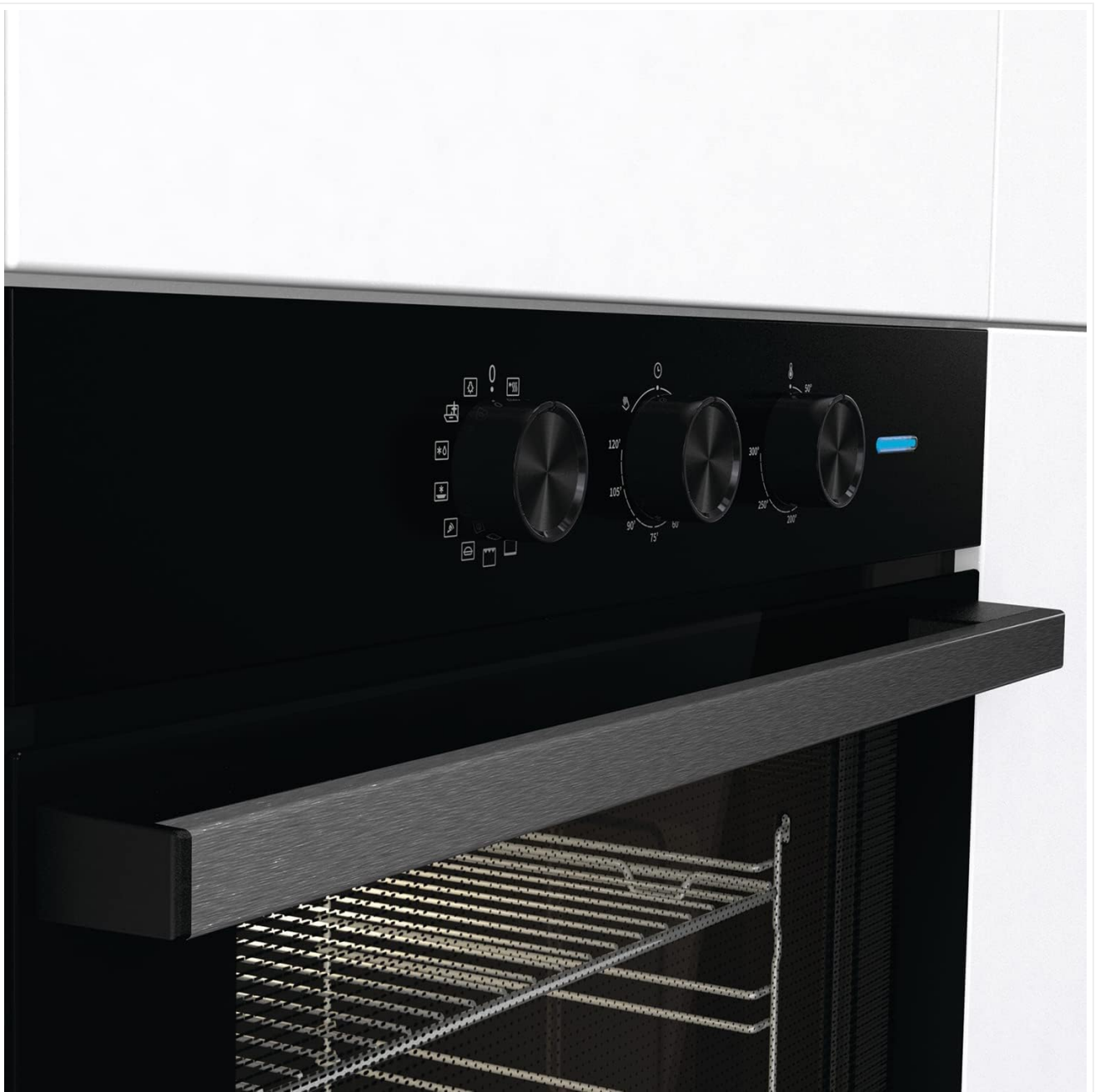
Figure 3.2: Close-up of the oven's control panel, showing the function selector, temperature knob, and timer.