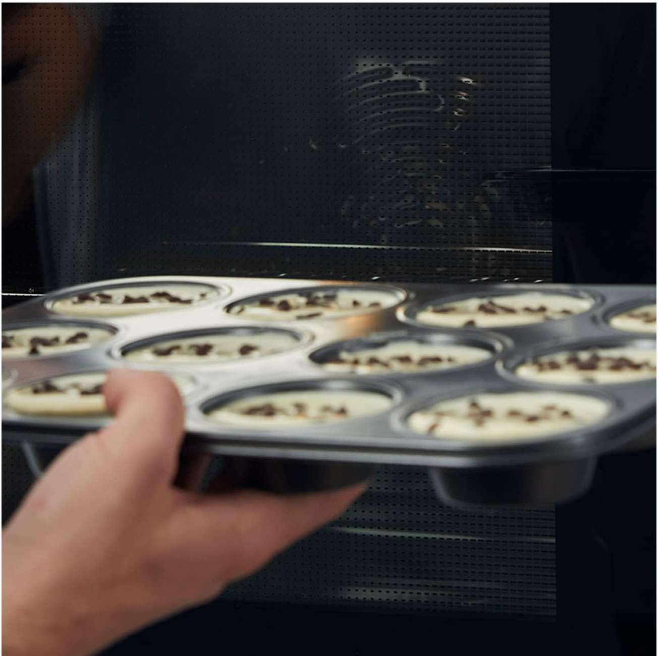
Figure 5.2: Demonstrating the ease of placing food into the oven cavity for cooking.