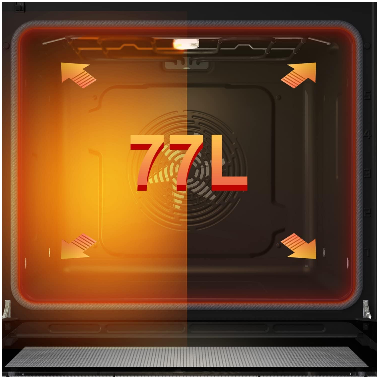
Figure 5.1: Illustration of the 77-liter XXL cavity, highlighting its spacious design and efficient heat distribution.