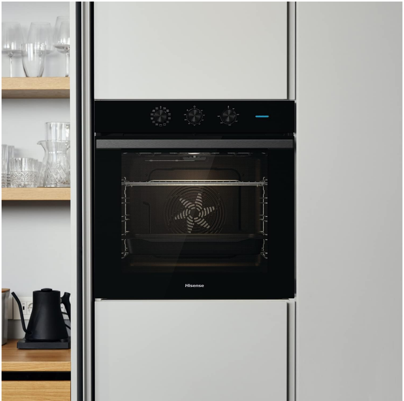
Figure 3.3: The oven's wire rack and baking tray, designed for versatile cooking.