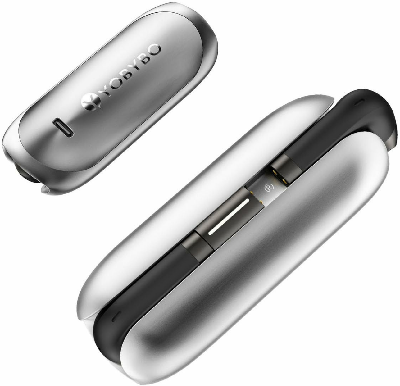
Image: The YOBYBO X-BOAT Pro earbuds and their sleek charging case, showcasing the innovative open design.