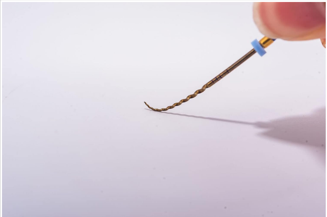
Image 5.2: A close-up view demonstrating the high flexibility of an Easyinsmile X-Pro Gold Taper NITI Rotary Endodontic File, a key characteristic for navigating complex root canal anatomies.