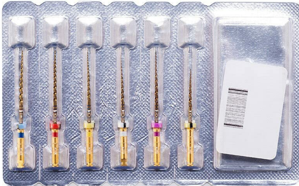
Image 3.1: The files are securely packaged in a blister pack, ensuring sterility and protection during transport.