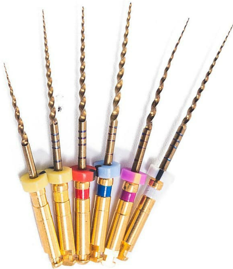
Image 1.1: A complete set of Easymile X-Pro Gold Taper NITI Rotary Endodontic Files, showcasing the various sizes and their distinct color-coded handles.

The X-Pro Gold Taper NITI files are specifically engineered for endodontic treatments, offering superior properties in ductility, fatigue resistance, recoverable strain, biocompatibility, and corrosion resistance. They are available in 25mm length and various sizes including F1, F2, F3, SX, S1, S2, and assorted packs.