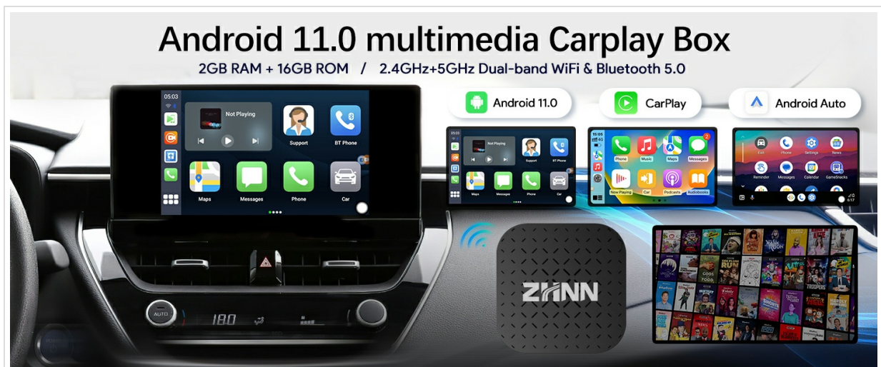
Image: The Android 11 multimedia Carplay Box interface displayed on a car's screen, showing various app icons like BT Phone, Car, BT Music, Settings, Autokit, Gallery, Play Store, and YouTube, along with media playback controls.

Once connected, your car's screen will display the Android 11.0 interface. You can navigate using the touchscreen or your car's existing controls (knob, steering wheel buttons).