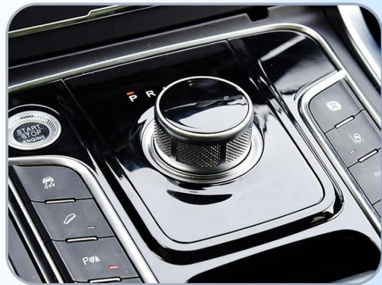
OEM Knob Control

Image: A collage of four images showing different control methods within a car's interior: Siri Voice Control, Touch Screen, Steering Wheel Control, and OEM Knob Control, all compatible with the Carplay AI Box.