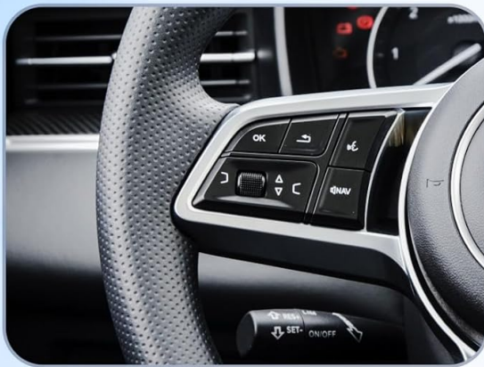
Steering Wheel Control