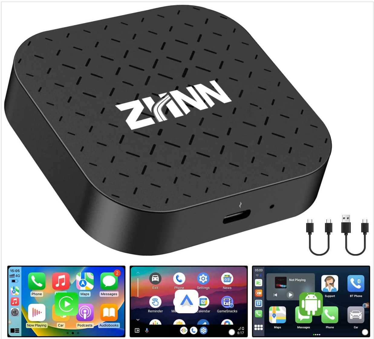
Image: The ZHNN Carplay AI Box, a compact black square device, is shown alongside two USB cables (USB-C to USB-C and USB-A to USB-C) and a user manual, illustrating the complete package contents.