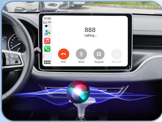
Siri Voice Control

Support the original car control, convenient and smooth to use