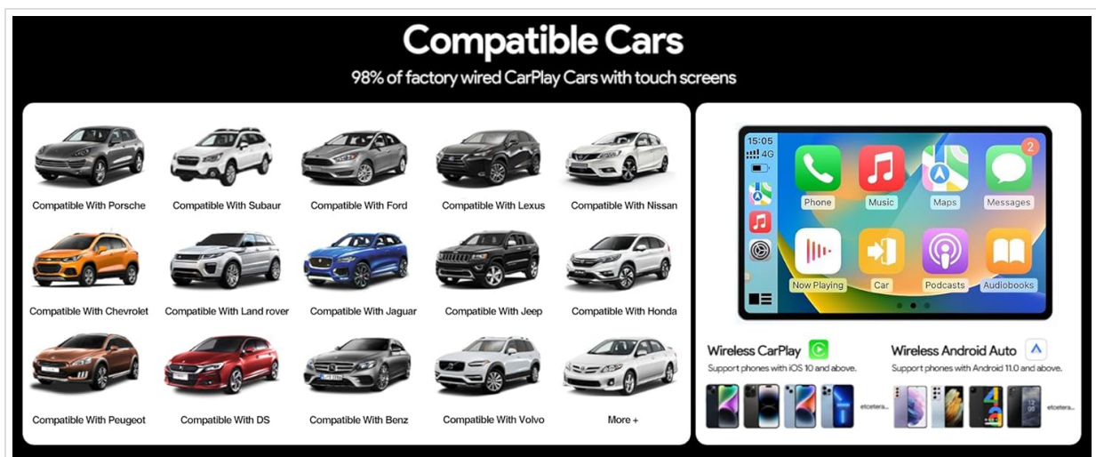
Image: A graphic illustrating the compatibility of the Carplay AI Box with 98% of factory wired CarPlay cars with touchscreens. It lists various compatible car brands (e.g., Porsche, Subaru, Ford, Lexus, Nissan, Chevrolet, Land Rover, Jaguar, Jeep, Honda, Peugeot, DS, Benz, Volvo) and specifies support for iPhones with iOS 10+ and Android phones with Android 11.0+.

Note: This AI Box is not compatible with BMW cars or Samsung phones.