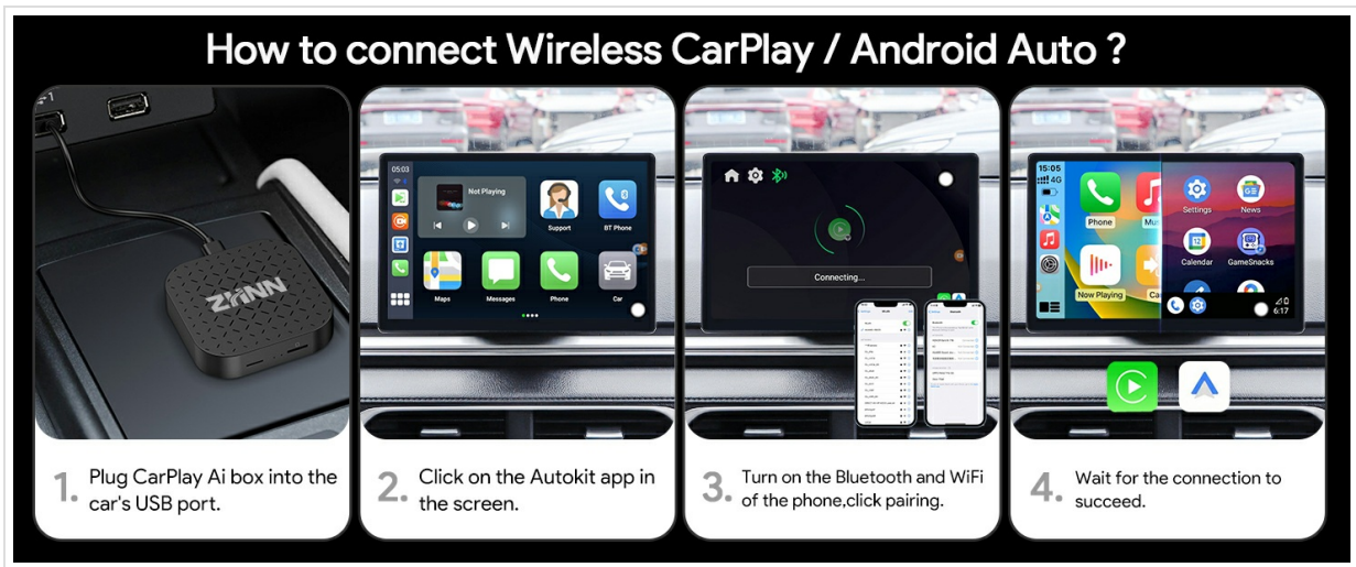
Image: A four-step visual guide demonstrating how to connect the ZHNN Carplay AI Box. It shows plugging the box into the car's USB port, clicking the Autokit app on the screen, turning on Bluetooth and Wi-Fi for phone pairing, and finally, waiting for a successful connection.

Your browser does not support the video tag.