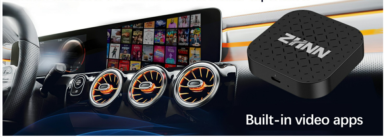
Image: A car's infotainment screen displaying various streaming video applications such as Netflix, TikTok, and Disney+, indicating the multimedia capabilities of the Carplay AI Box.

Watch videos for a romantic drive-in theater experience.