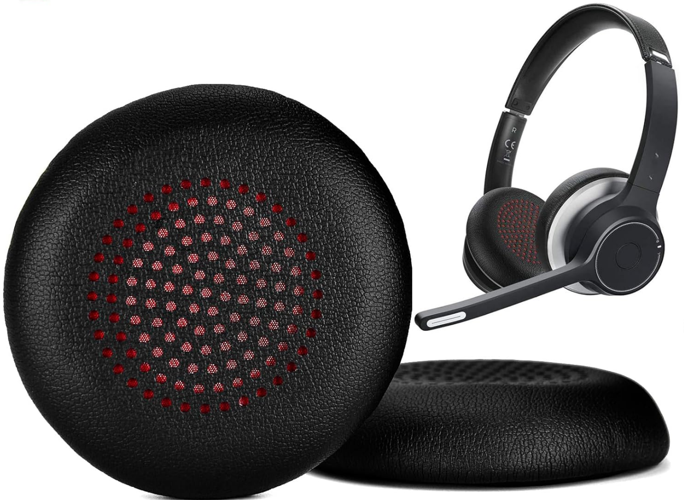
Image: Visual confirmation of compatibility, displaying the ear pads alongside an MPOW HC5/HC6 headphone, highlighting the intended use.