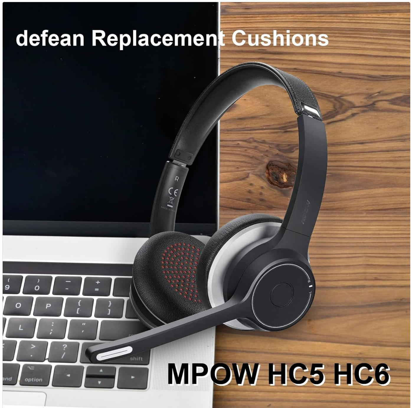
Image: An MPOW HC5/HC6 headphone, fitted with the defean replacement ear pads, demonstrating the final installed appearance.

Note: Installation may require some patience to ensure a proper and secure fit. Do not apply excessive force.