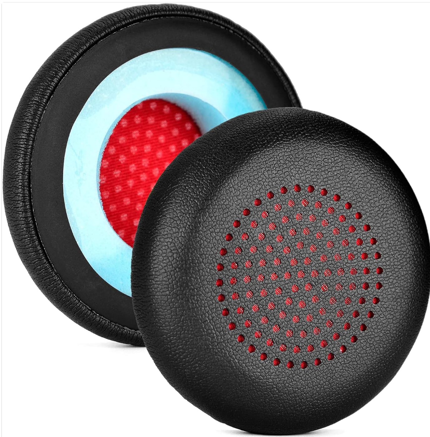
Image: A pair of deafean replacement ear pads, showcasing their black protein leather exterior and the red perforated inner mesh designed for sound transmission.