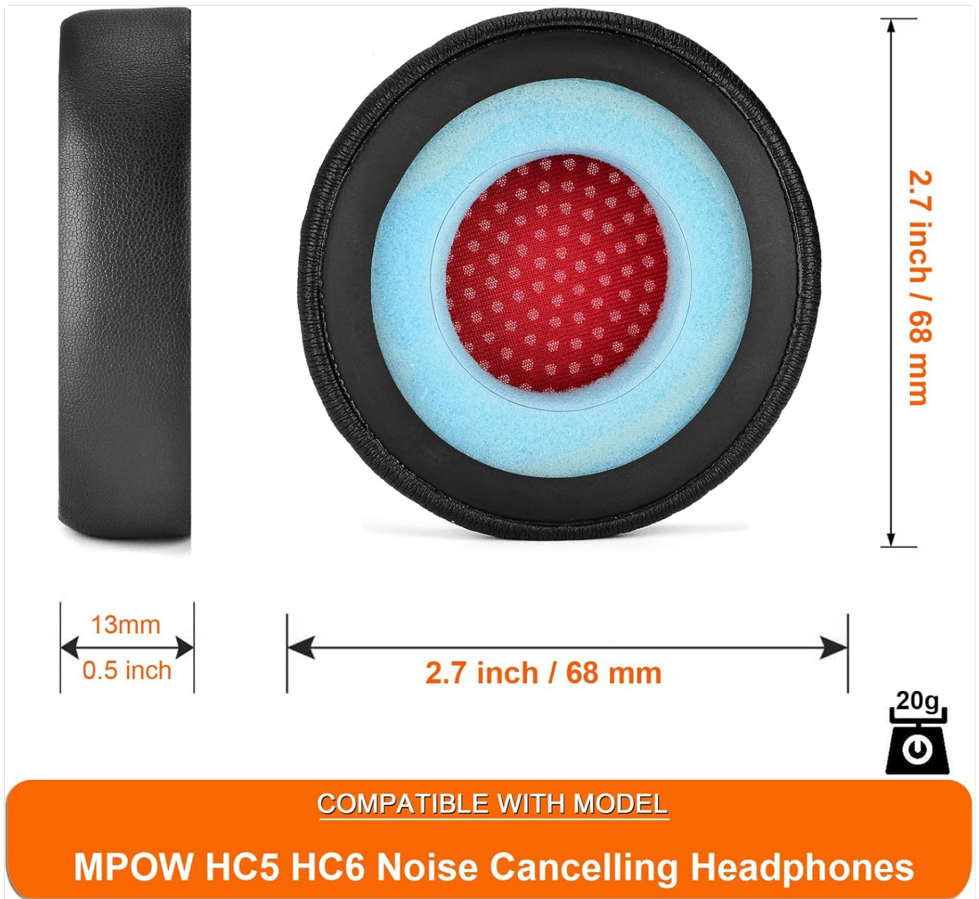
Image: A technical diagram illustrating the precise dimensions of the ear pads, including diameter and thickness, for accurate fitment.