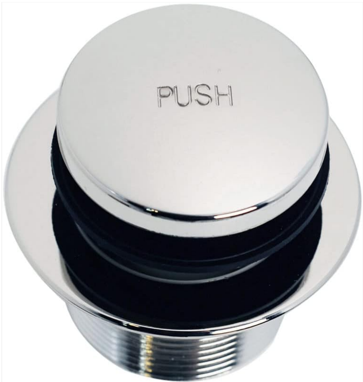
Image: Close-up of the tip-toe drain plug, indicating the 'PUSH' mechanism for operation.