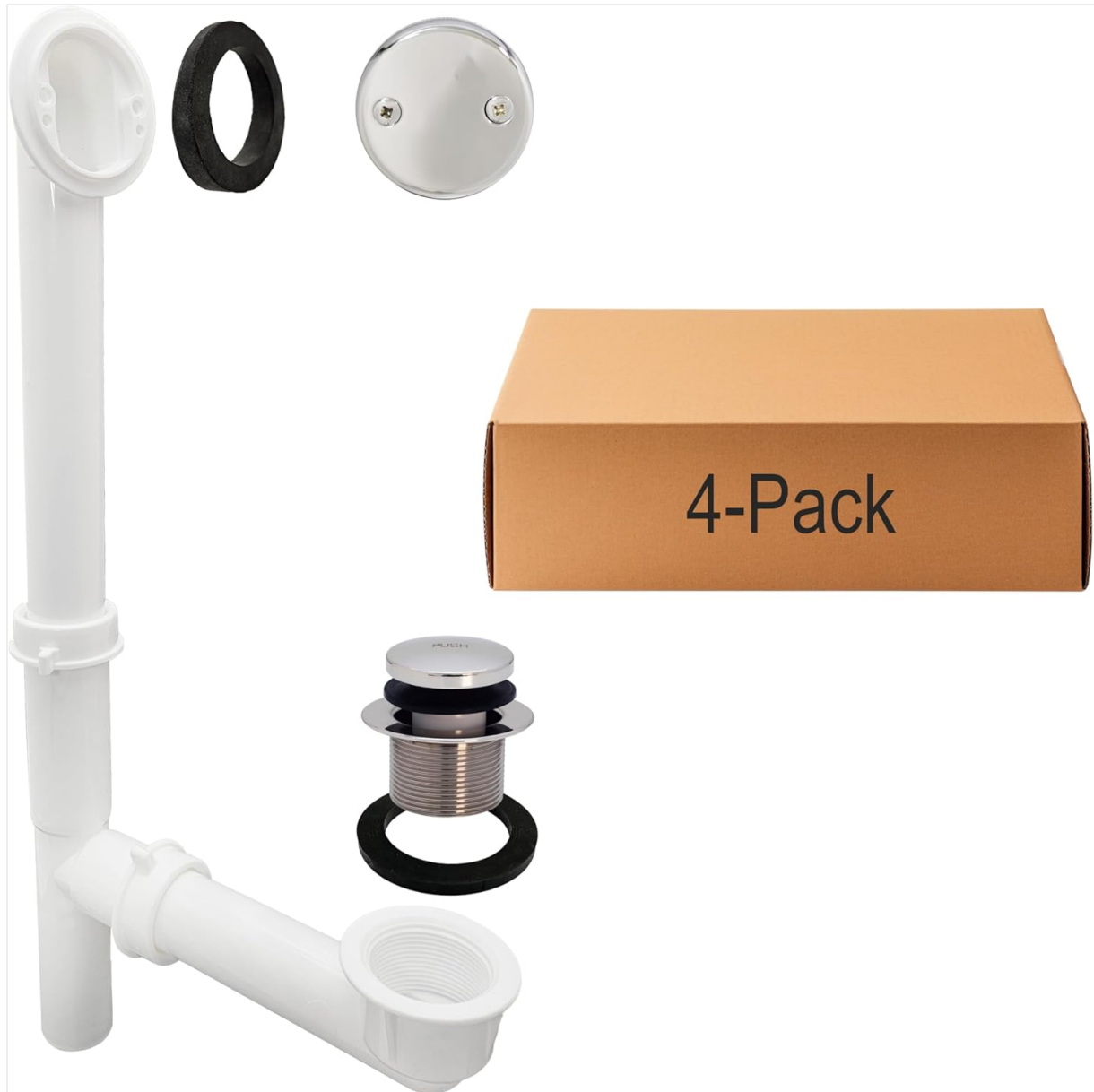
Image: All components included in the Westbrass 593244-4-26 bathtub waste and overflow assembly kit.