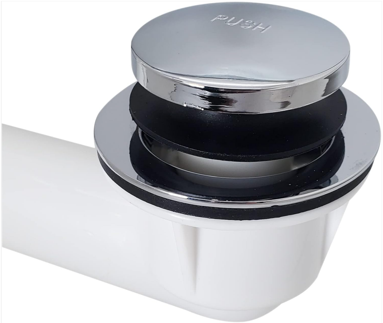
Image: A fully assembled view of the Westbrass bathtub waste and overflow system, showing the connected components.