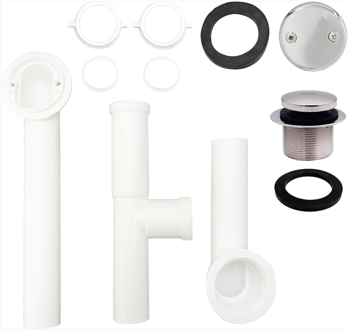
Image: Front view of the individual components for the Westbrass bathtub waste and overflow assembly.