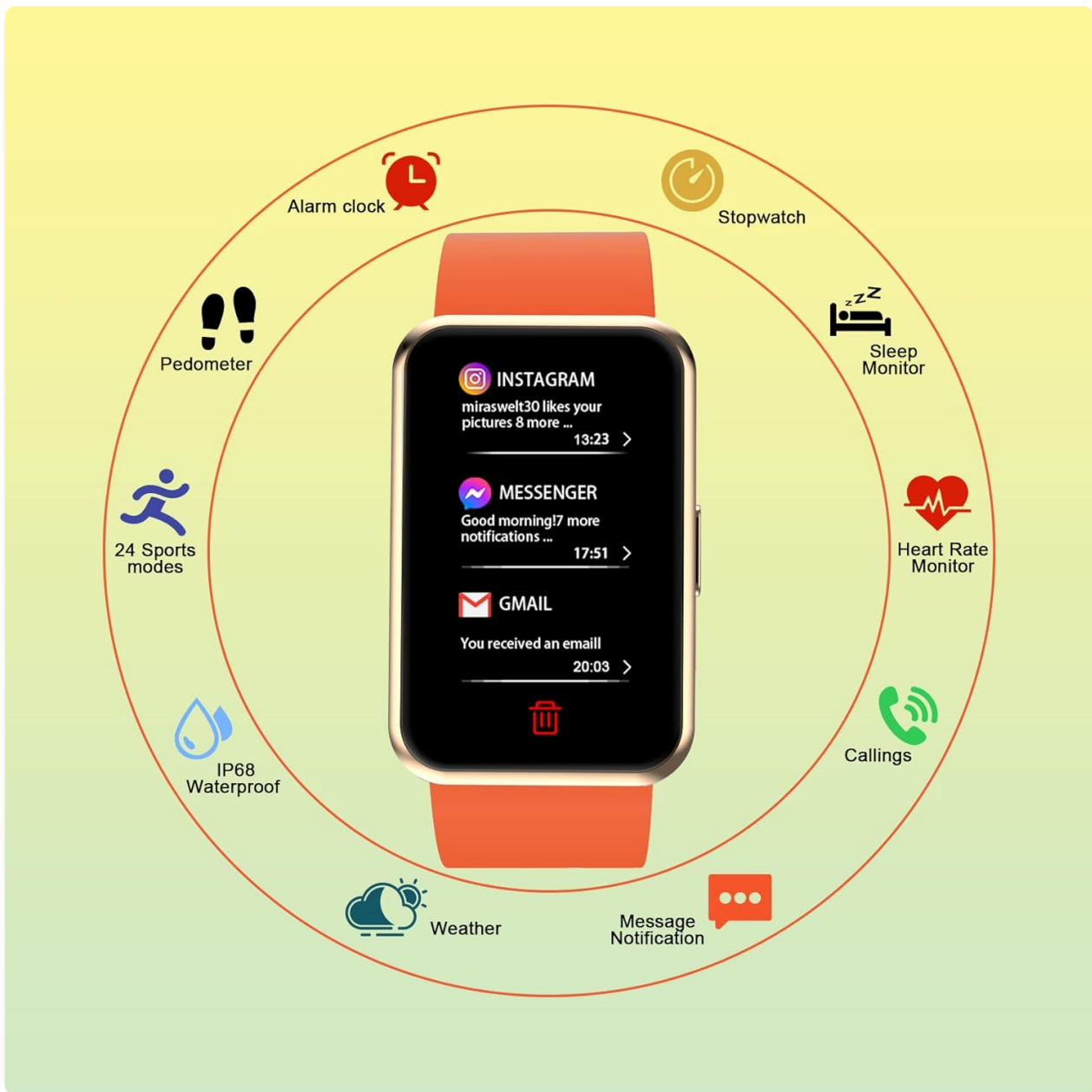
Image: Overview of IOWODO R5 Smart Watch features, including alarm, pedometer, sleep monitor, heart rate monitor, call notifications, weather, and message notifications.