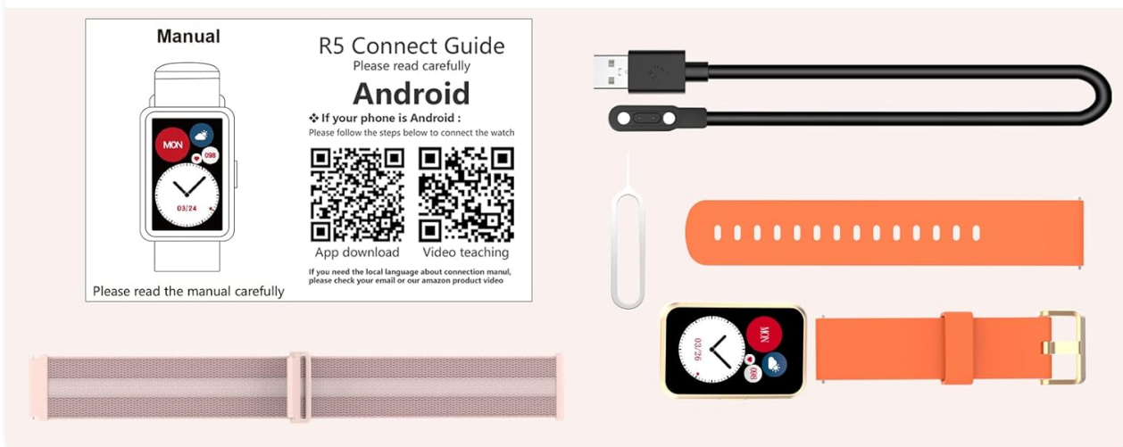
Image: Contents of the IOWODO R5 Smart Watch packaging, showing the watch, charging cable, and user manual.