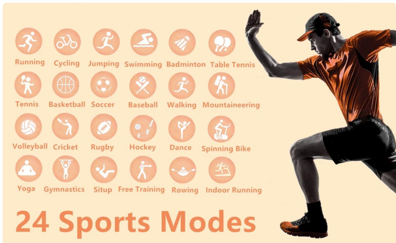
Image: Icons representing 24 different sports modes available on the IOWODO R5 Smart Watch, including running, cycling, swimming, and more.

The IOWODO R5 supports 24 sports modes. Select your desired activity from the watch's sports menu to track specific metrics like steps, distance, calories burned, and duration. Connect to your phone's GPS via the app for accurate outdoor activity tracking.