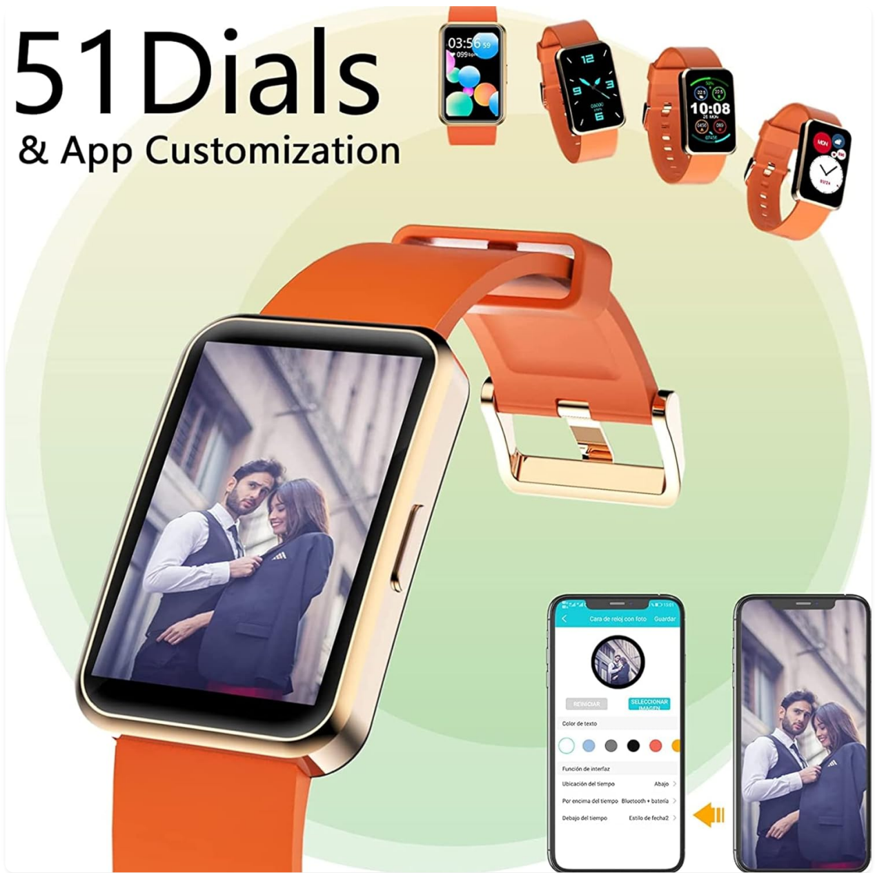
Image: IOWODO R5 Fitness Tracker Smart Watch, front view.