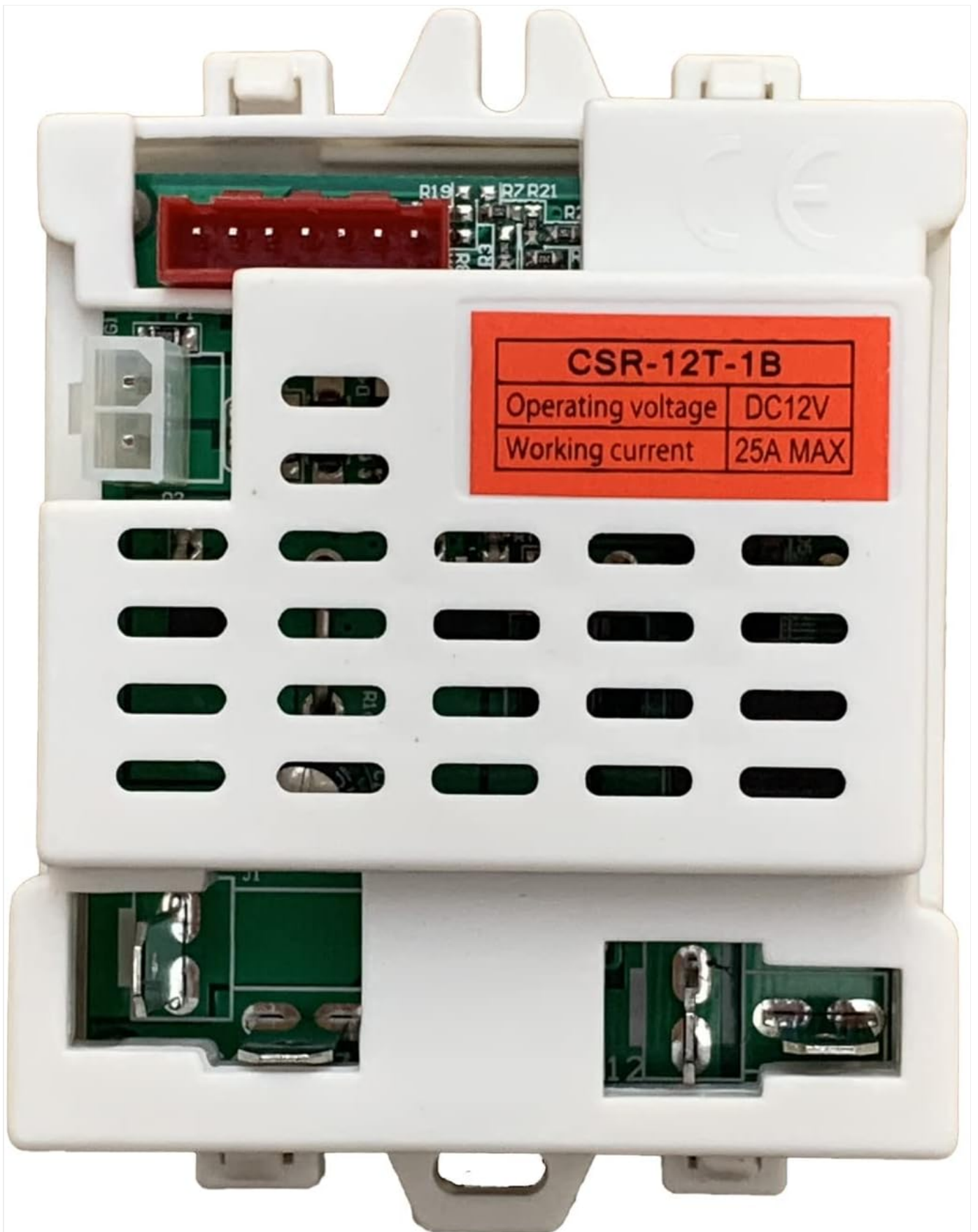
Image: Front view of the weelye CSR-12T-1B 12V control box. This image shows the main body of the control box with its model number and specifications clearly visible on a red label.