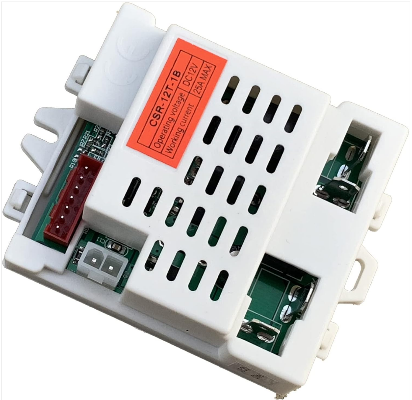
Image: Angled view of the weelye CSR-12T-1B 12V control box. This perspective highlights the various connection ports and the overall physical design of the control box.