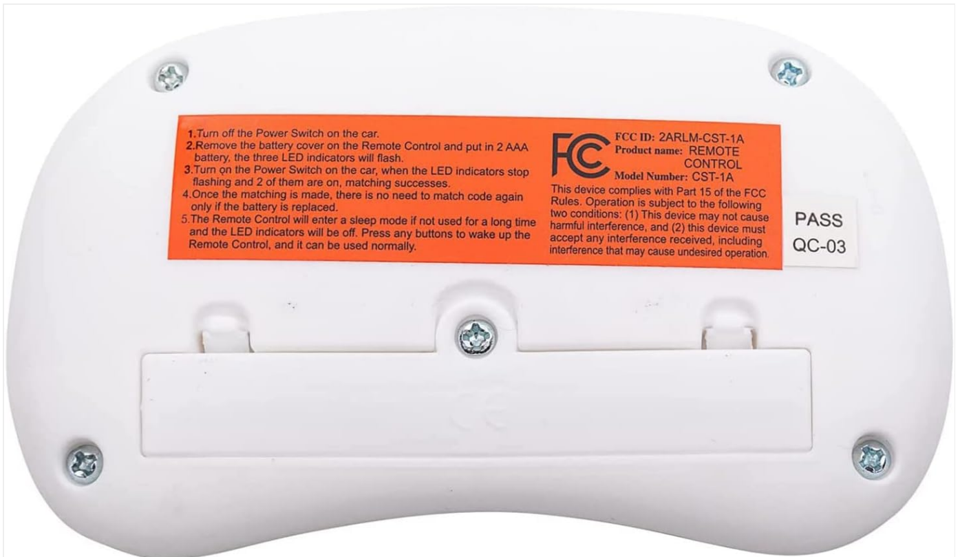
Image: Back view of the weelye 2.4G Bluetooth remote control. This view shows the battery compartment and regulatory information.