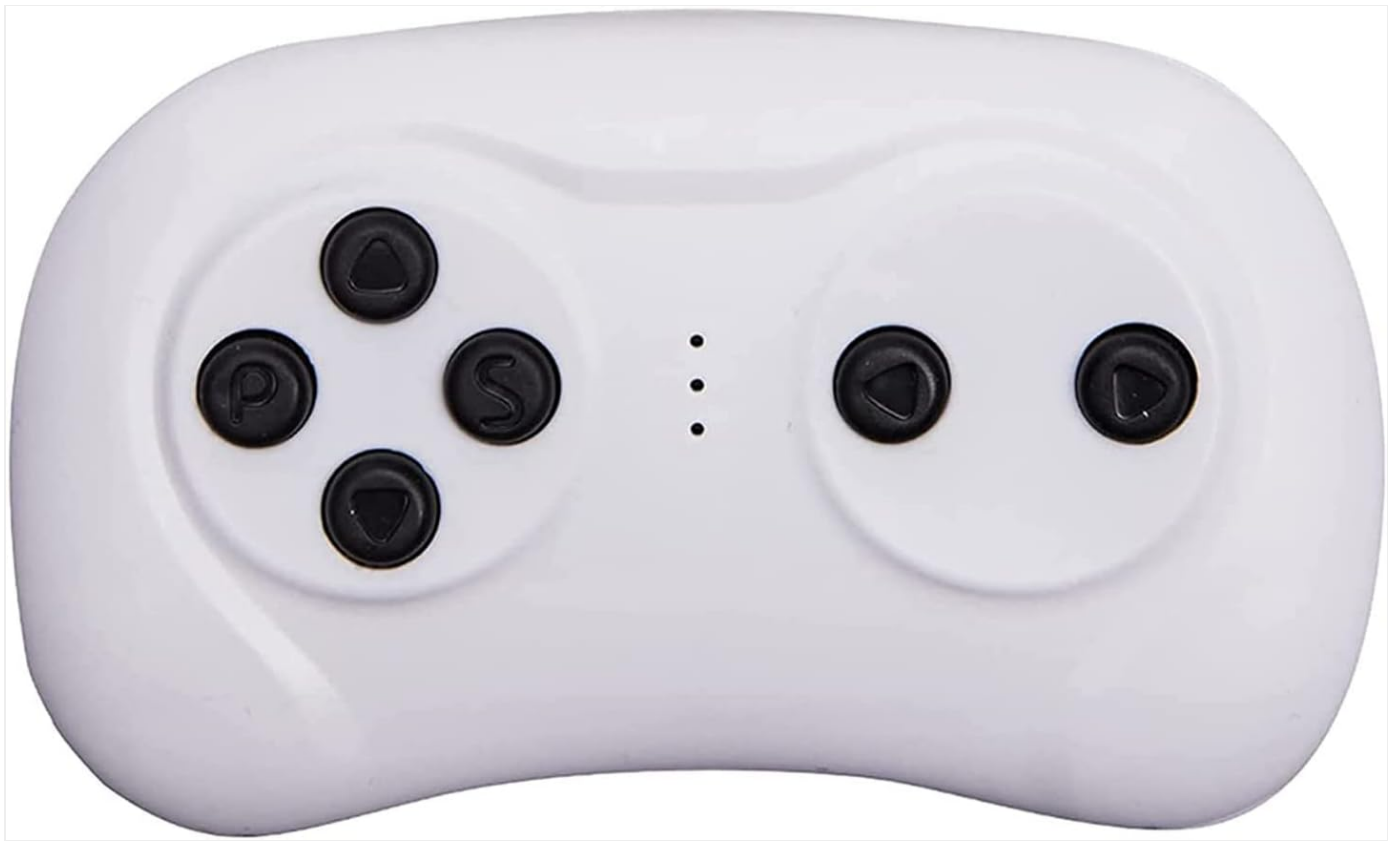
Image: Front view of the weelye 2.4G Bluetooth remote control. This image displays the buttons and ergonomic shape of the remote control unit.