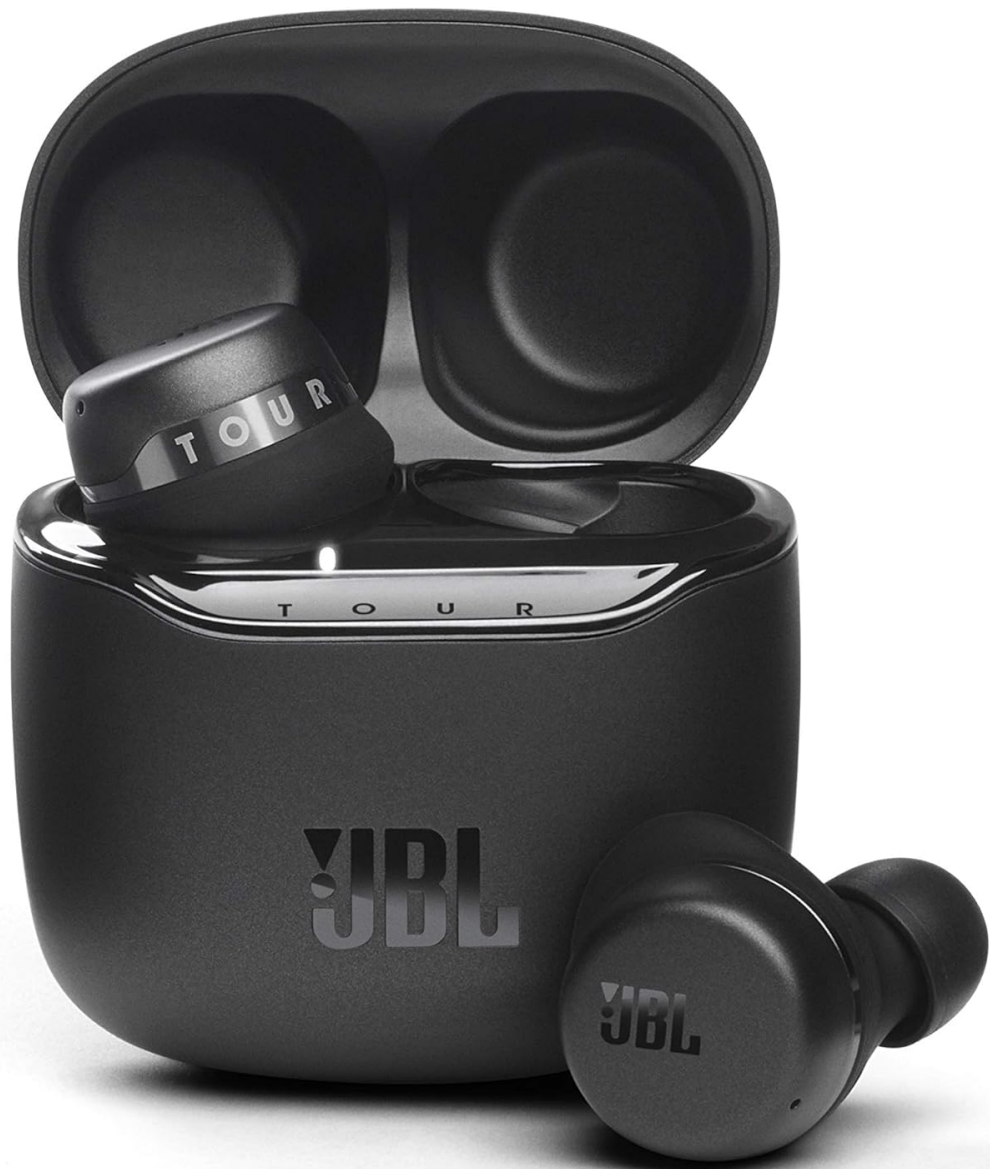
Image: JBL Tour PRO+ TWS Earbuds securely placed within their charging case.