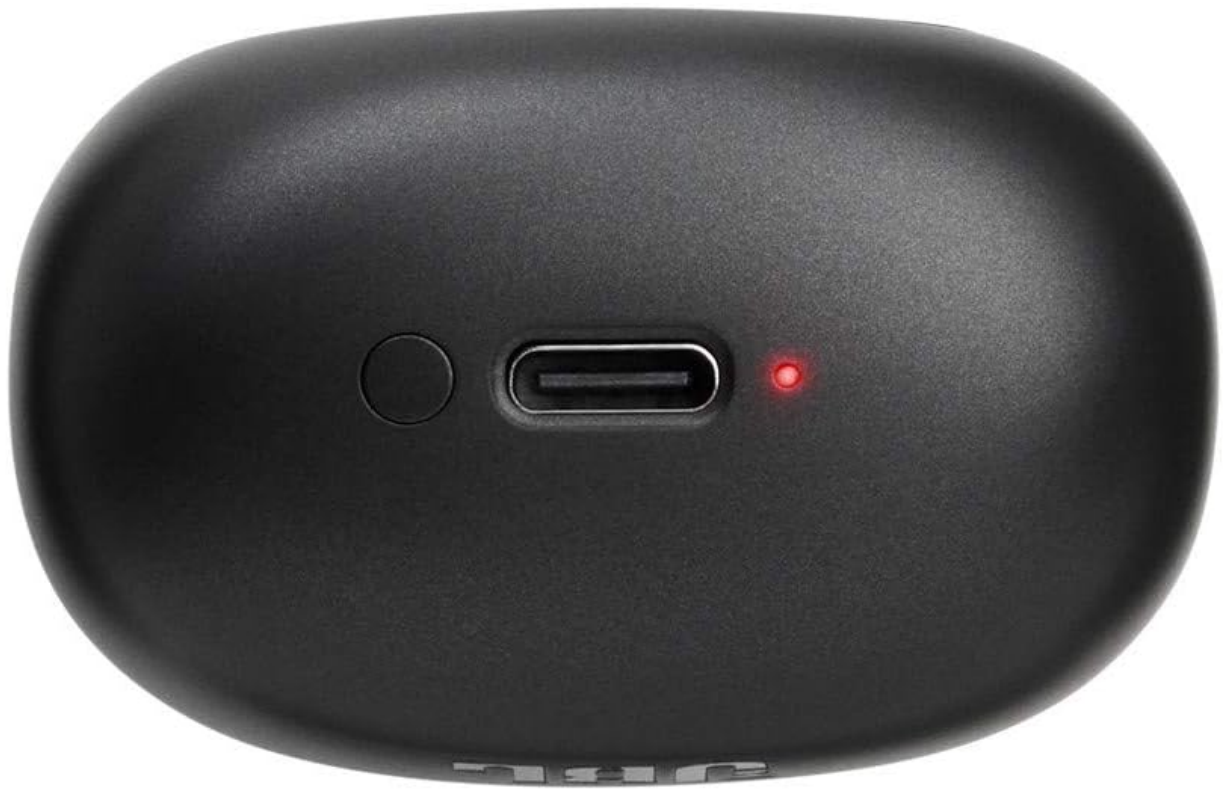
Image: The bottom of the charging case, highlighting the USB-C charging port and a small LED indicator.