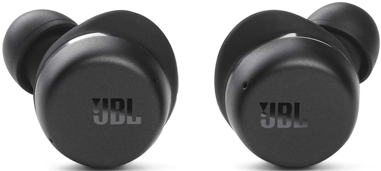
Image: The JBL Tour PRO+ TWS Earbuds shown from a top-down perspective, highlighting their sleek design.