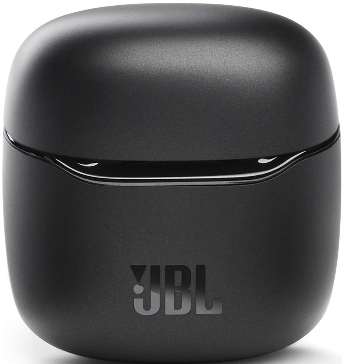
Image: The JBL Tour PRO+ TWS charging case in a closed position, displaying the JBL logo.