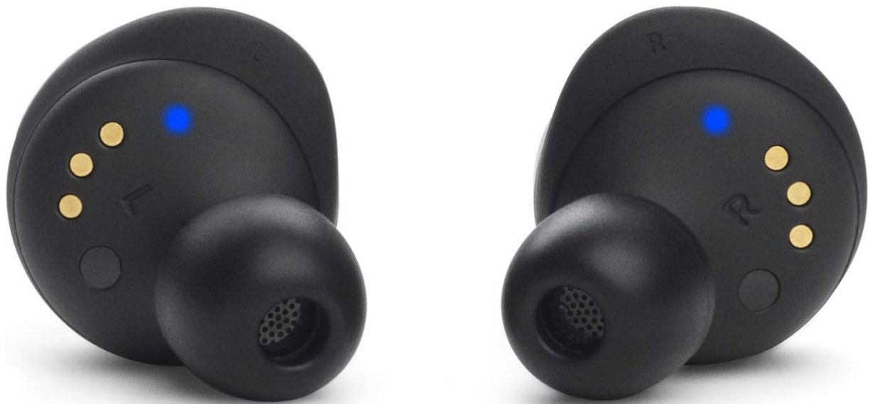
Image: The JBL Tour PRO+ TWS Earbuds shown from a bottom-up perspective, revealing charging contacts and sensors.