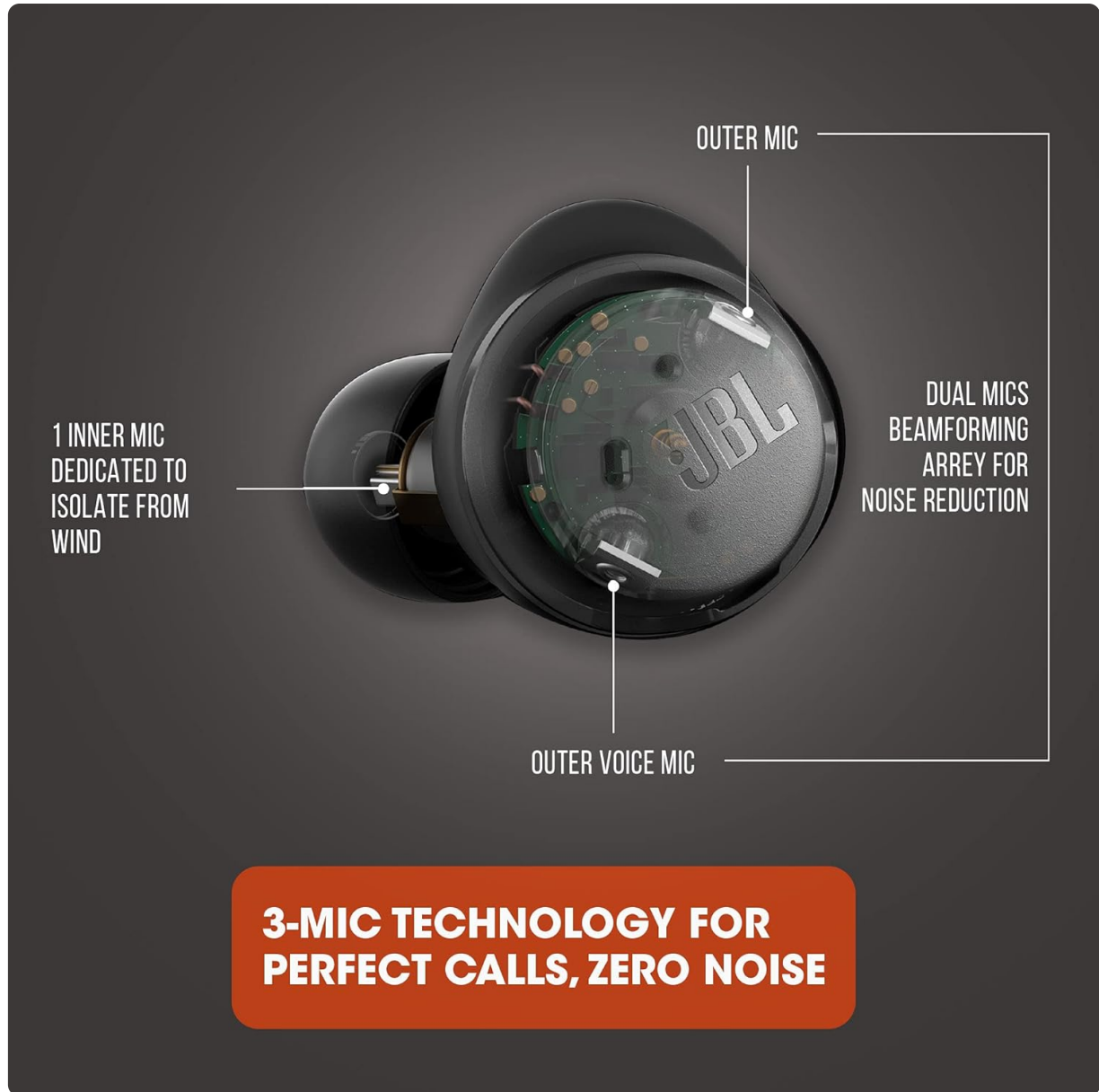
Image: A detailed diagram illustrating the three-microphone technology within the earbud, designed for perfect calls with zero noise by utilizing outer beamforming mics and an inner mic for wind isolation.

Activate your preferred voice assistant (Hey Google or Amazon Alexa) hands-free using your voice or through the touch controls.