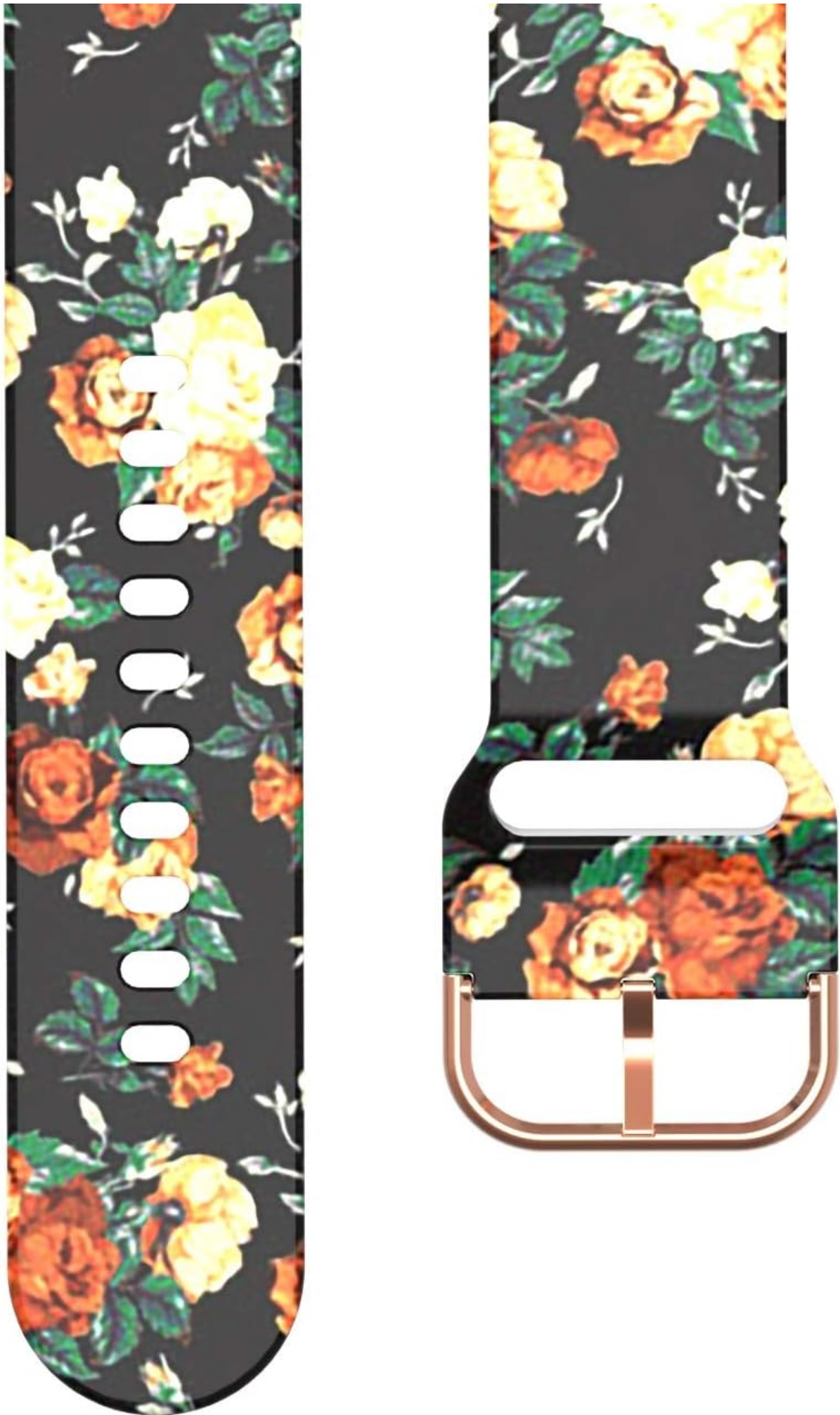
Image 3: A flat lay image displaying both segments of a NineHorse Smart Watch Band, showcasing its full floral pattern design and