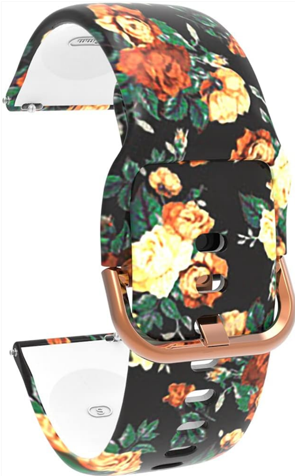
Image 1: A NineHorse Colorful Pattern Smart Watch Band featuring a floral design and a rose gold buckle. This image shows the band curved, highlighting its flexibility and the secure buckle mechanism.