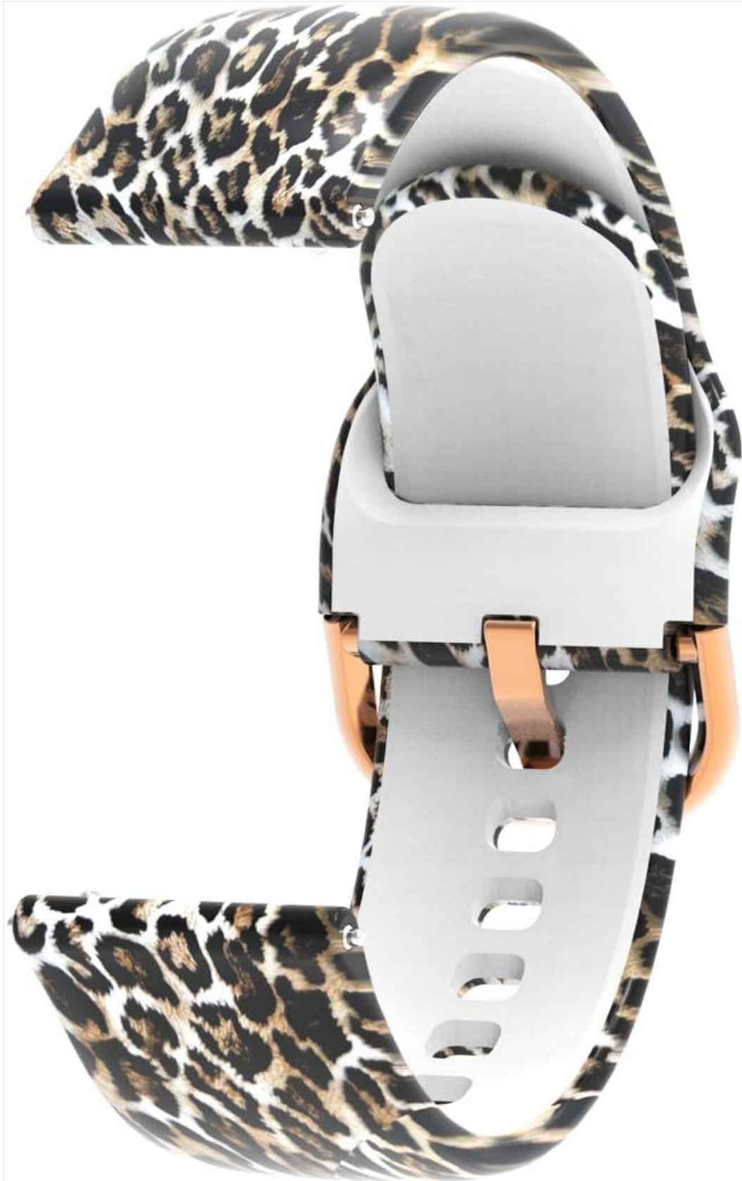
Image 2: An angled view of the underside of a NineHorse Smart Watch Band, clearly showing the quick-release pin mechanism. This pin facilitates easy installation and removal of the band from the watch.