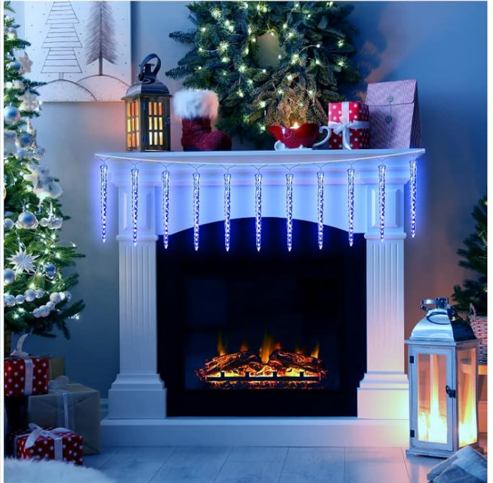
Image: Versatile application of the icicle lights on various surfaces.