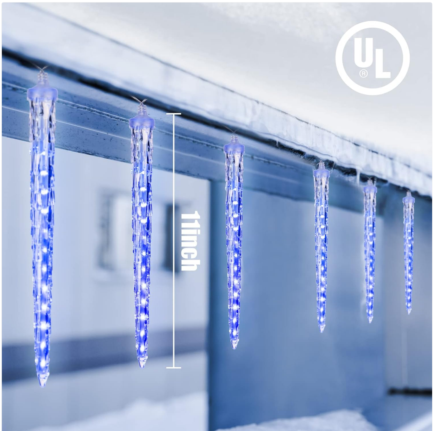
Image: Detail of an 11-inch icicle light tube, highlighting its size and UL certification.