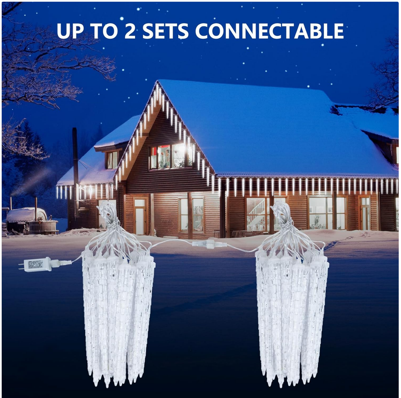
Image: Illustration of connecting multiple light sets.