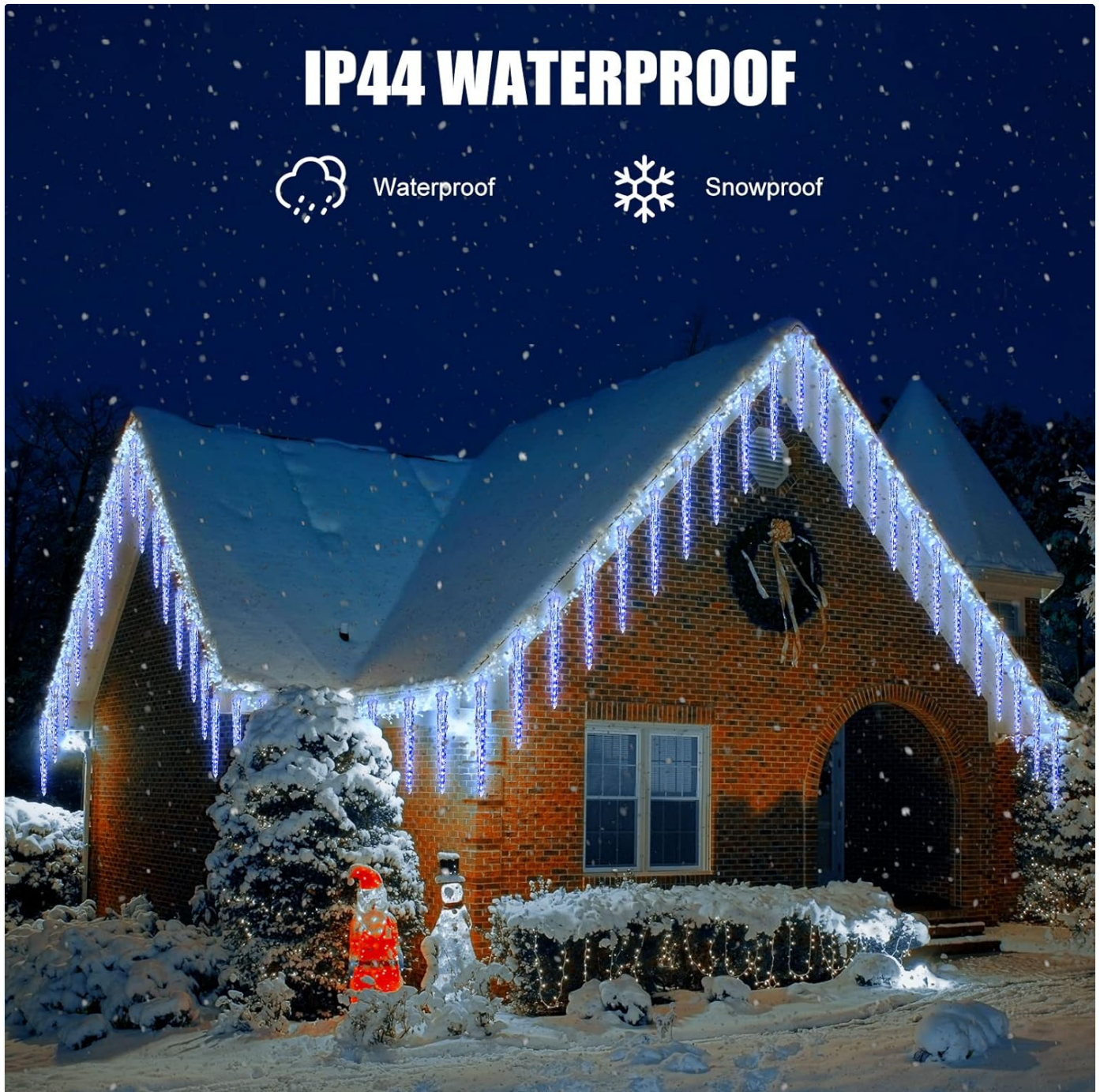
Image: Icicle lights demonstrating IP44 waterproof and snowproof capabilities.