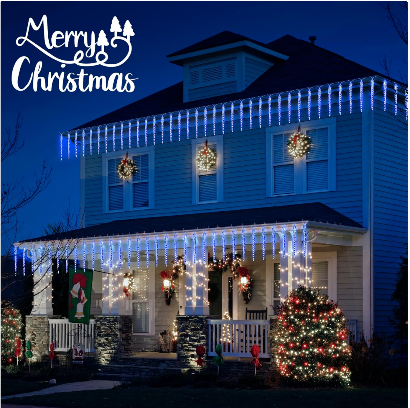
Image: Brightown Meteor Shower Icicle Lights illuminating a house exterior.