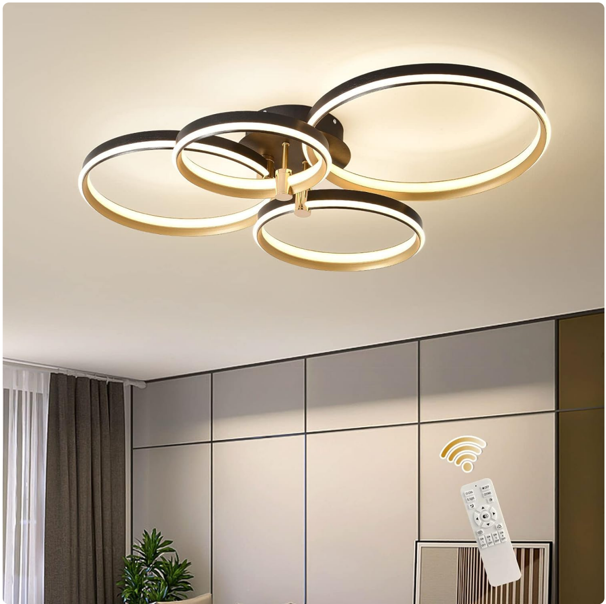
Figure 4.1: Ganeed Dimmable LED Ceiling Light with 4 rings and remote control.