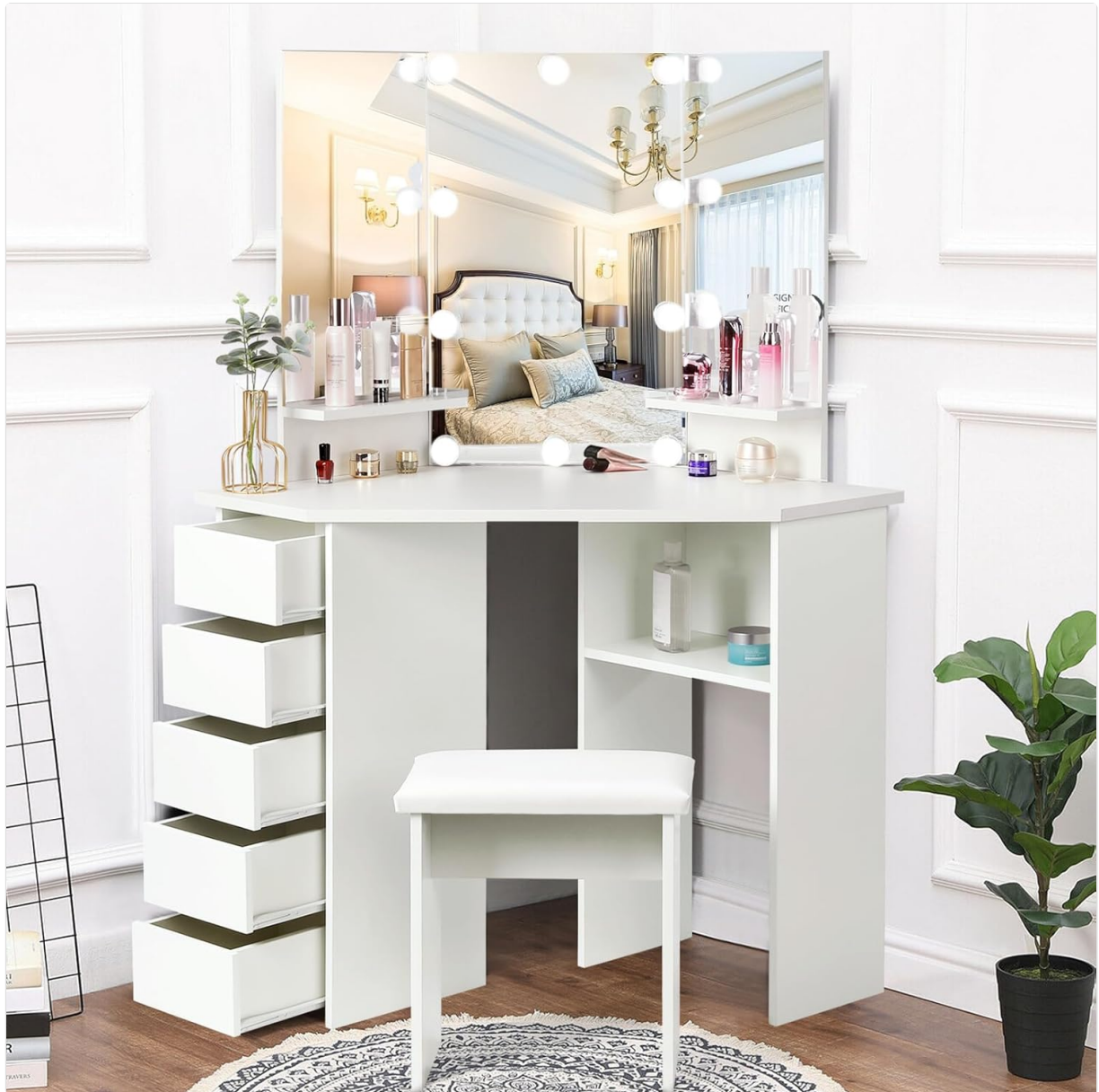
Image 2.1: The VOWNER Vanity Desk Model JY0415, showcasing its corner design, tri-folding mirror, and integrated storage.