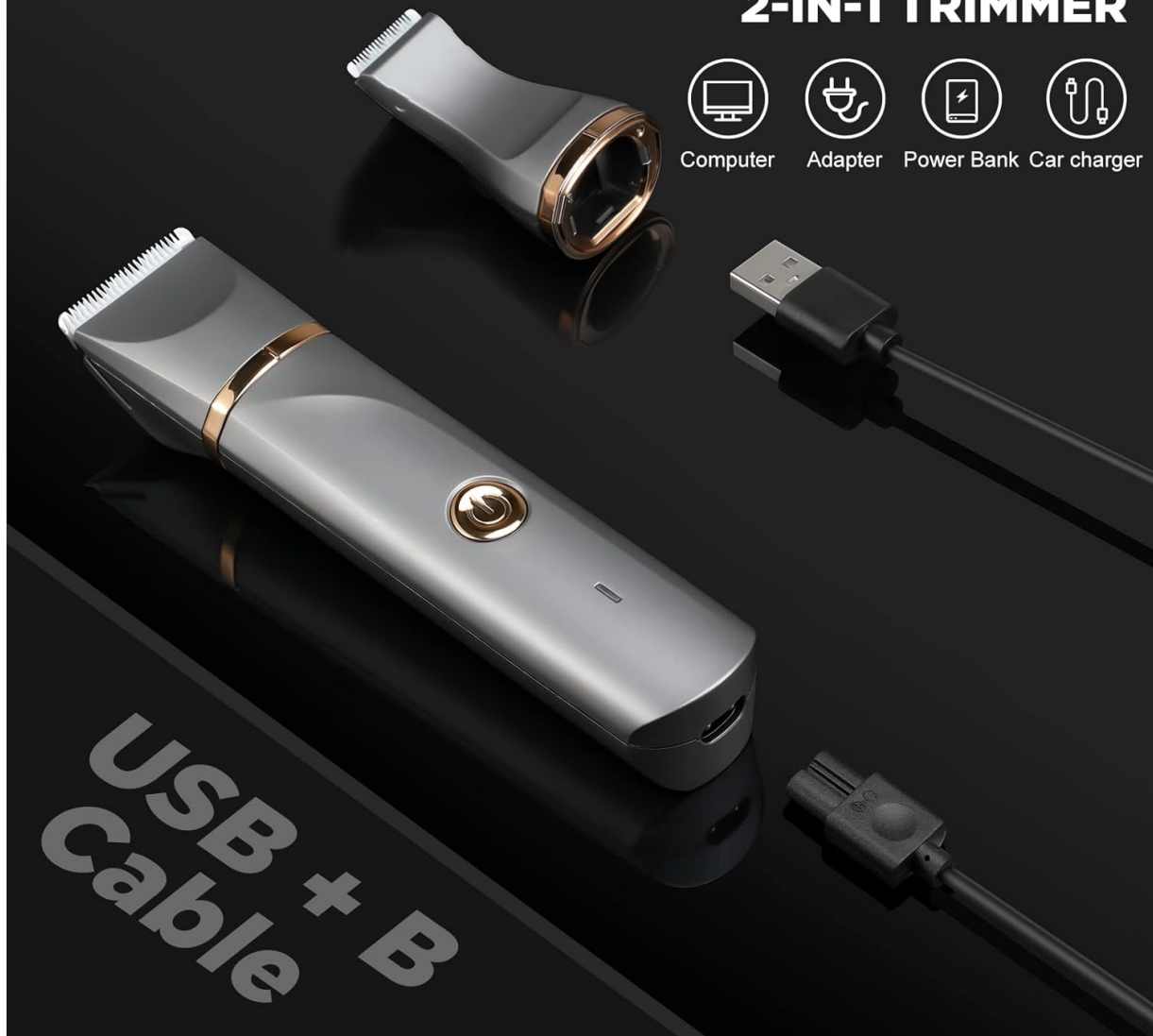
Image: The trimmer connected to its USB charging cable, illustrating different compatible charging methods such as computer, adapter, power bank, and car charger.