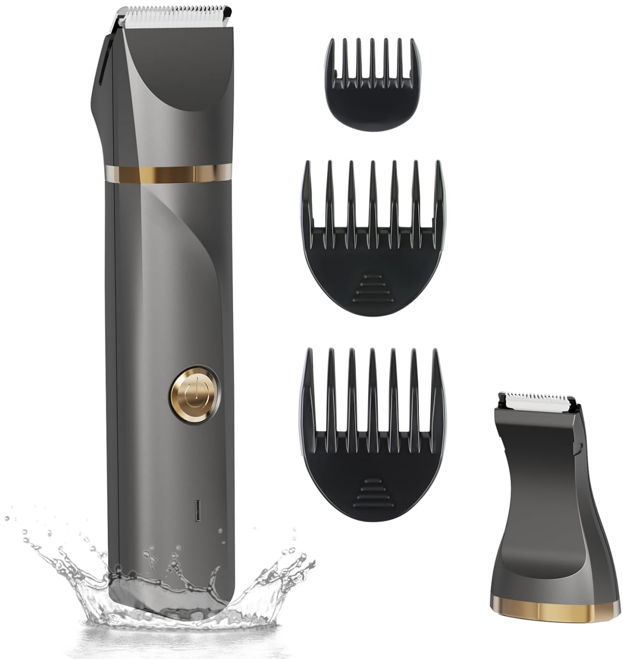
Image: The AREYZIN Body Hair Trimmer in gray and gold, demonstrating its waterproof feature with water splashes, alongside its various guide combs and a detail trimmer head.