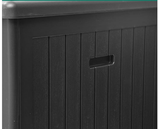
Image: A composite image showing a close-up of the deck box's water-resistant surface with water beads, the lockable latch (lock not included), and the convenient built-in side handles.