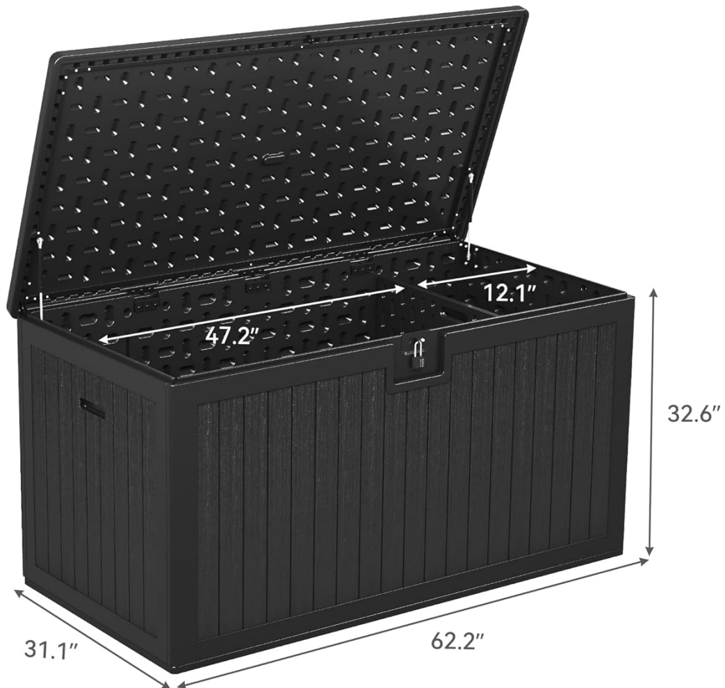
Image: A diagram illustrating the precise dimensions (length, width, height) of the YITAHOME XXL 230 Gallon Large Deck Box.