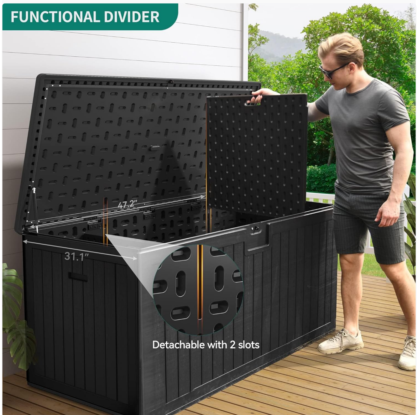
Image: A man demonstrating the flexible divider inside the deck box, highlighting its detachable nature and two slot positions for versatile storage organization.

The deck box includes a flexible divider with two accompanying slots. You can use the divider to create separate compartments for organized storage or remove it entirely to maximize the internal space for larger items.