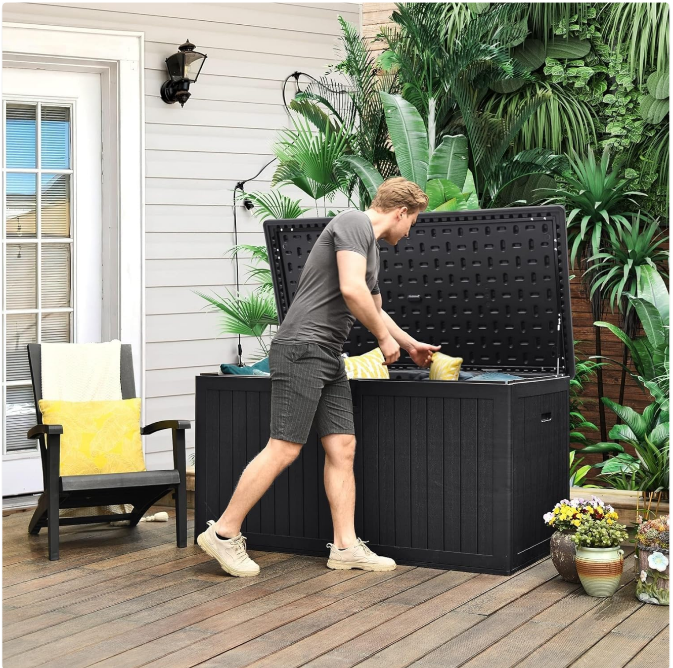
Image: A man placing patio cushions into the open YITAHOME deck box, demonstrating its large storage capacity for outdoor items.