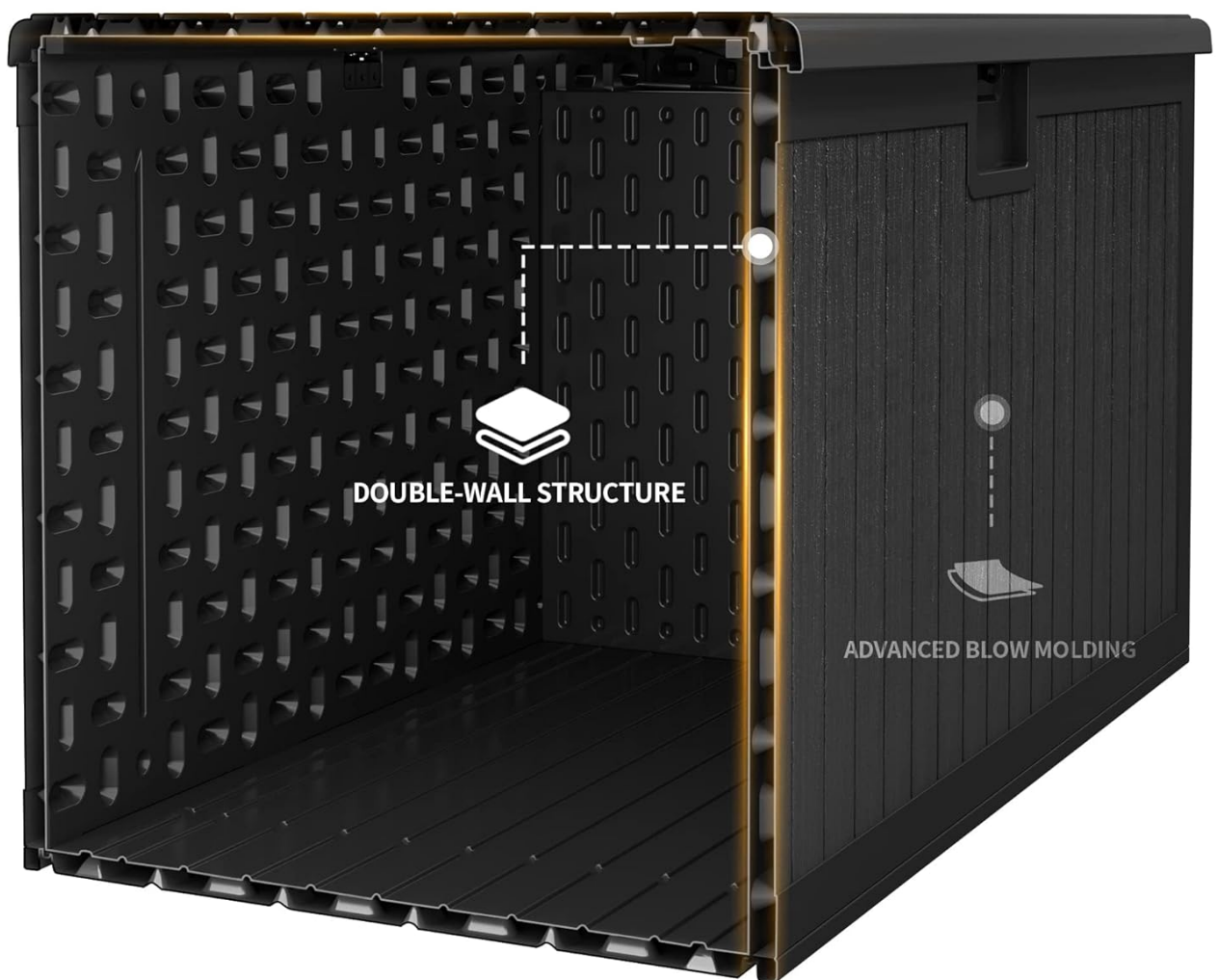
Image: A cutaway diagram illustrating the robust double-wall structure and advanced blow molding technique used in the construction of the deck box.