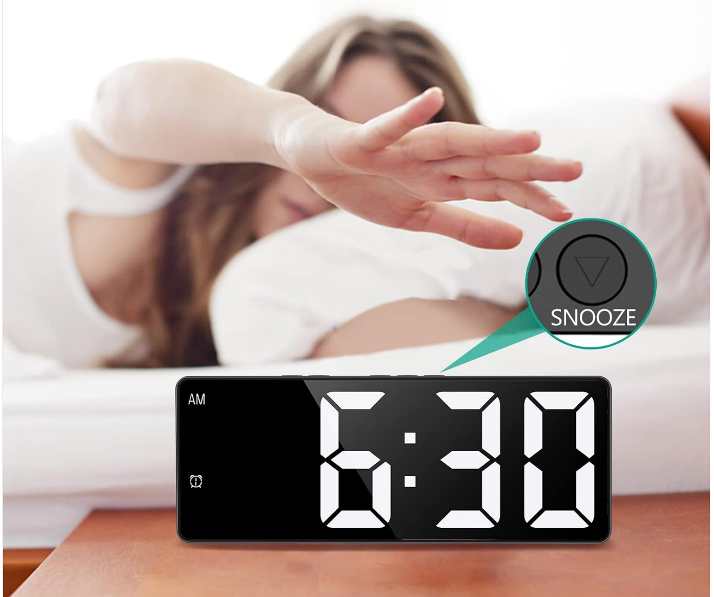
Image: Close-up of the snooze button and its function.