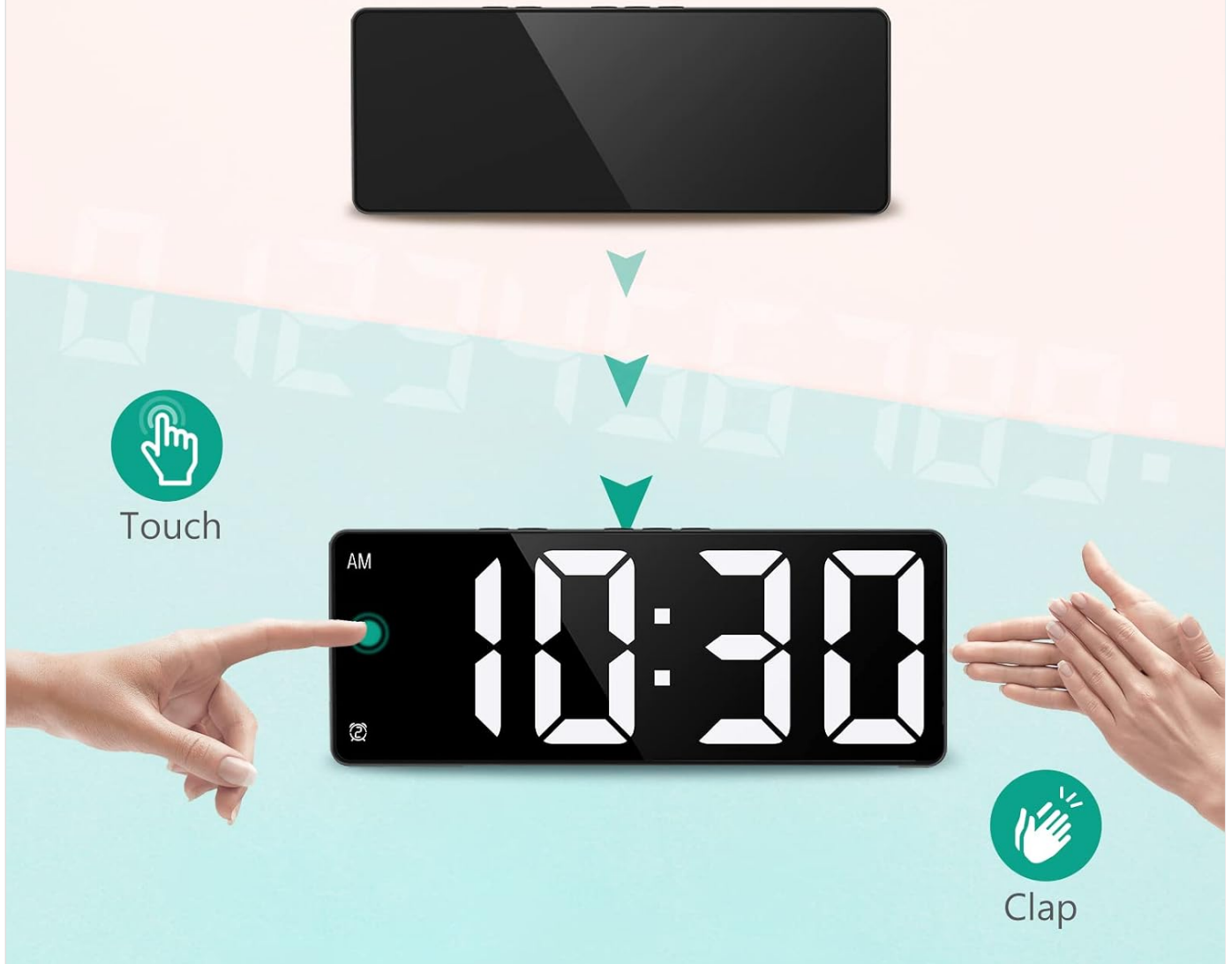
Image: Visual guide for activating the display using touch or sound control in battery-saving mode.

Wake up the clock by sound or touch when powered only by 3AAA batteries (not included)