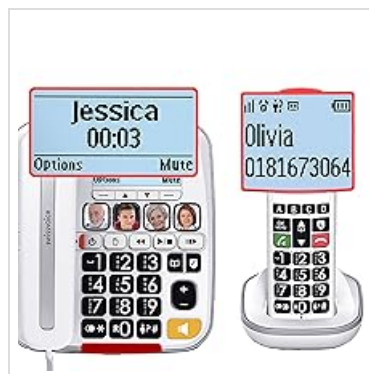
Figure 3.1: Handset with Large Keys and Talking Dial