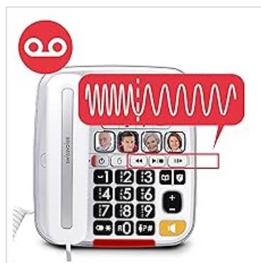
Figure 3.2: Answering Machine Controls