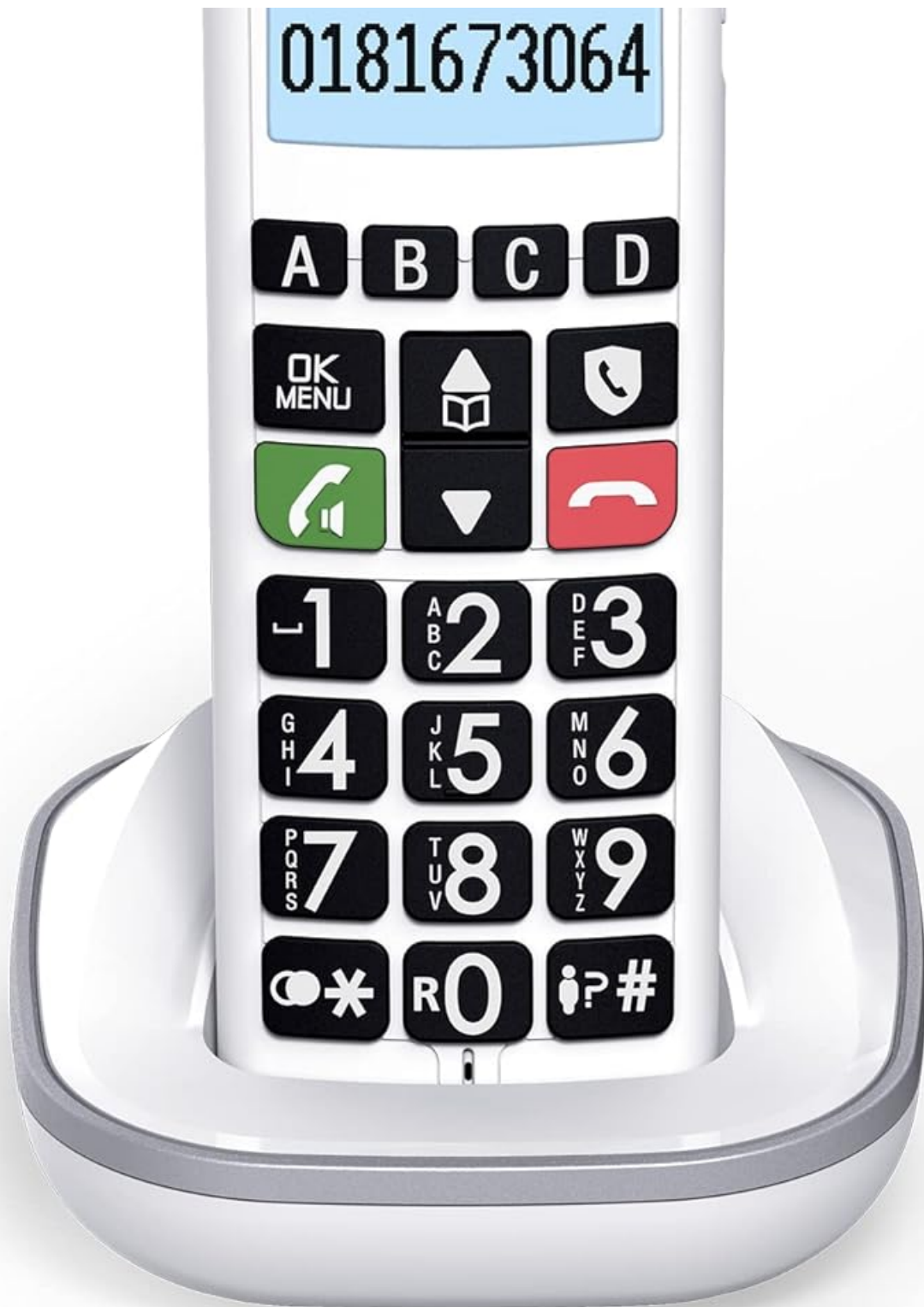
Figure 2.1: Cordless Handset and Charging Cradle