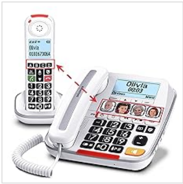
Figure 3.3: Photo Direct Memory Keys

important contacts for quick and easy dialing.