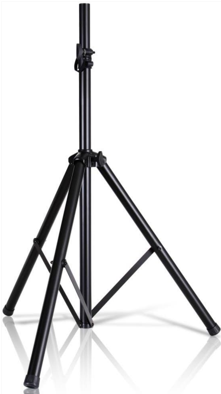
Image: The Pyle Universal Speaker Stand in its upright position.