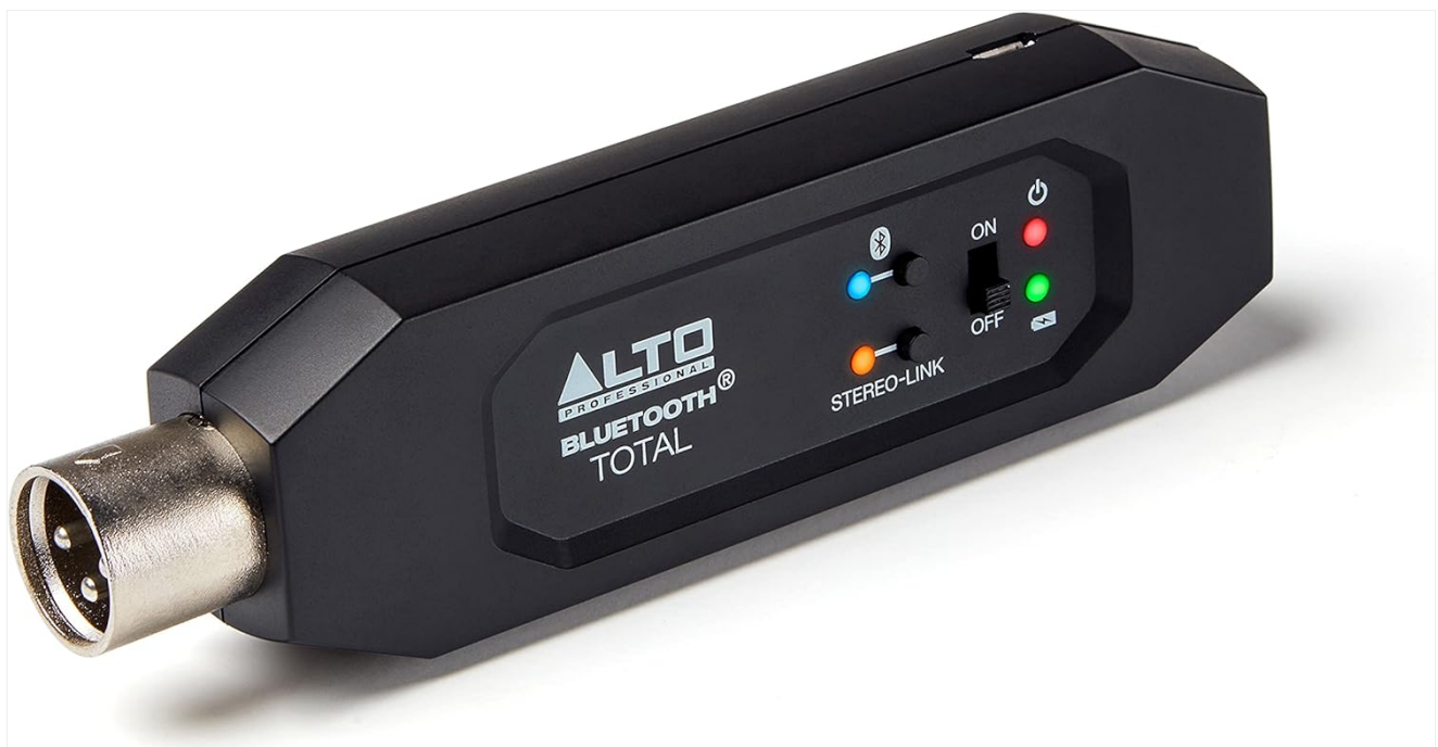
Image: Close-up view of the Alto Professional Bluetooth Total 2 Receiver, highlighting its power switch, Bluetooth pairing button, Stereo-Link button, and LED indicators.