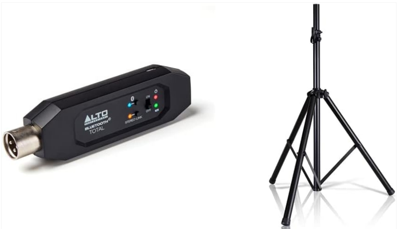
Image: The Alto Professional Bluetooth Total 2 Receiver and Pyle Universal Speaker Stand.

This manual provides detailed instructions for the Alto Professional Bluetooth Total 2 XLR-equipped rechargeable Bluetooth receiver and the Pyle Universal Speaker Stand (Model PSTND2). These products are designed to enhance your audio setup, offering wireless audio streaming capabilities and stable speaker support for various applications.