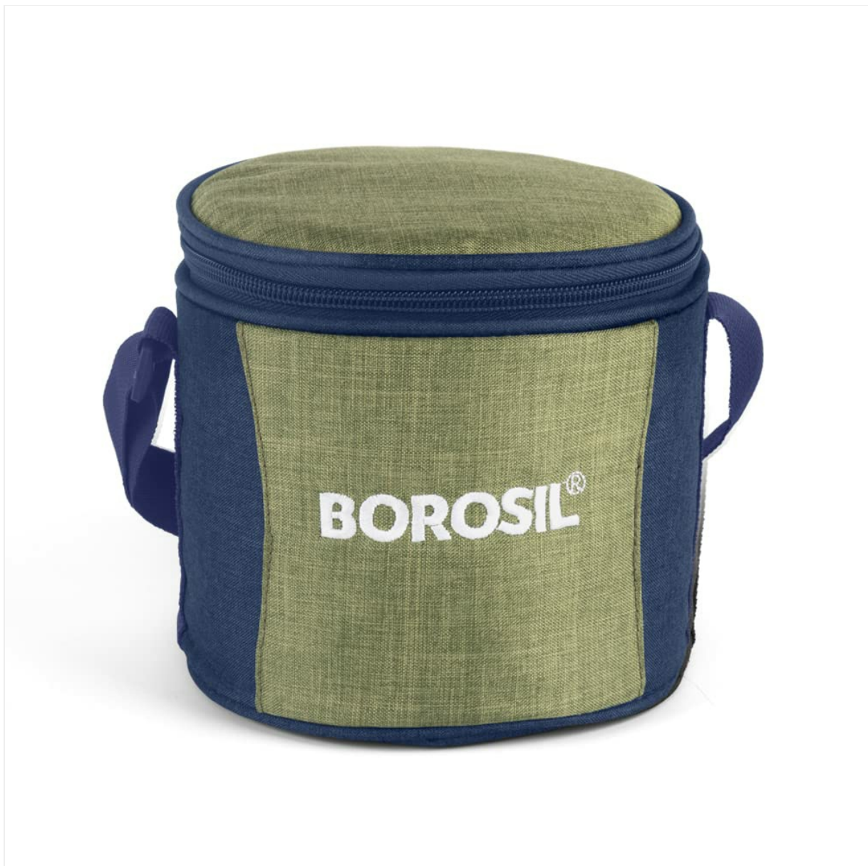
Image: The insulated lunch bag included with the set.