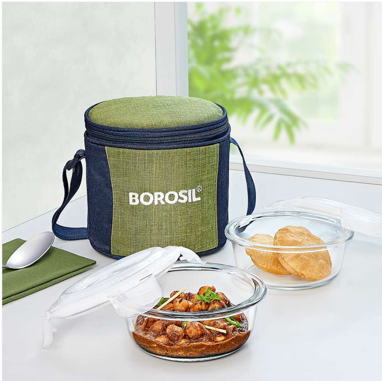
Image: Borosil Ace Lunchbox with Bag, featuring two round glass containers.