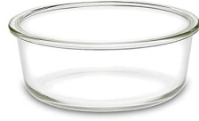
Image: Components of the Borosil Ace lunchbox, highlighting easy cleaning.

Does not absorb stains. The high quality glass is also stronger than normal glass and extreme temperature resistant, up to 400°C and -40°C.