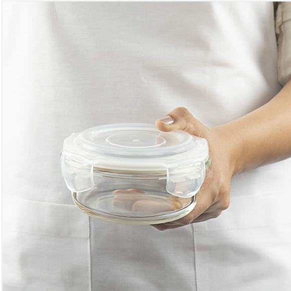
Image: Securely sealed container for transport.