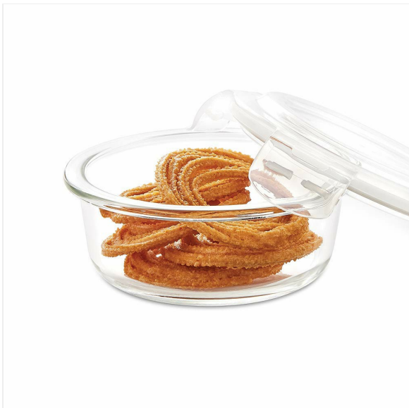
Image: Glass container with food.