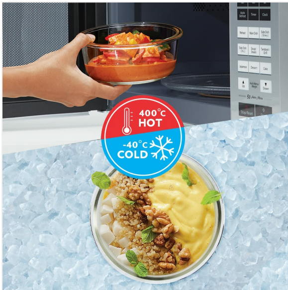
Image: Borosilicate glass containers are safe for microwave and freezer use.