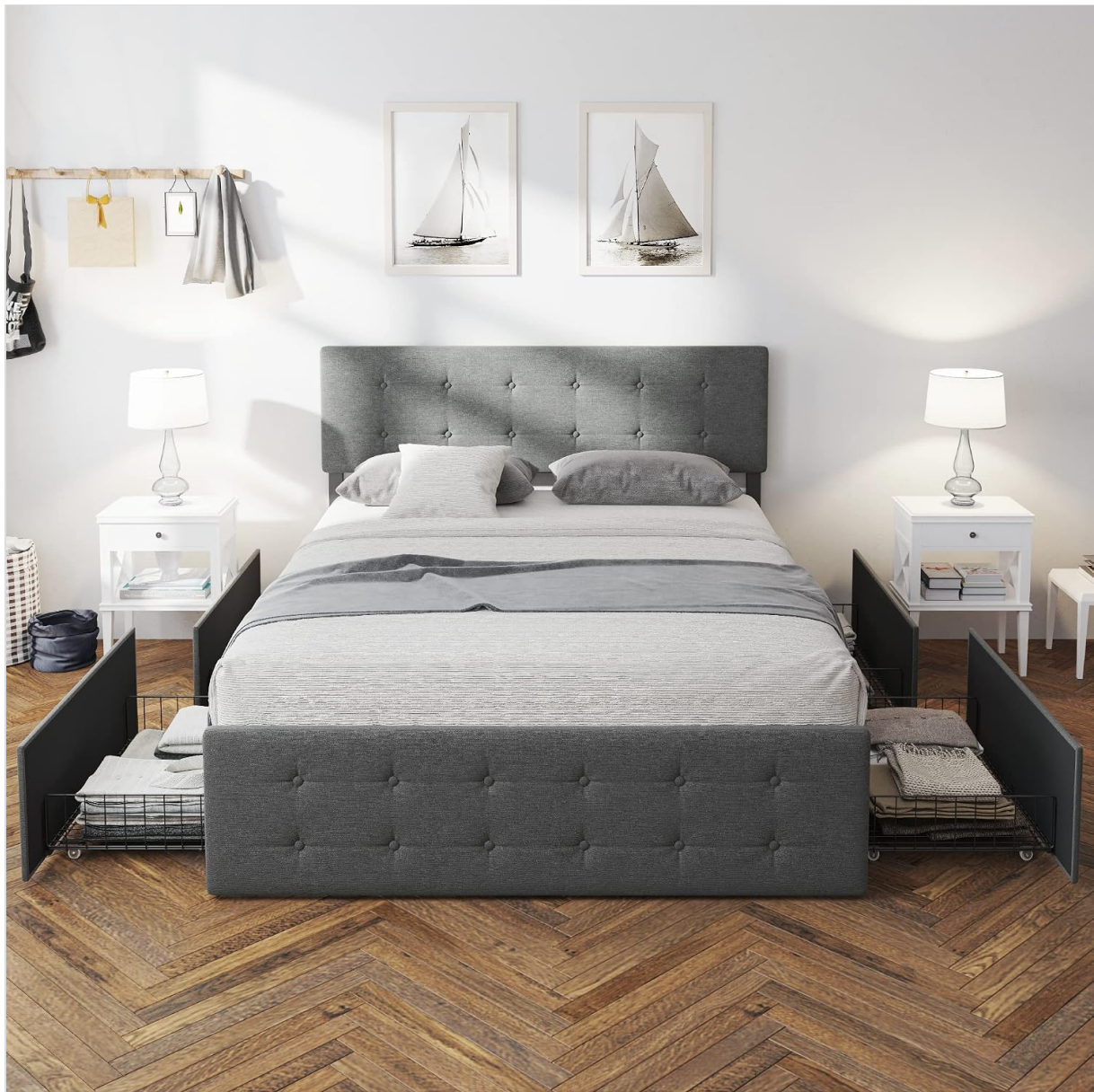
Figure 5.1: Utilizing the four storage drawers.