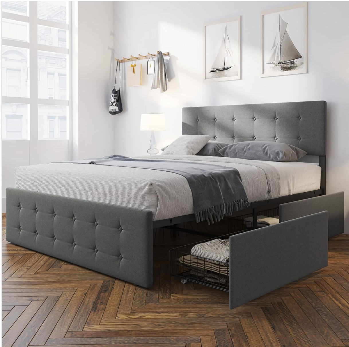
Figure 4.1: Fully assembled bed frame with drawers.