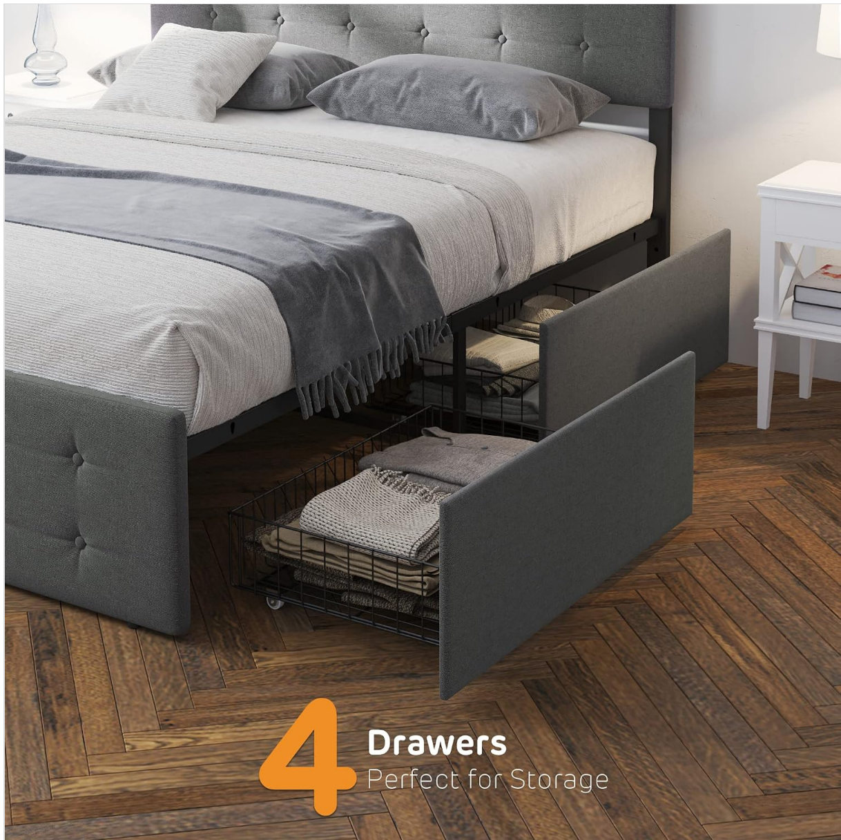
Figure 4.3: Detail of a storage drawer with wheels.