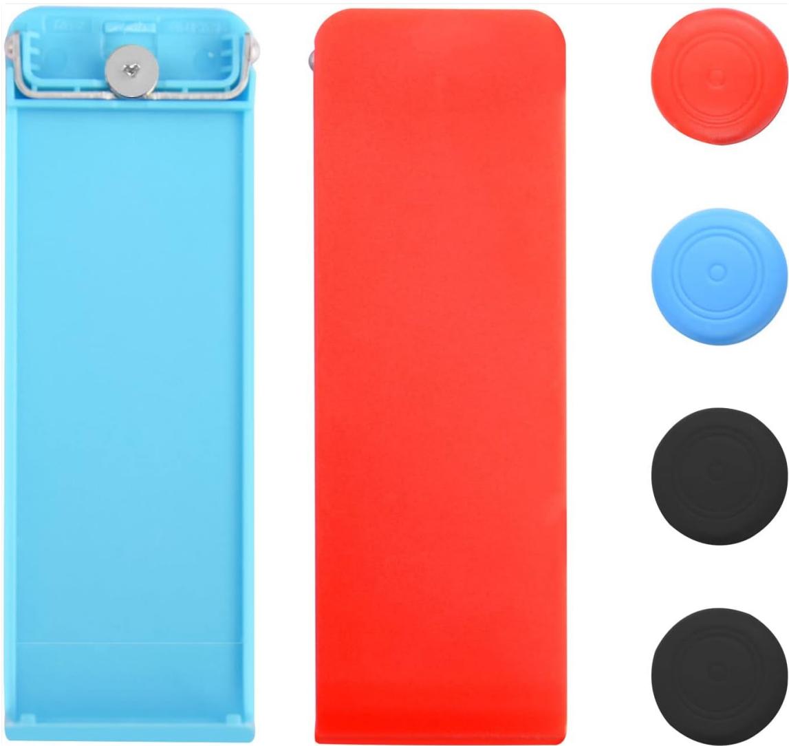
An overview of the LONANDY Switch Kickstand Replacement kit, displaying two kickstands in blue and red, along with four silicone thumb grips in various colors.