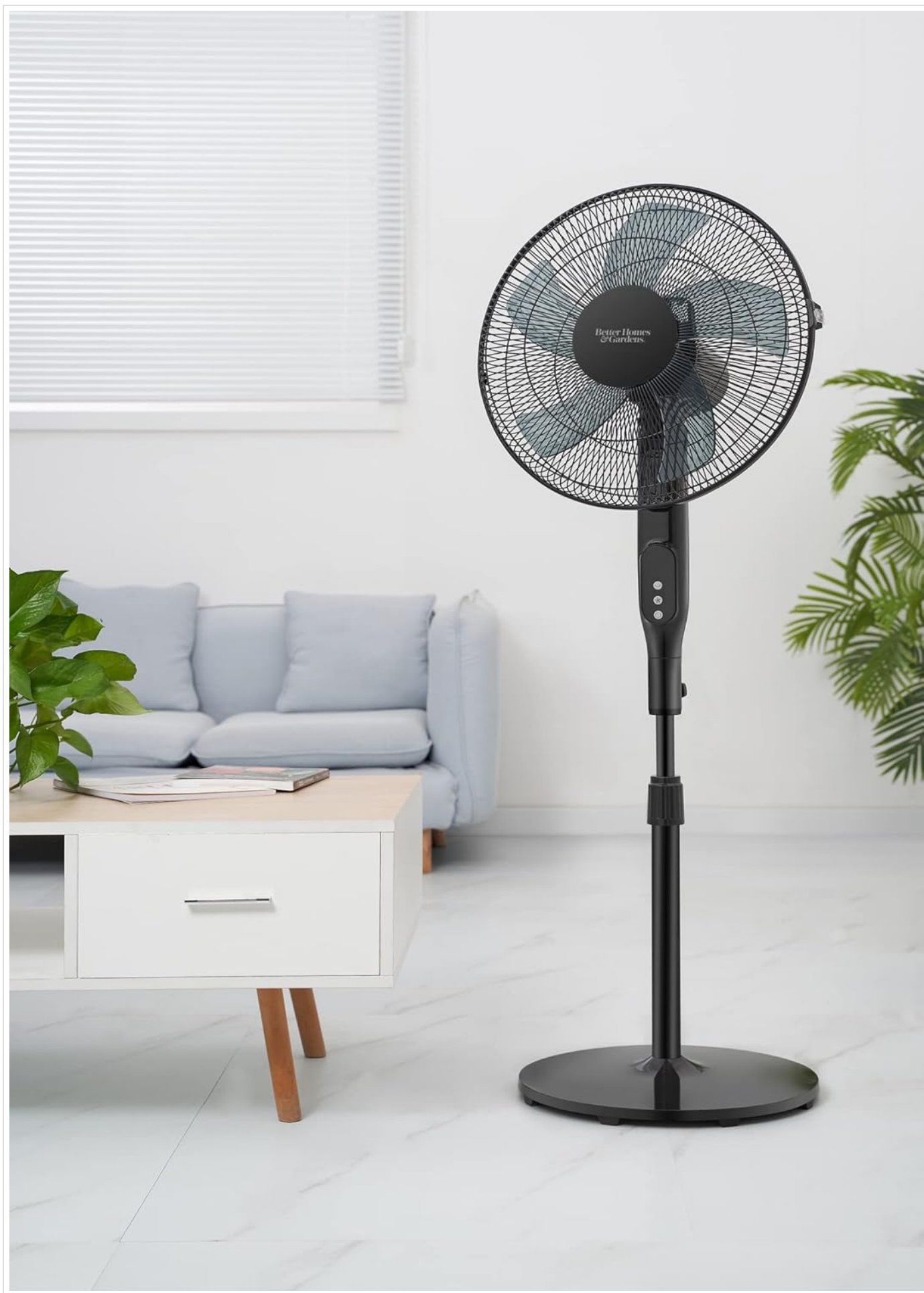
Image: The Better Homes & Gardens 16" Pedestal Fan positioned in a modern living room, demonstrating its aesthetic integration into a home environment.