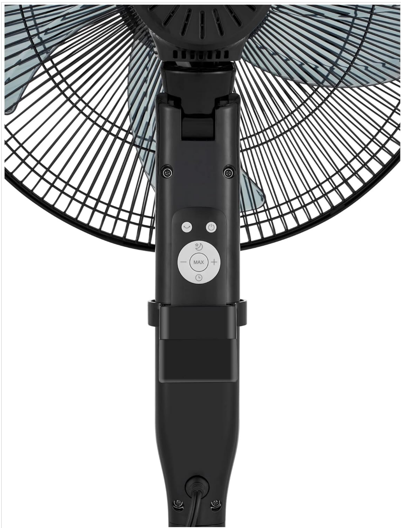
Image: A close-up of the multi-functional remote control, showing its buttons and how it conveniently stores in a dedicated slot on the fan stand.

The remote control allows you to operate all fan functions from a distance. Ensure the remote is pointed towards the fan's control panel for optimal response.