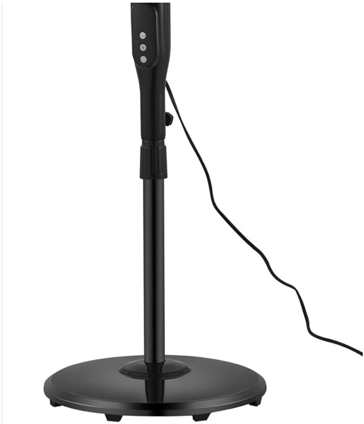
Image: A side view of the assembled fan, illustrating the power cord connection and the overall profile.