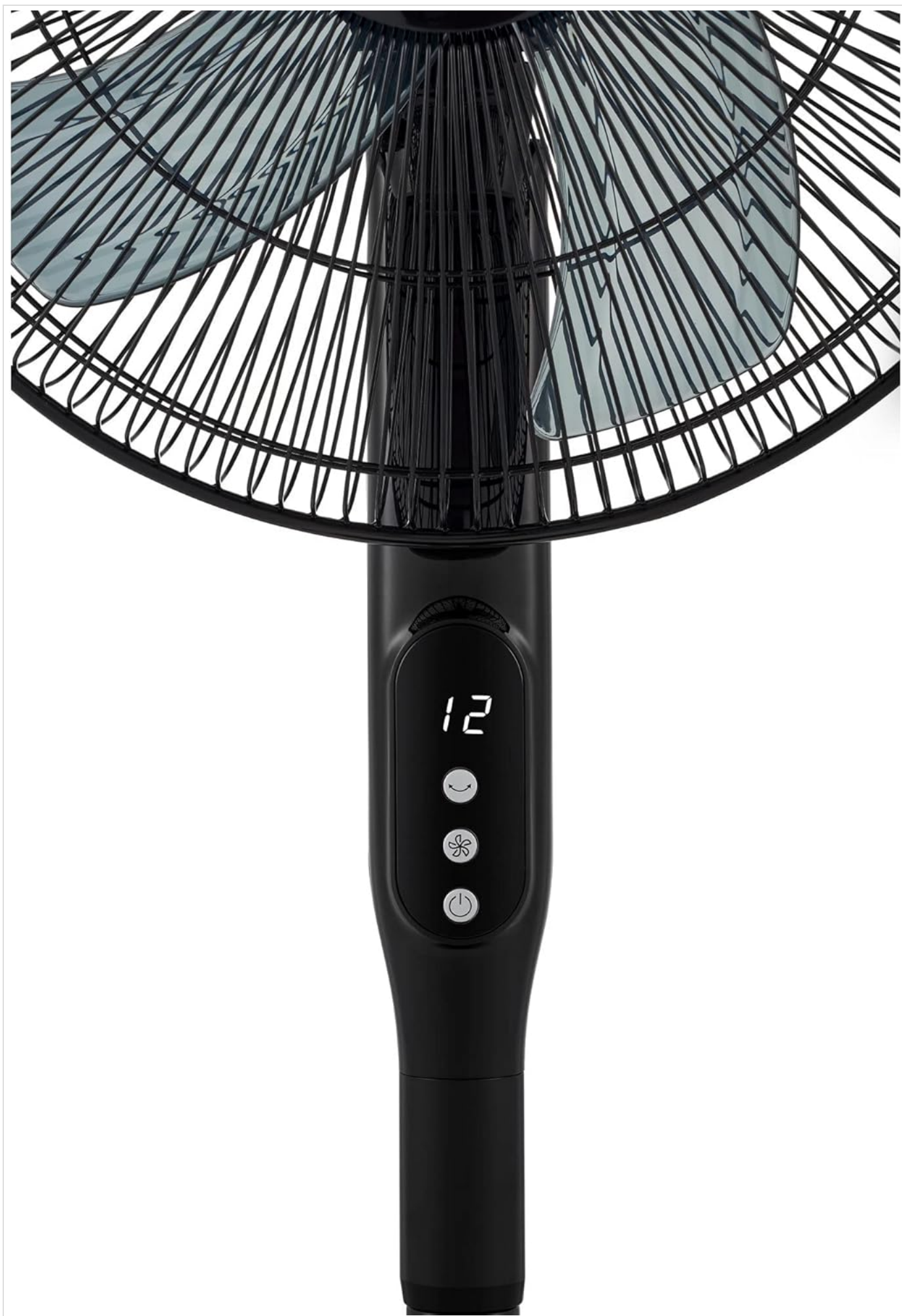
Image: A close-up view of the fan's control panel, showing the digital display and touch-sensitive buttons for various functions.