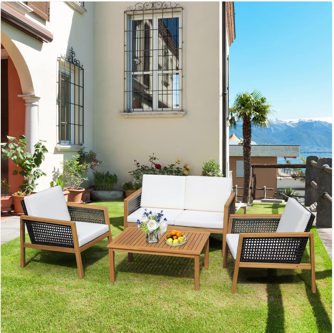
Figure 4.1: The furniture set arranged on a lawn, demonstrating its aesthetic appeal in a garden setting.