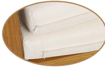
Zipper Design for Easy Cleaning