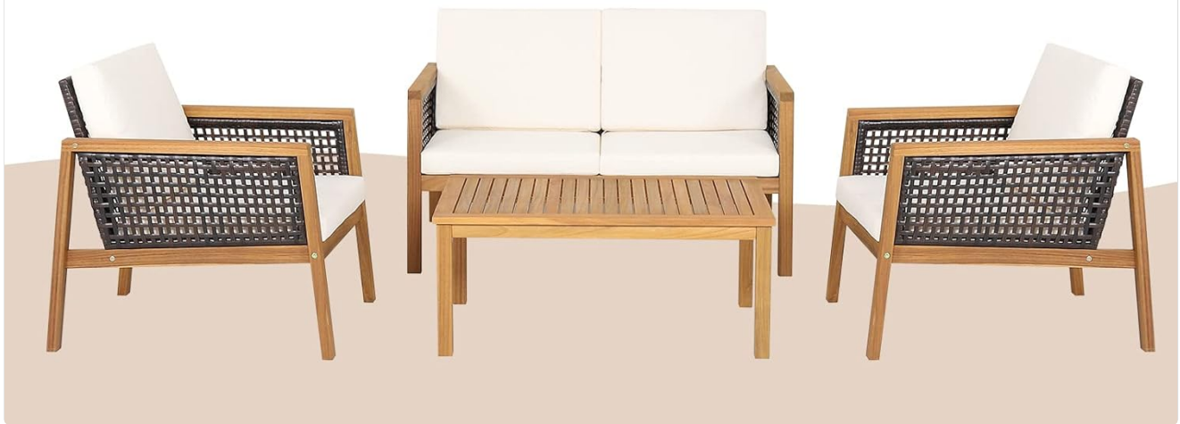
Figure 3.3: Example configurations for patio, garden, poolside, and backyard.