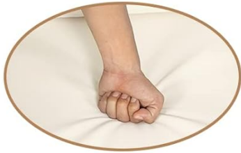
Soft Padded Cushion