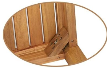
Reinforced Triangular Structure