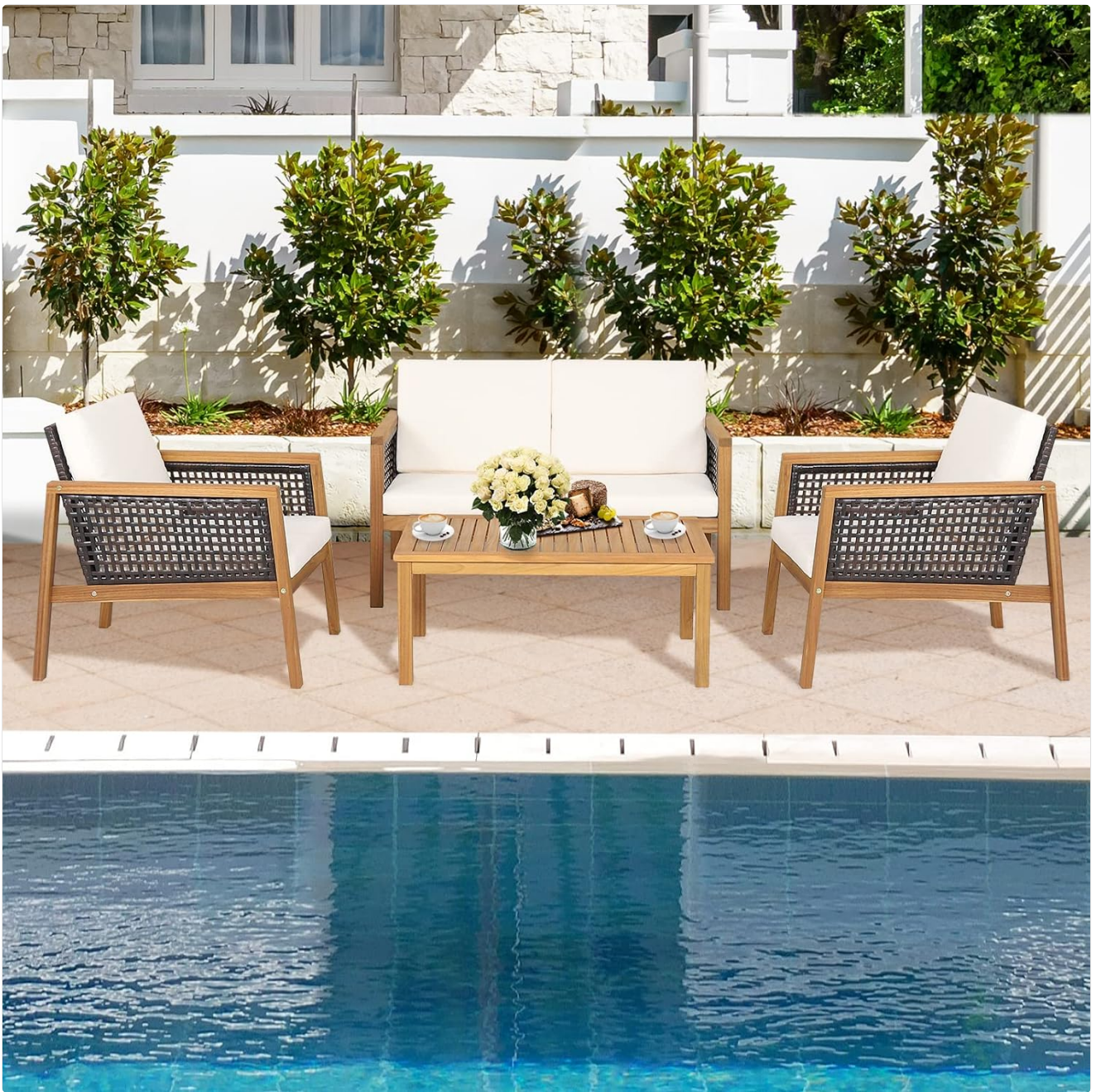
Figure 4.2: The furniture set positioned by a poolside, highlighting its suitability for various outdoor environments.