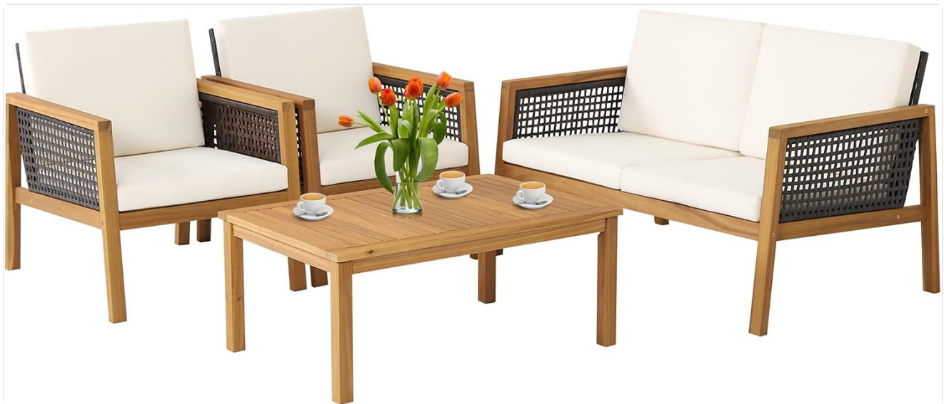
Figure 3.1: Fully assembled PATIOJOY Outdoor Furniture Set.