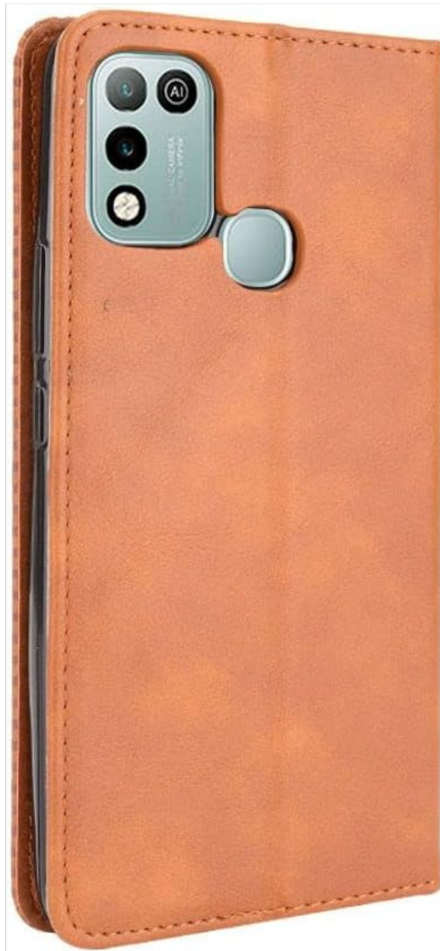
Figure 4: Back view of the case, highlighting the camera cutout.