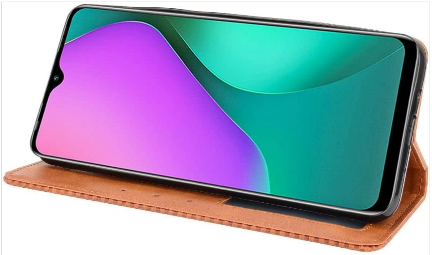
Figure 2: Case folded into a stand for landscape viewing.