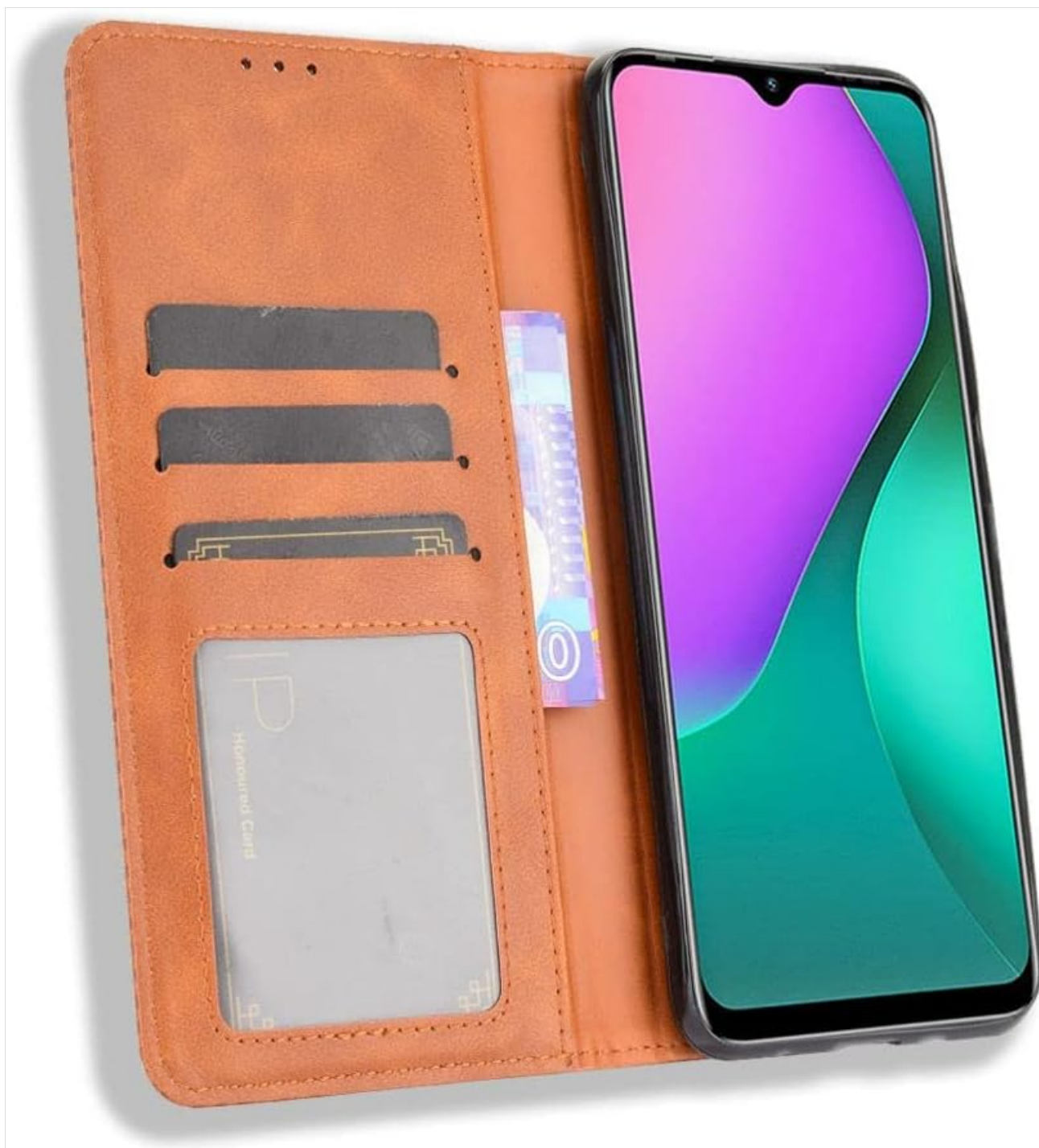
Figure 1: Phone inserted into the case with cards in slots.