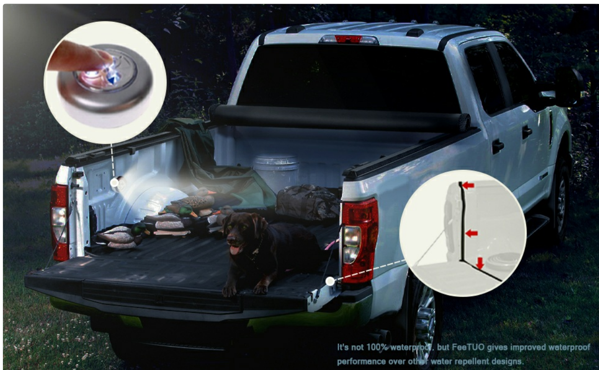
Image: The truck bed with the tonneau cover rolled up, showcasing the included LED light illuminating the cargo area, which includes hunting decoys and a dog.