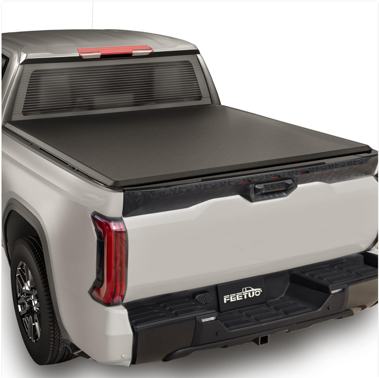
Image: FeeTuo Soft Roll-Up Tonneau Cover securely installed on a truck bed, providing a sleek and covered appearance.