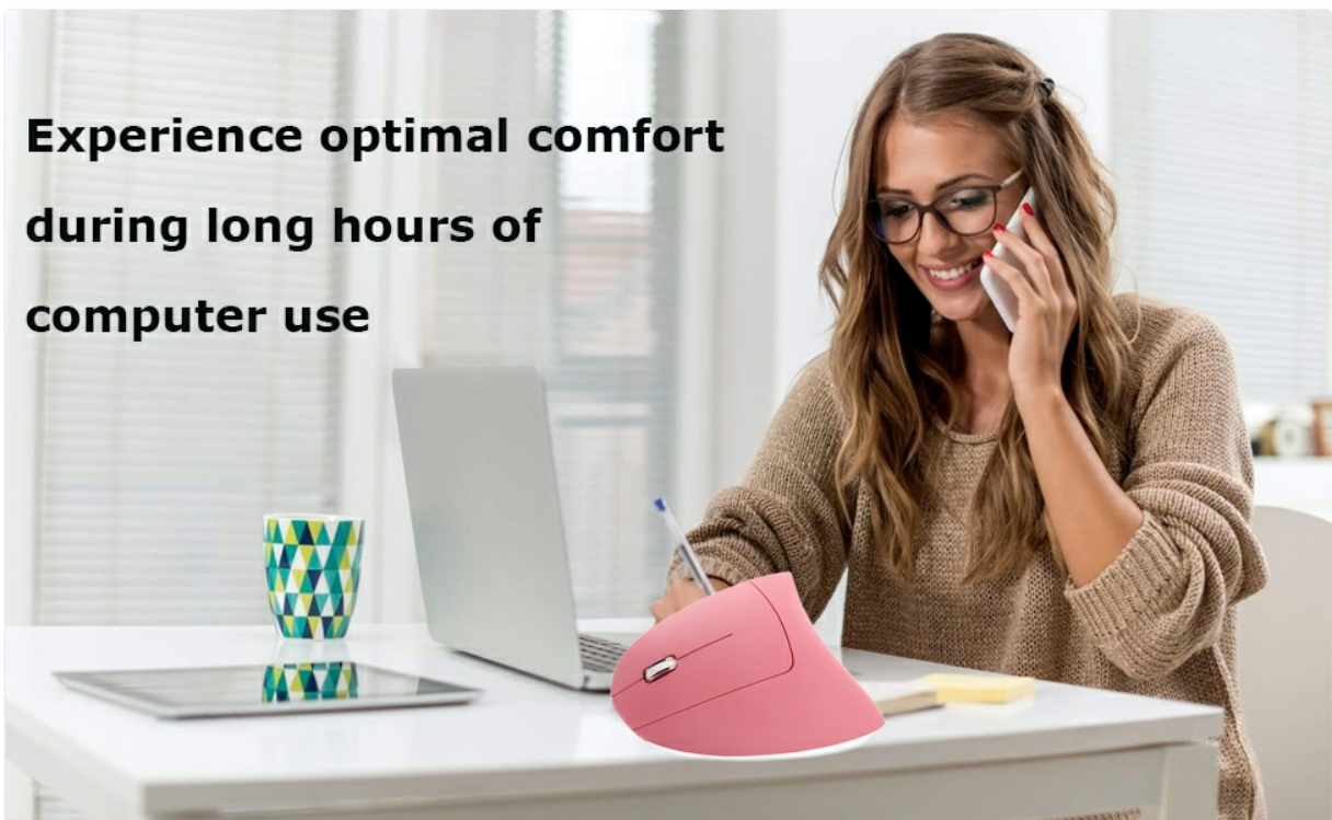
Figure 1: Ergonomic Design for Wrist Comfort. This image illustrates how the vertical design of the mouse promotes a natural hand position, reducing pressure on the wrist compared to a traditional flat mouse. This design is beneficial for preventing and alleviating conditions like carpal tunnel syndrome.

Experience optimal comfort during long hours of computer use