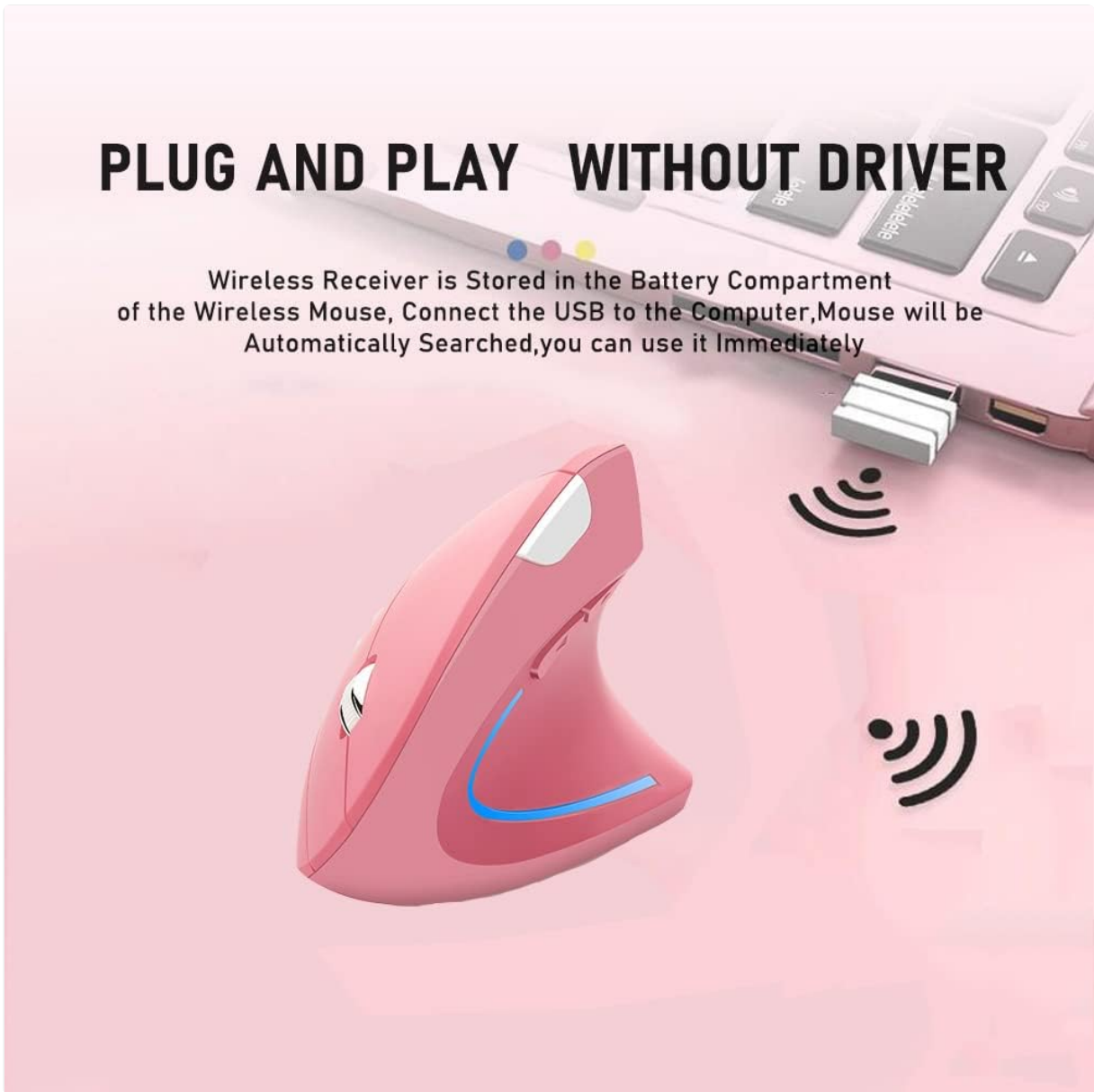
Figure 6: Plug and Play Connectivity. The image demonstrates the simple plug-and-play setup, where the USB receiver is inserted into a laptop, and the mouse is automatically recognized without needing additional driver installation.

Wireless Receiver is Stored in the Battery Compartment of the Wireless Mouse, Connect the USB to the Computer, Mouse will be Automatically Searched, you can use it Immediately