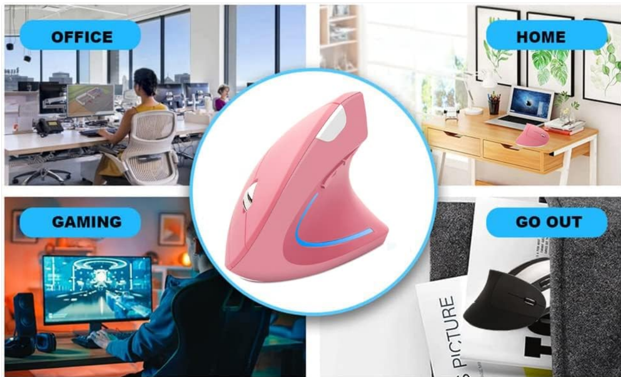
Figure 2: Versatile Usage Scenarios. The mouse is depicted in different environments, highlighting its suitability for office work, home use, gaming, and portability for travel. Its lightweight and simple features make it ideal for various settings.