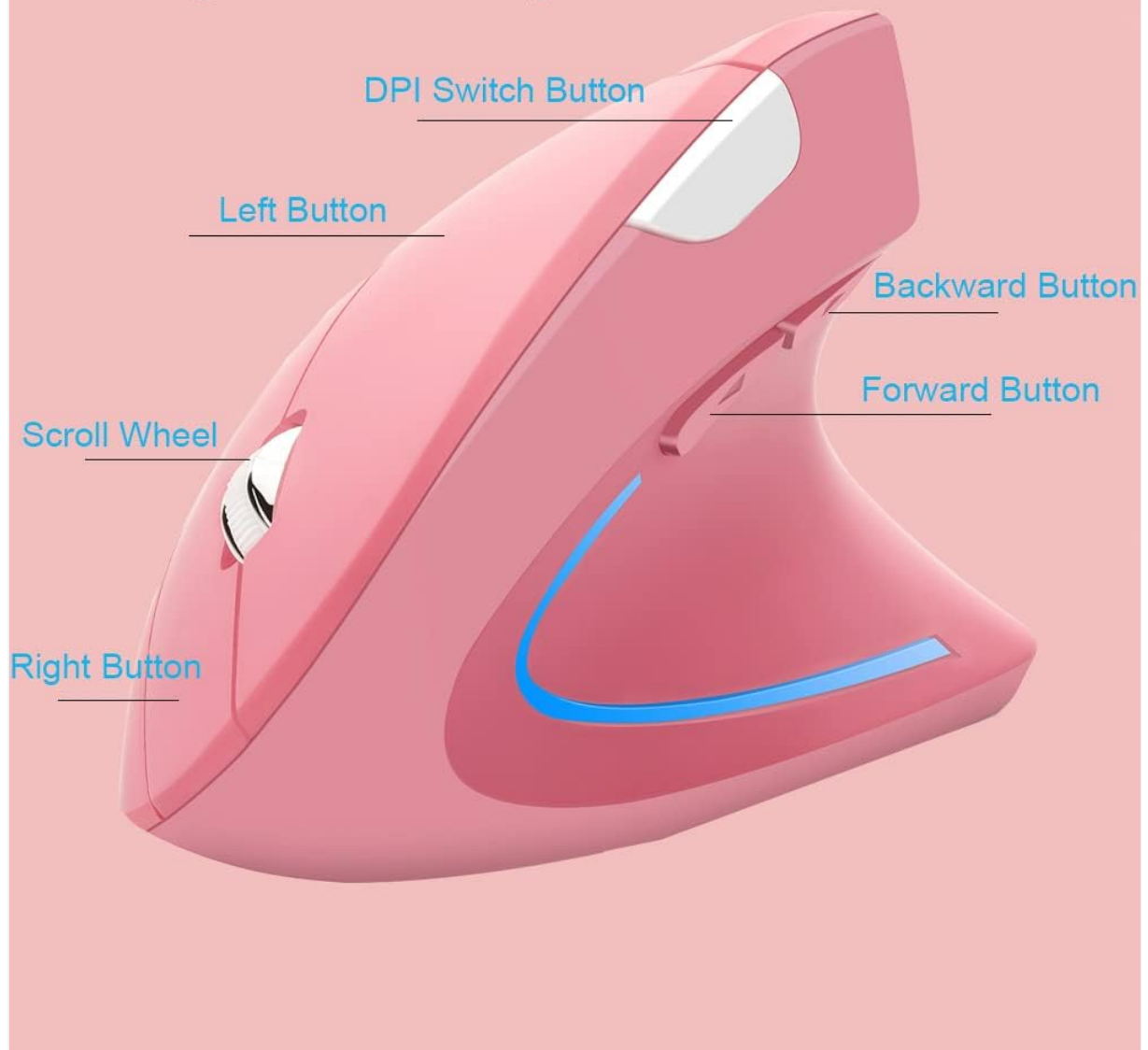
Figure 3: Mouse Button Layout. This diagram labels the key buttons on the ergonomic vertical mouse, including the Left Button, Right Button, Scroll Wheel, DPI Switch Button, Backward Button, and Forward Button, all designed for intuitive use.