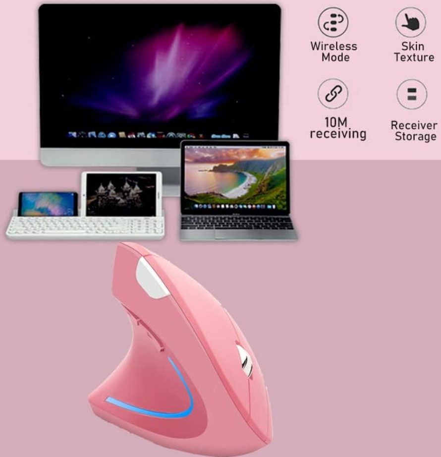
Figure 8: Wide System Compatibility. This image illustrates the mouse's compatibility with various systems, including notebooks, desktop computers, Macs, and Windows, emphasizing its wireless mode, 10-meter receiving range, and skin-friendly texture.

Fully Compatible with Notebook/Desktop Computers, Mac/Windows can be Use