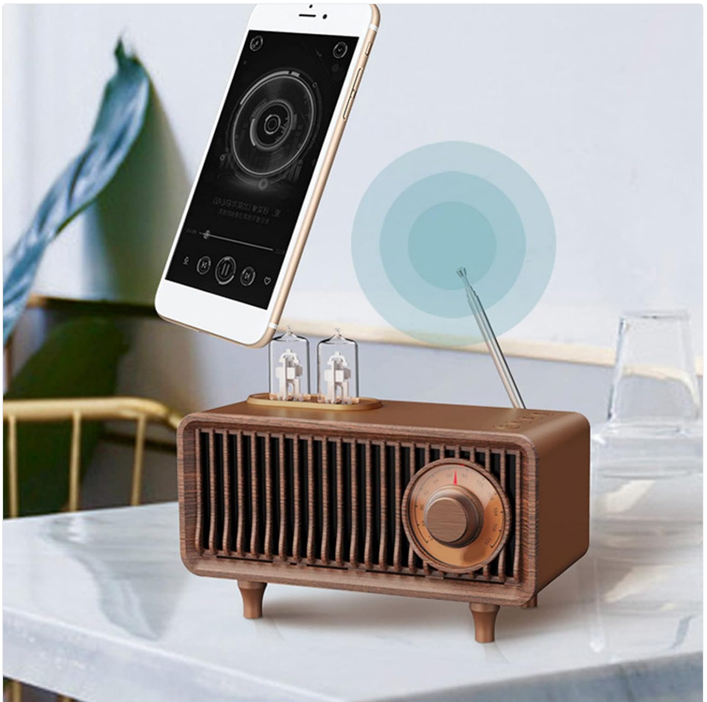
Image Description: The Cuifati Retro Bluetooth Speaker shown on a table with a smartphone hovering above it, indicating a wireless Bluetooth connection. Blue concentric circles emanate from the speaker towards the phone, symbolizing the Bluetooth signal.