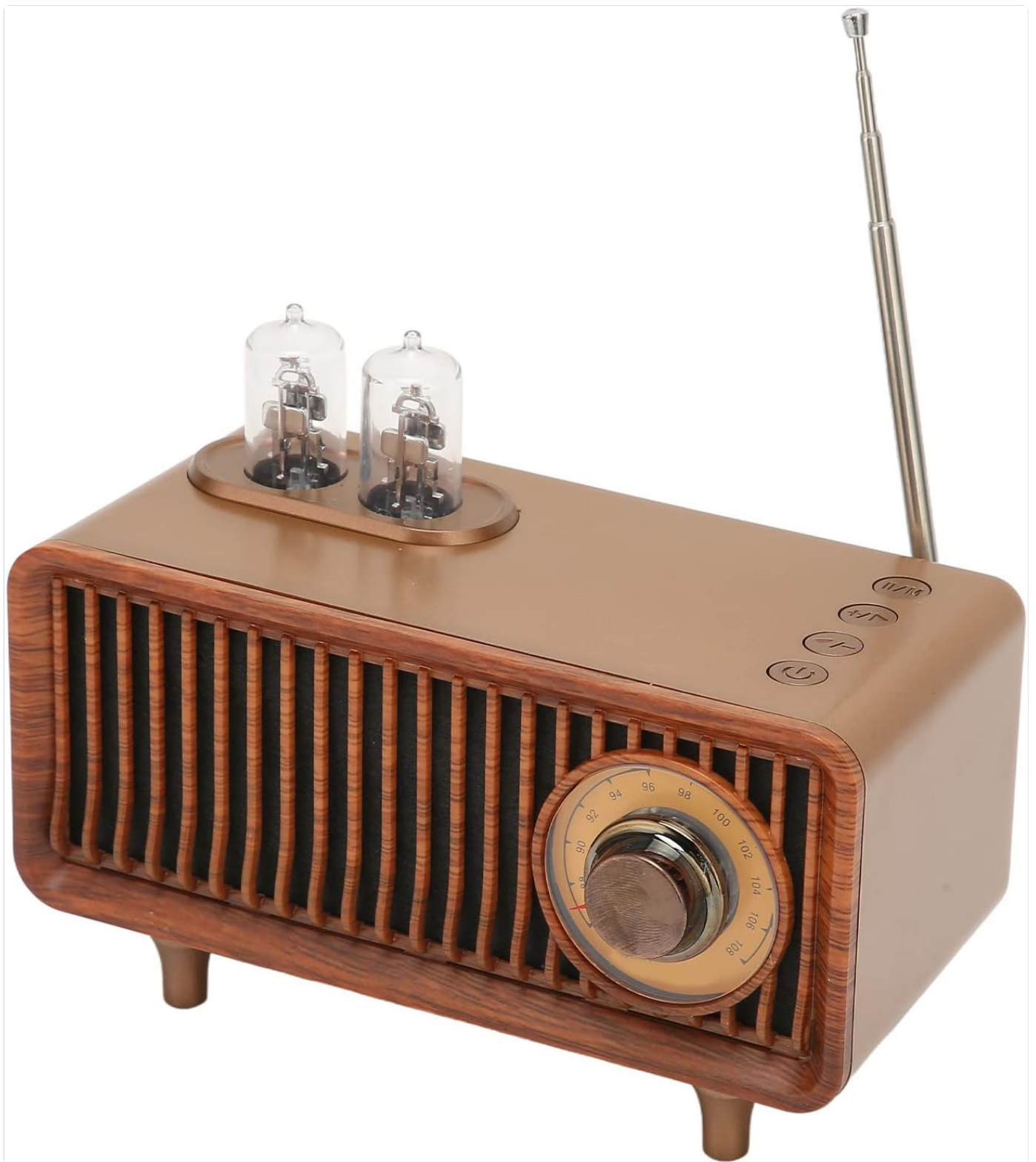
Image Description: A front-angled view of the Cuifati Retro Bluetooth Speaker. It features a wood-grain finish, a prominent speaker grille, a circular radio dial with a central knob, and two decorative vacuum tubes on top. An extendable antenna is visible on the right side.