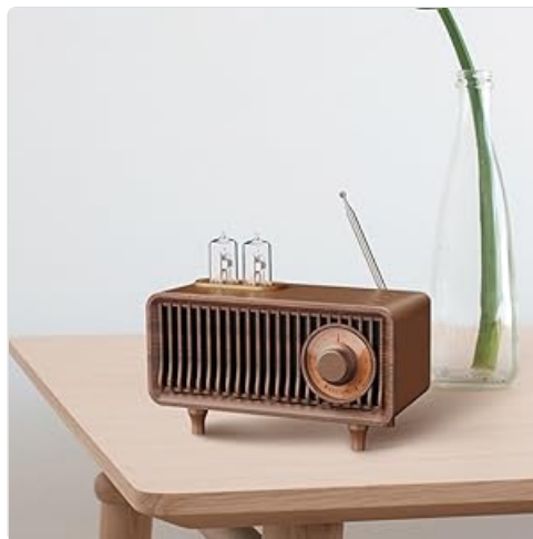
Image Description: The Cuifati Retro Bluetooth Speaker with its two decorative vacuum tubes illuminated with a blue light, indicating the ambient light feature is active.

The vacuum tubes on top of the speaker feature ambient lighting. The specific control method for these lights is not detailed in the provided information. Typically, a short press of the Power button or a dedicated light button (if present) cycles through light modes or turns them on/off. Please refer to the physical product for any specific markings or try a short press of the power button.