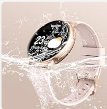
Image: Smartwatch being splashed with water, illustrating its 5ATM waterproof rating.

The Moowhsh Smartwatch G35 is 5ATM waterproof, splash-proof, and dust-proof. This means it can withstand splashes, rain, and brief immersion in shallow water. However, it is not suitable for hot showers, saunas, or diving. Avoid prolonged exposure to water to ensure device longevity.