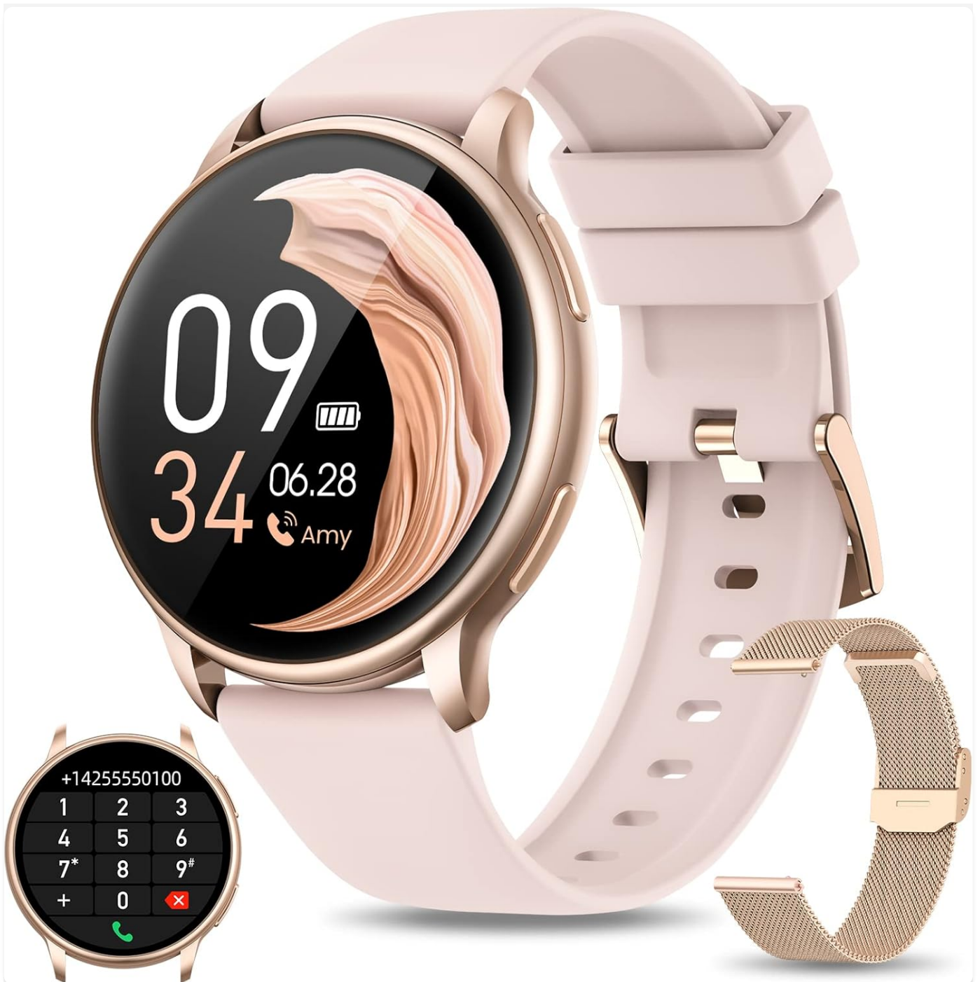
Image: Moowhsh Smartwatch G35 in pink with an additional metal band and charging cable.