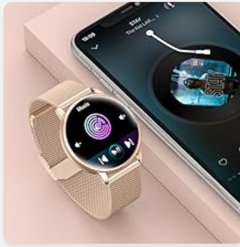
Image: Smartwatch displaying a music control interface, with play/pause, skip forward/backward options, next to a smartphone playing music.