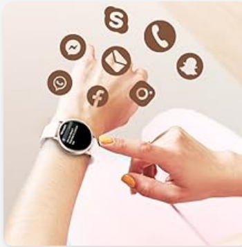
Image: A hand pointing to the smartwatch display showing various app notification icons like WhatsApp, Facebook, Instagram, and SMS.