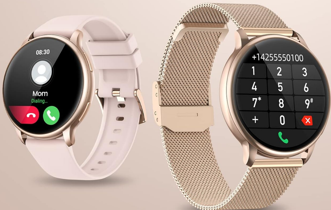
Image: Smartwatch displaying call interface with options for crystal quality mic, high-fidelity speakers, answer/make call, call records, and sync contacts.

Your browser does not support the video tag.