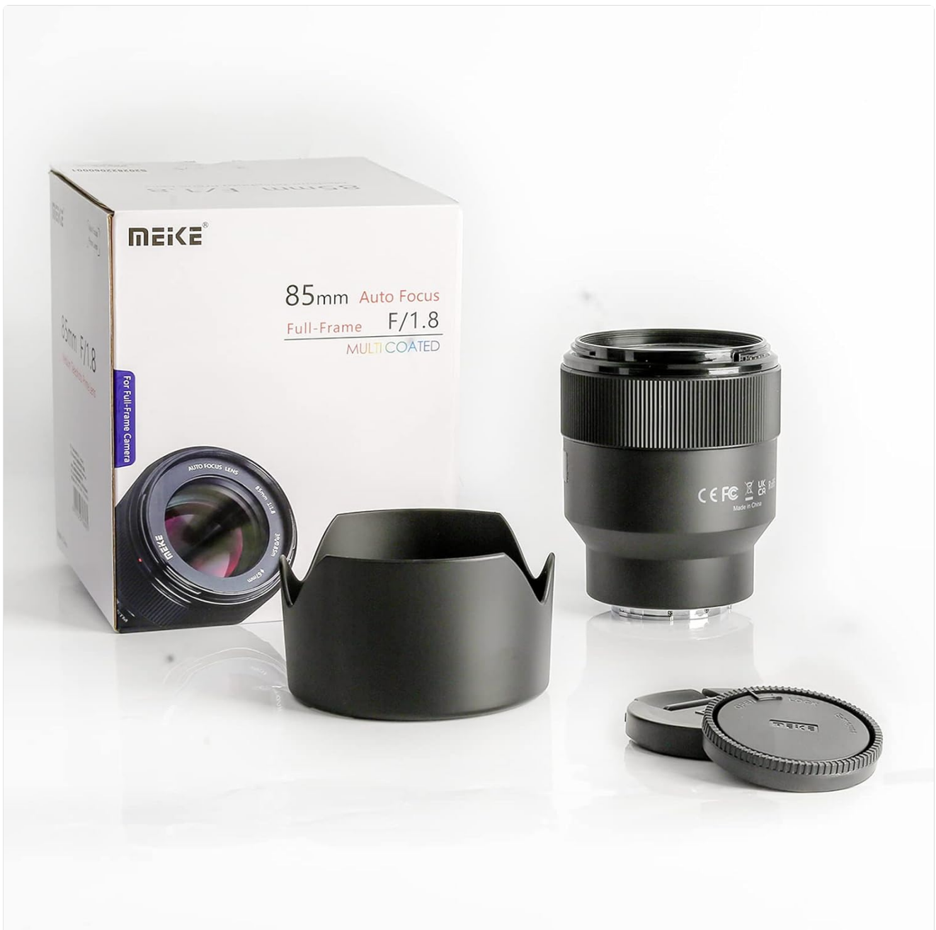
Figure 3.1: Contents of the Meike 85mm F1.8 Lens package, including the lens, lens hood, and caps.