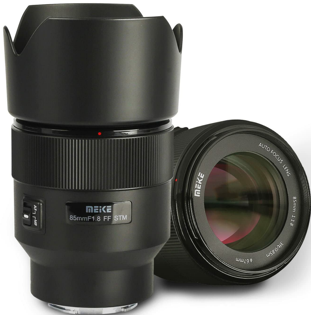
Figure 1.1: Meike 85mm F1.8 Full Frame AF STM Lens