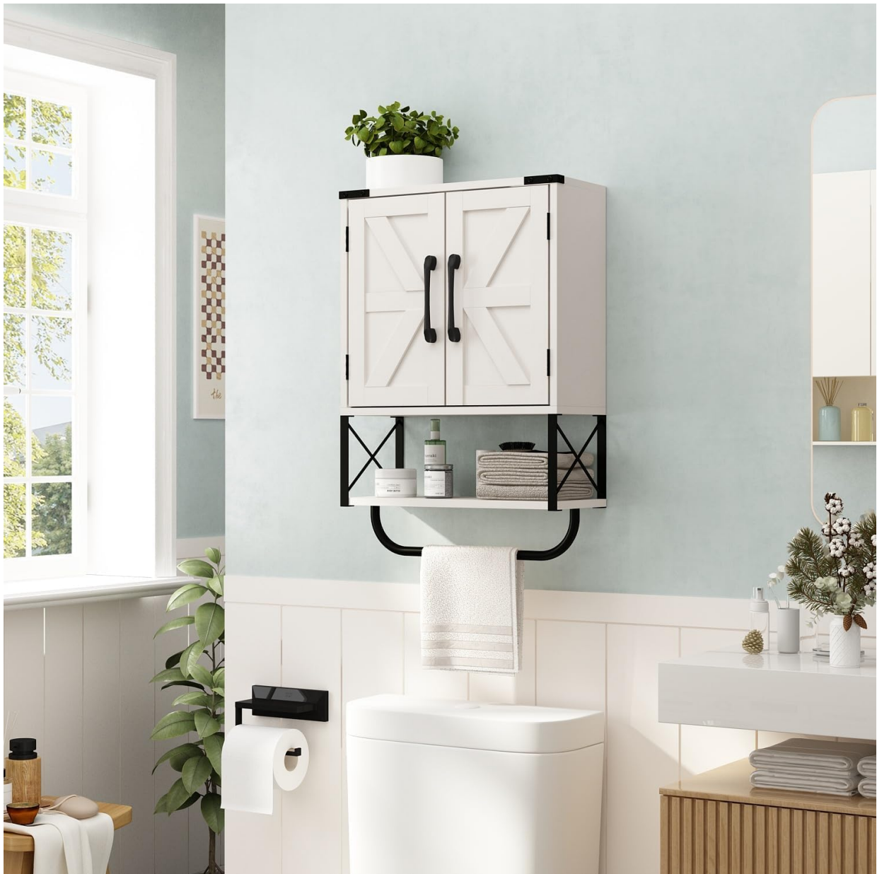
Image: Example of the cabinet installed above a toilet in a bathroom setting.