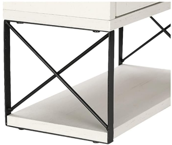
X-shaped Hollow Iron Open Shelf

Image: Detailed view of the cabinet's rustic vintage surface design, corner protection, black metal handles, and X-shaped open shelf supports.