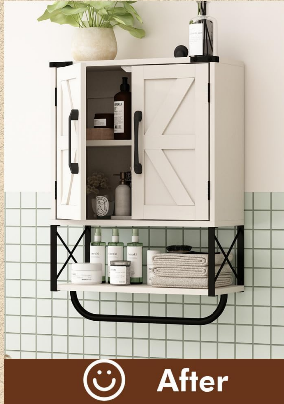
Image: Visual representation of the cabinet's organizational benefits.