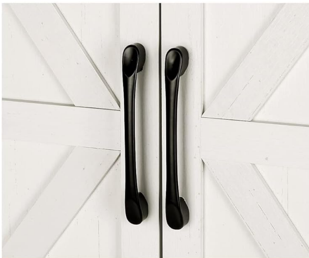
Handmade Black Metal Handle