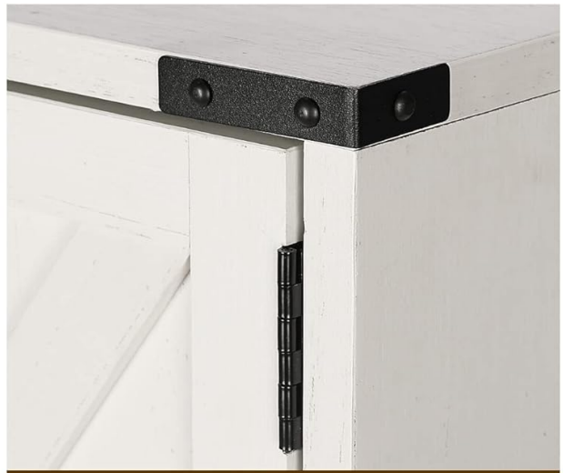
Exquisite Corner Protection