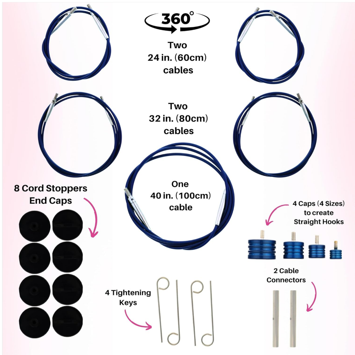
Image: An arrangement of the interchangeable components, including two 24-inch cables, two 32-inch cables, one 40-inch cable, 8 cord stoppers, 2 cable connectors, and 4 tightening keys. Also shown are 4 caps (4 sizes) to create straight hooks.