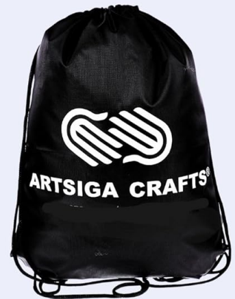
Image: A black Artsiga Crafts project bag with a drawstring and shoulder straps, shown alongside various crochet and knitting needles, illustrating its use for organizing craft projects.

The Artsiga Crafts Bag (13 x 16 inches) helps organize your projects while representing our commitment to quality, accuracy, and exceptional customer service.