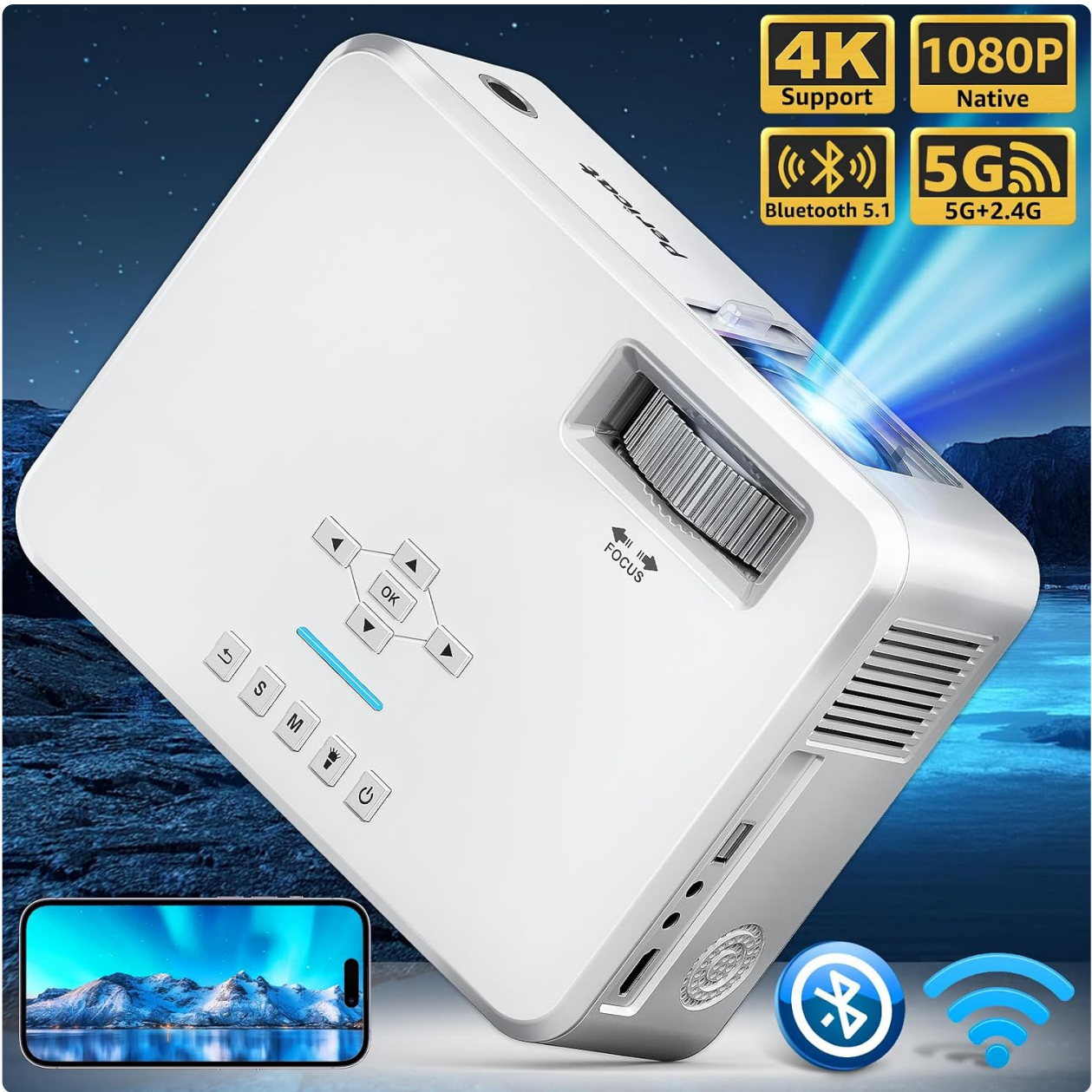
Image: Top panel with navigation buttons (arrows, OK), return, source, menu, light, and power buttons. Focus wheel is visible on the side.