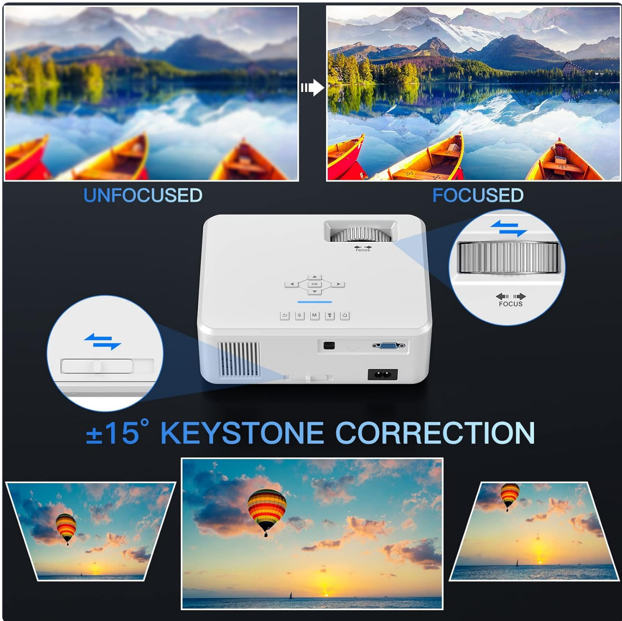
Image: Visual guide for adjusting focus and keystone correction on the projector.