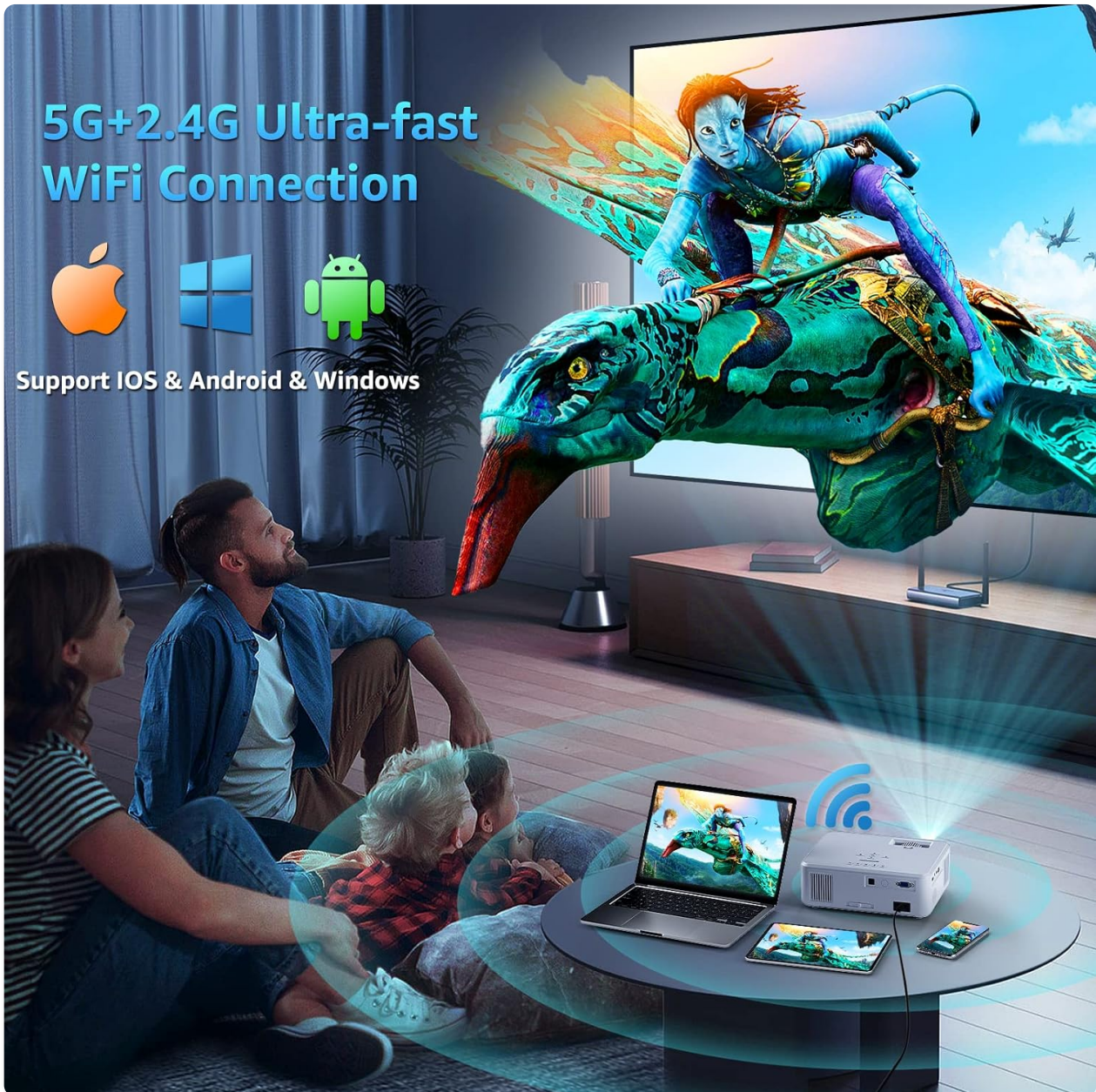
Image: Visual representation of 5G+2.4G WiFi screen mirroring with iOS, Android, and Windows devices.

Video: Step-by-step guide on how to connect the projector with an iPhone for screen mirroring.