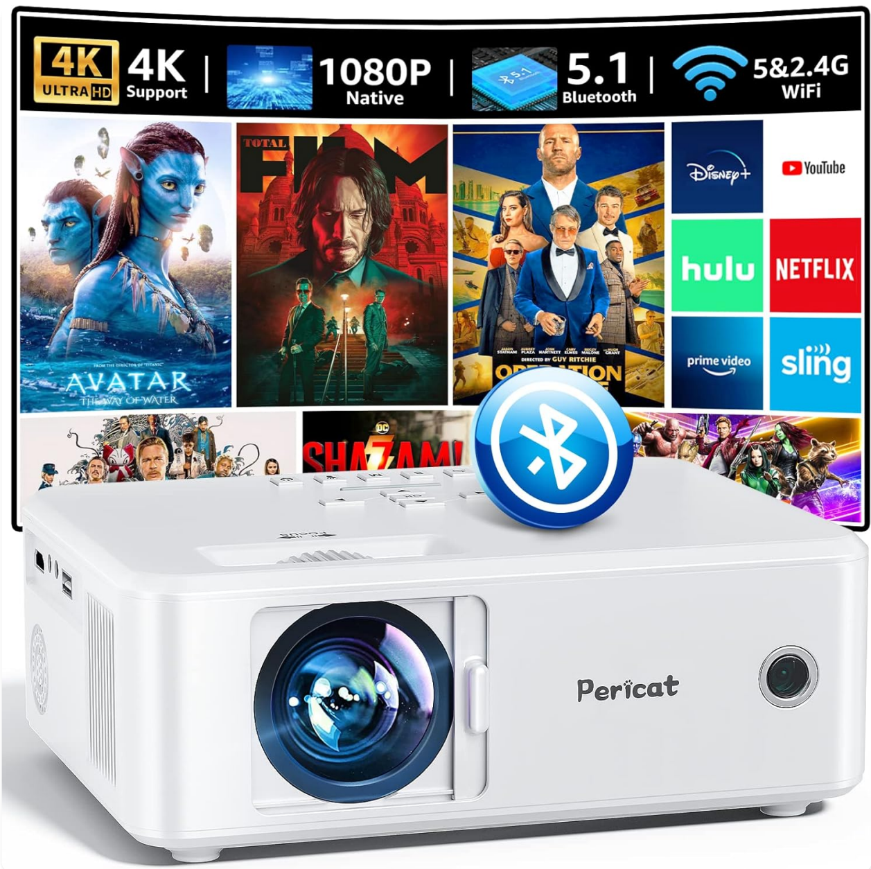
Image: The front of the projector showing the lens and 'Pericat' branding.