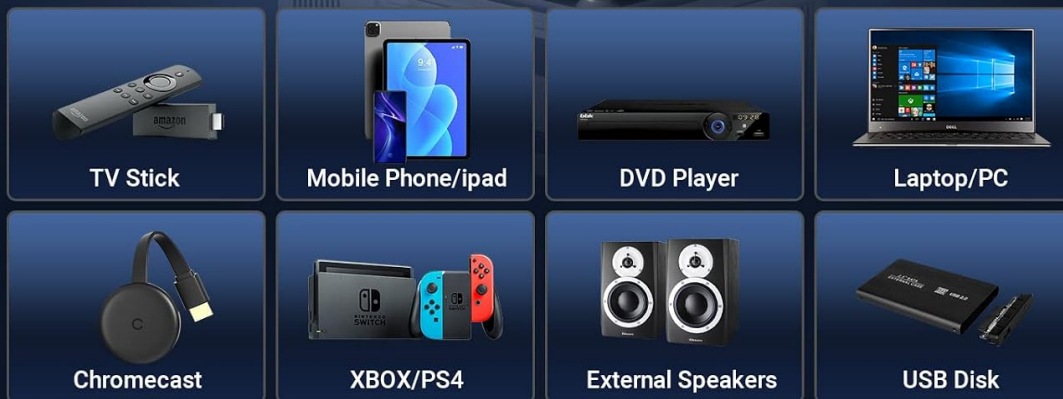
Image: Examples of multiple devices connecting to the projector, including TV sticks, phones, DVD players, laptops, and external speakers.