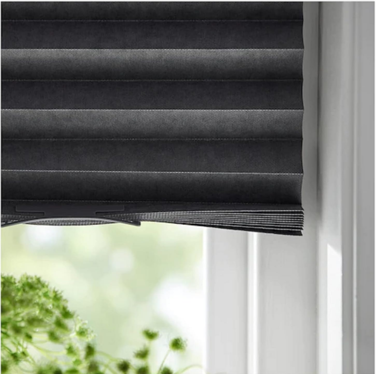
Figure 4.2: The bottom edge of the blind, showing the pleated fabric and the hook-and-loop fastener used to secure it when fully closed.