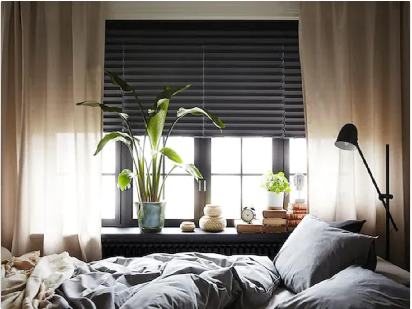
Figure 1.2: The SCHOTTIS blind installed in a bedroom window, effectively blocking external light and contributing to a darker room environment.