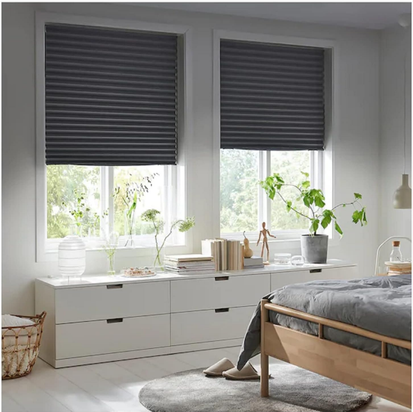
Figure 5.2: Two IKEA SCHOTTIS Block-Out Pleated Blinds installed on windows in a room, demonstrating their appearance and light-blocking capability.