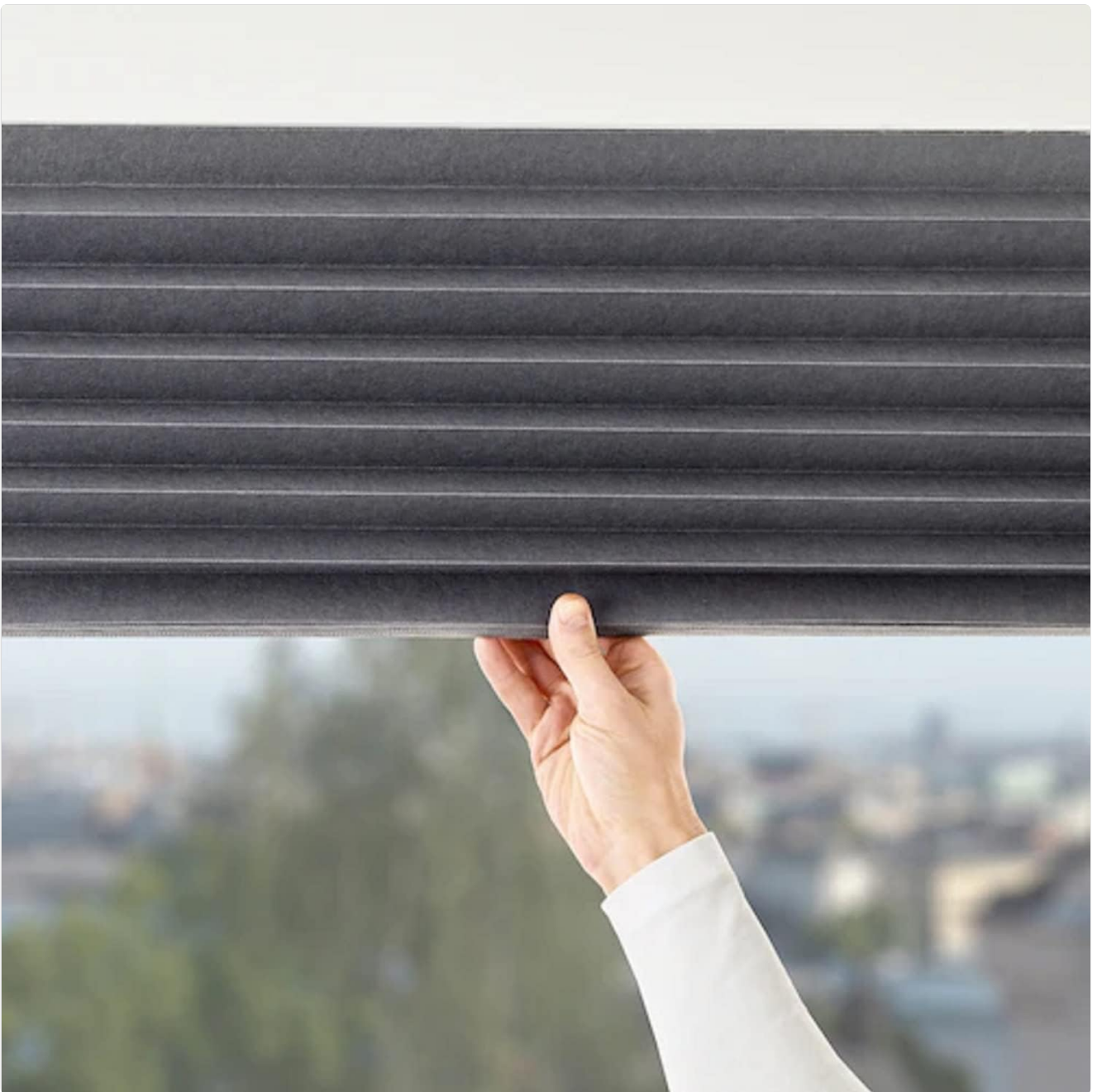
Figure 5.1: A hand gently pushing the pleated blind upwards, demonstrating the manual operation to raise or lower the blind.