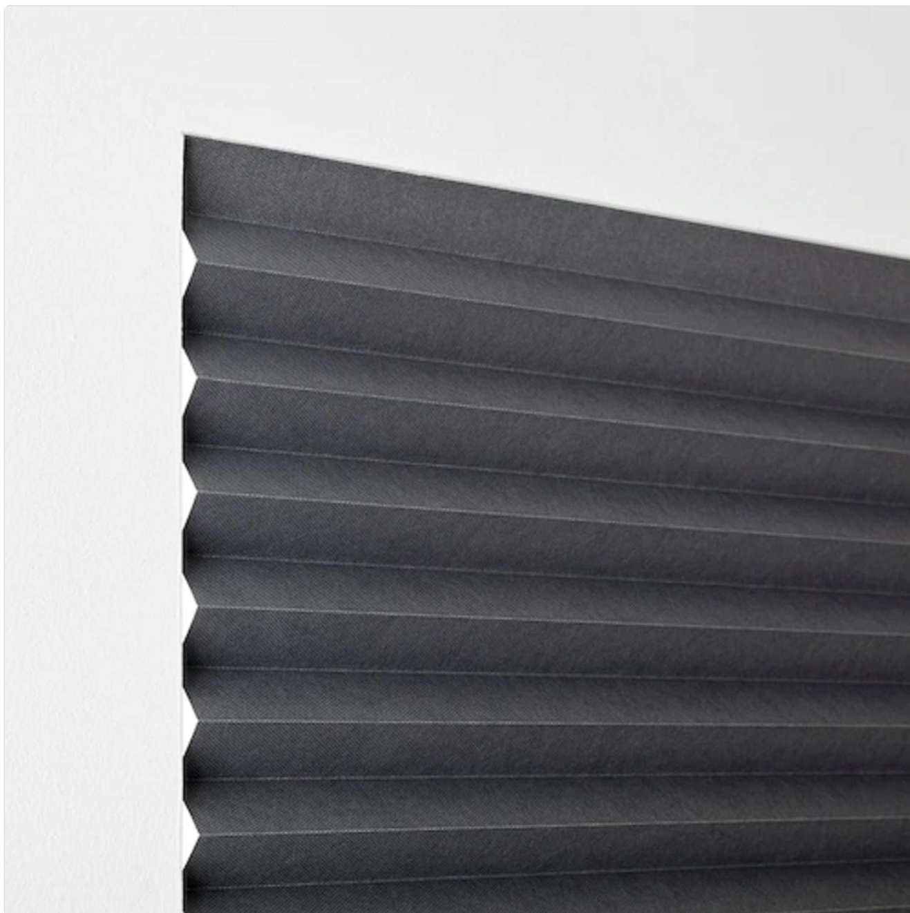
Figure 4.1: Detail of the pleated blind's top edge, illustrating the adhesive strip for easy, no-drill installation on a window frame.