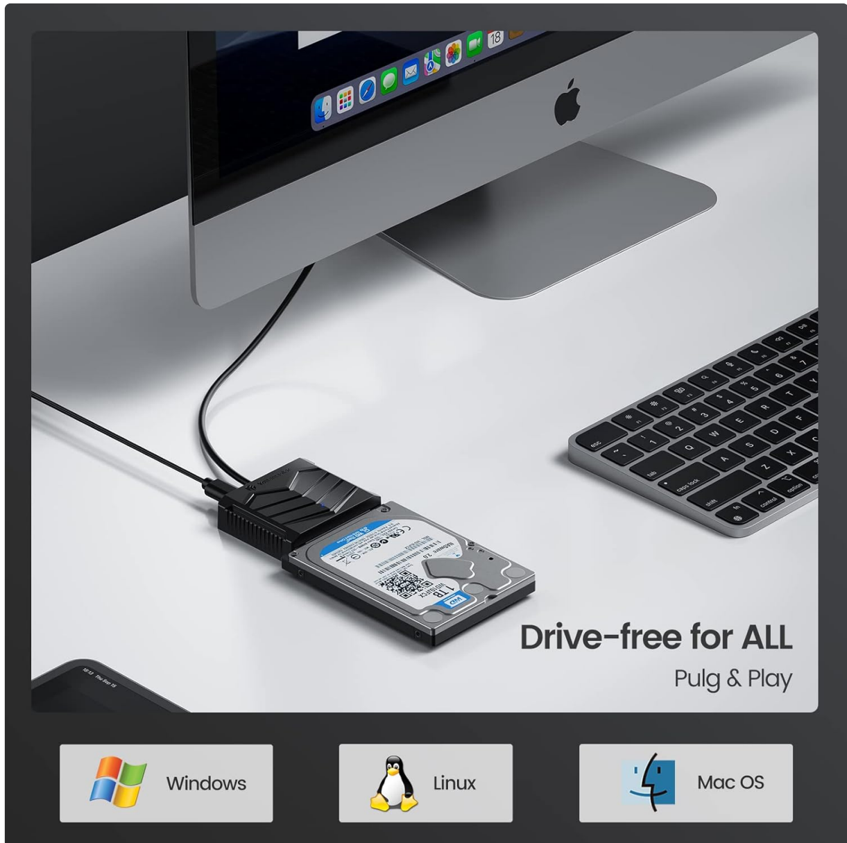
Image: Yottamaster adapter connected to a 2.5-inch hard drive and a desktop computer, demonstrating driver-free plug-and-play compatibility with Windows, Linux, and macOS.

Once connected, your operating system should automatically detect the drive, making it ready for use.