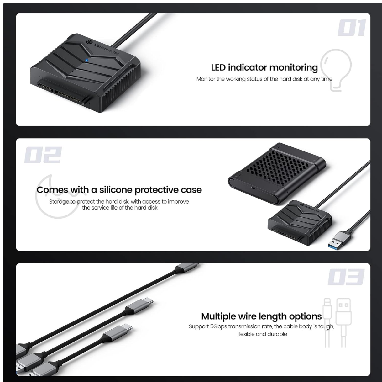
Image: Diagram illustrating key features of the Yottamaster adapter: an LED indicator for status, a silicone protective case, and various cable length options.