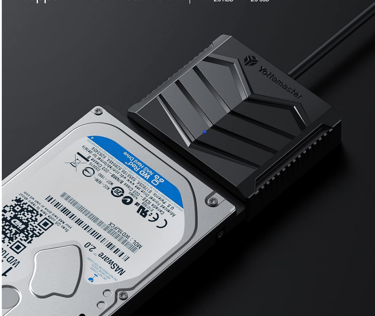
Image: Yottamaster SATA to USB 3.0 adapter connected to a 2.5-inch hard drive, illustrating its compatibility with 2.5-inch SATA SSDs and HDDs up to 6TB.