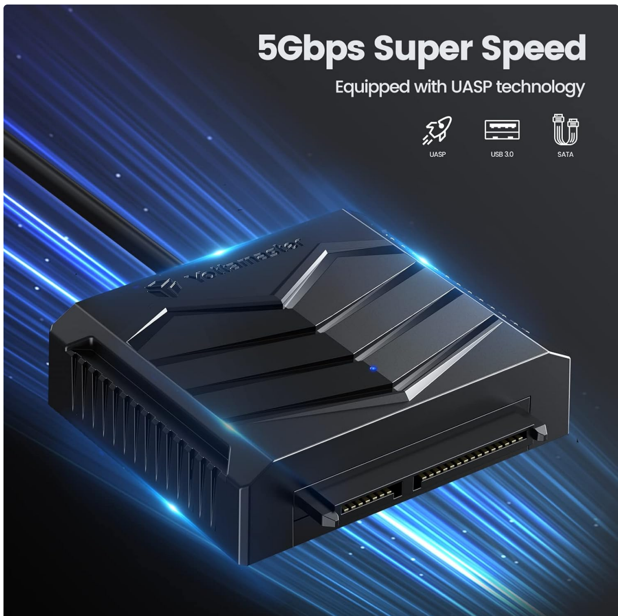
Image: Close-up of the Yottamaster SATA to USB 3.0 adapter, emphasizing its 5Gbps Super Speed data transfer rate and UASP support.