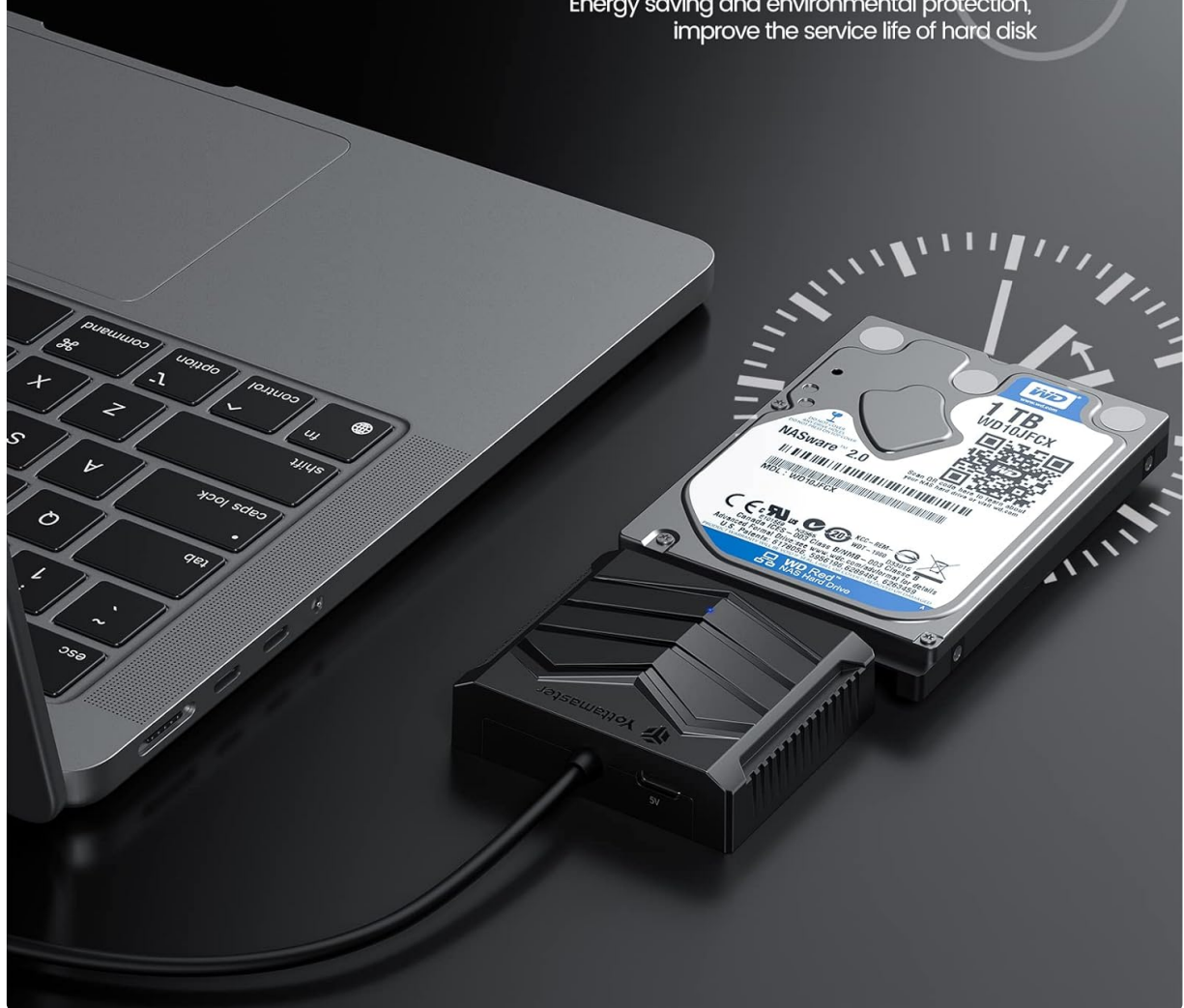
Image: Yottamaster adapter connected to a 2.5-inch hard drive and a laptop, illustrating the auto-sleep mode for energy saving and extended drive life.

Energy saving and environmental protection, improve the service life of hard disk