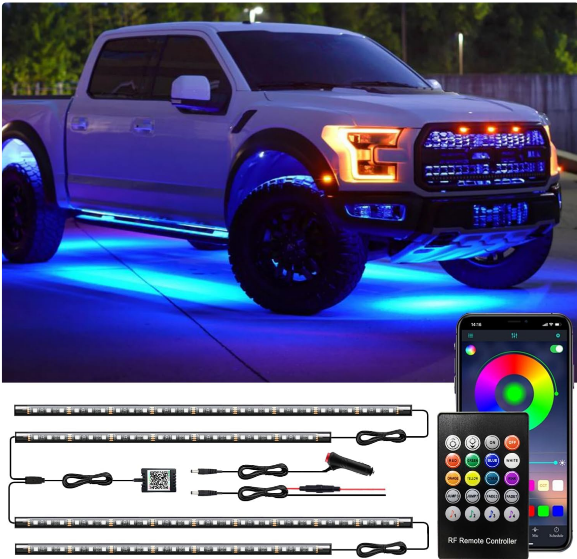
Image 1.1: Yielinth Underglow Kit installed on a vehicle and its components.