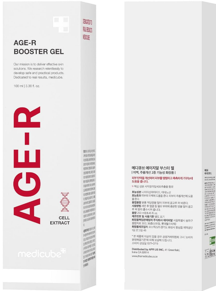
Image: Front and back view of the Medicube Age-R Booster Gel Serum packaging.