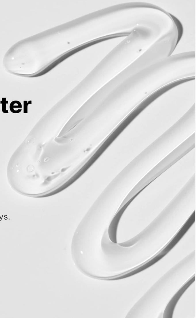
Image: Detailed view of the clear, gel-like texture of the Age-R Booster Gel Serum.

Contains enzymes, vitamins, and other skin nutritive substances that benefit skin in numerous ways.