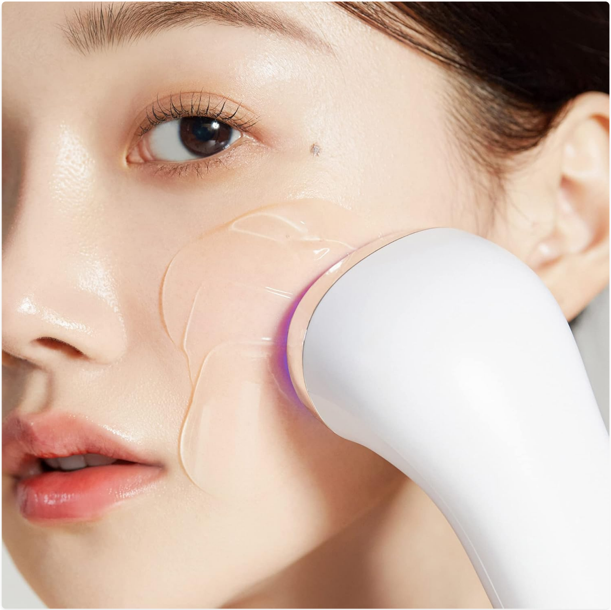
Image: A woman demonstrating the application of Medicube Age-R Booster Gel Serum with a facial device.