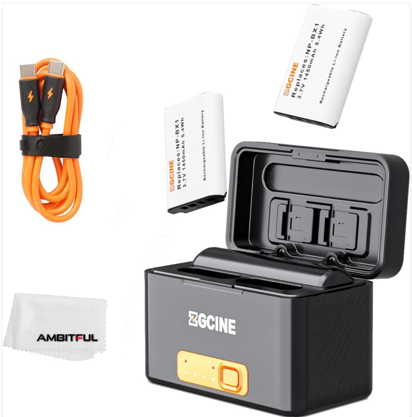
Image: The ZGCINE PS-BX1 Battery Charging Case shown with two Sony NP-BX1 batteries, a USB-C charging cable, and a cleaning cloth.